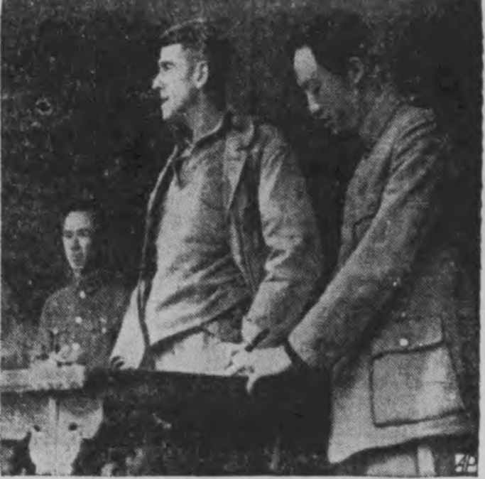
'TELL IT TO THE MARINES' was thrown into reverse by Capt. Evans F. Carlson of U. S. marines, who's telling the Chinese in this view, taken when Carlson visited leaders of China's Eighth Route army during a tour of the war.