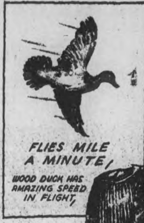
FLIES MILE A MINUTE! WOOD DUCK HAS AMAZING SPEED IN FLIGHT.