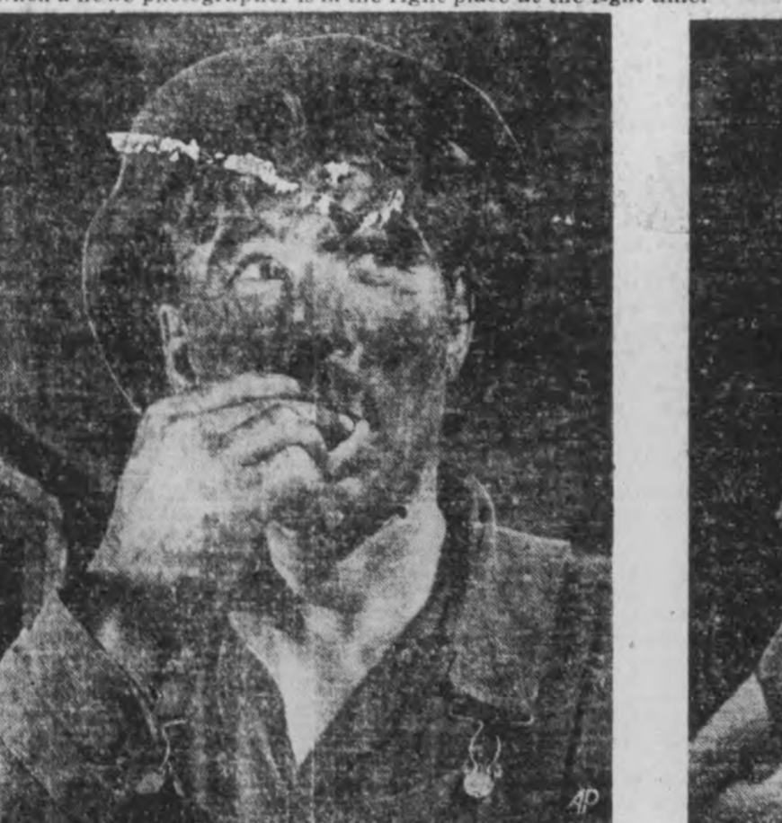
(Above)—TWO FLASHBULBS giving the effect of cross-lighting made possible this study of a Dakota wheat farmer, bringing out in remarkable detail the man's facial features at the end of his day's work.