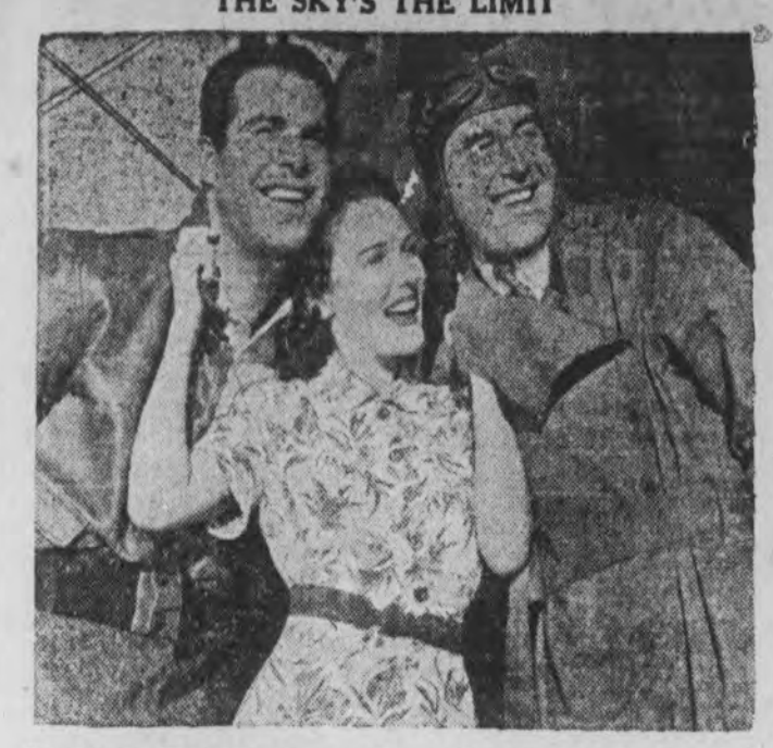
Romancers—Fred MacMurray, Ray Milland and Louise Campbell in "Men With Wings," Pitt Sun-ay-Monday.

The Bureau of Home Economics says that farm families that net $600 a year after paying all expenses get ahead financially.