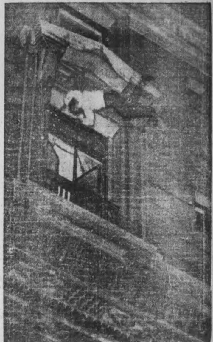
(Right)—A FRACTION OF A SECOND sooner, or a moment later, and this picture could not have been made. It caught the climax of a situation which had kept newspaper readers on edge for hours as young John Warde pondered his fate and finally leaped to death from a New York hotel window ledge.