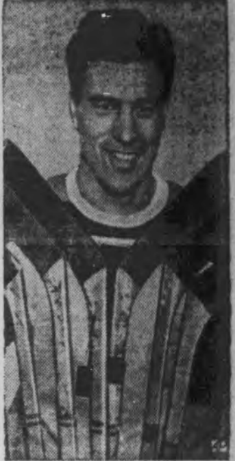
'ZERO' Frankie Brimsek (above), hockey's newest sensation who counts his night ruined if the opponents score, is a goalie with the Boston Bruins. He's 23 years old.