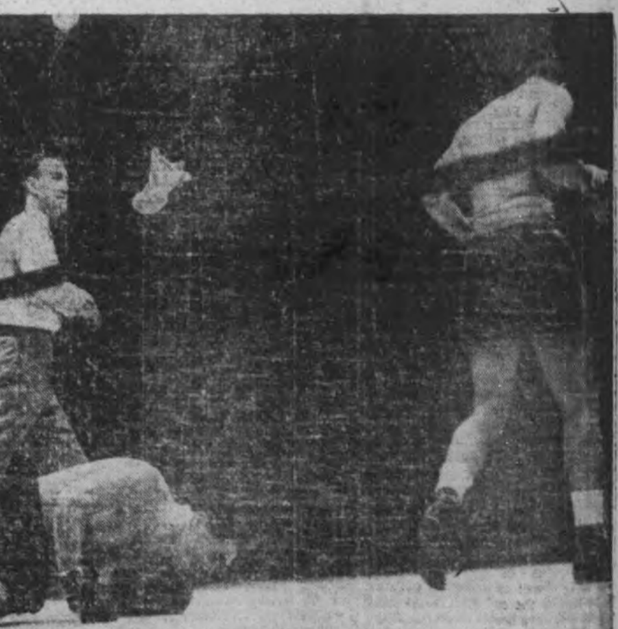
(Above)—THE TOWEL didn't mean anything officially, but alert photography caught it in mid-air as the Schmeling-Louis bout ended with the German challenger on the floor and Joe Louis walking to his corner—the winner. A second later the picture was gone.