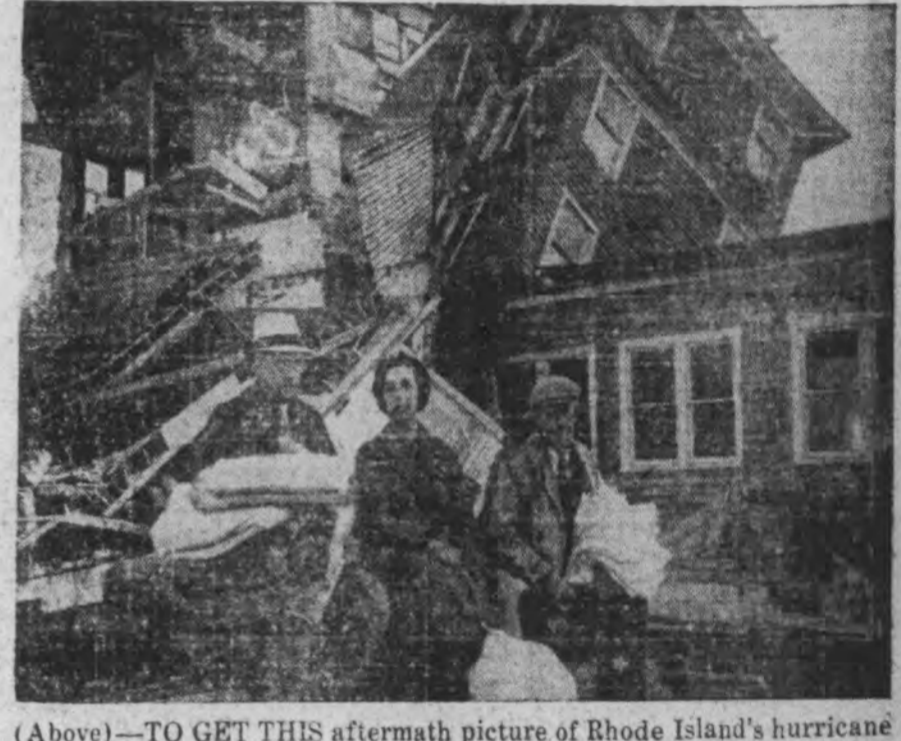
(Above)—TO GET THIS aftermath picture of Rhode Island's hurricane scene, it was necessary to employ exceptional camera technique resulting in perfect focus of the people in the foreground as well as the damaged buildings in the background. Use of two flashbulbs plus a time exposure turned the trick.