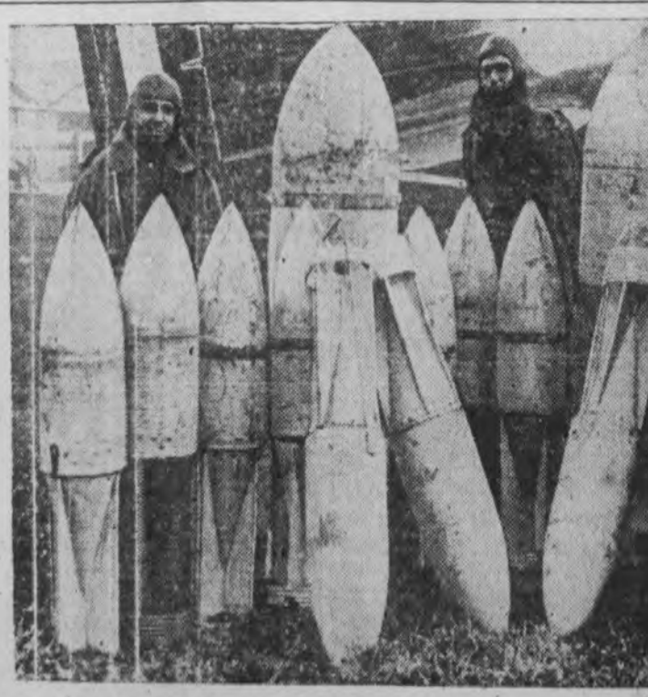
WITH DEATH AS A FELLOW FLYER, these Italian aviators sped through the air carrying about two tons of bombs in their plane. They averaged 280 m.p.h. over 12,000-mile course.

In the Bell Arthur news item last week published in The Daily Reflector, the writer expressed the delight of her community in having