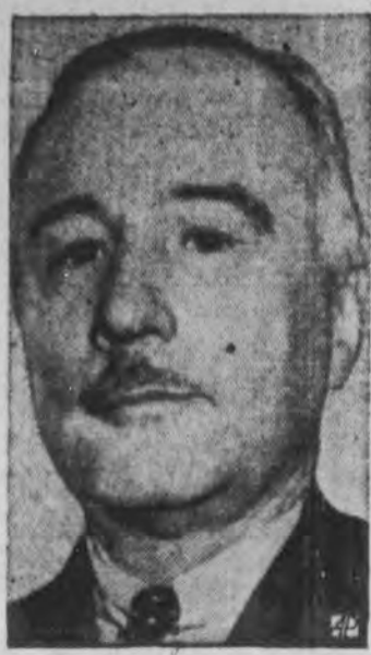
NEW WPA CHIEF Col. Francis C. Harrington (above), who was named acting head of works progress administration, brings a wealth of army experience to the job. He succeeds Harry Hopkins, and has been chief WPA engineer since 1935.

McCormick Music Co. 121-123 West 4th Street Phone 558 E. C. A. Victor Distributor