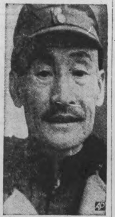
GUERRILLA war is being directed by Gen. Ma Chan-shan, hero of China's resistance to Japanese conquest of Manchuria.

One of the earliest printed picture books is the "Pictured World" by John Amos Comenius, issued in 1657.