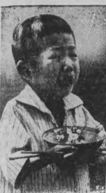
A Chinese refugee child in Hankow walls at his plight.