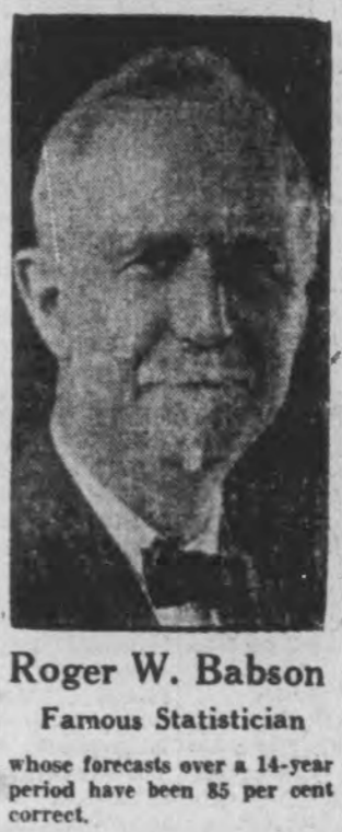
Roger W. Babson Famous Statistician whose forecasts over a 14-year period have been 85 per cent correct.