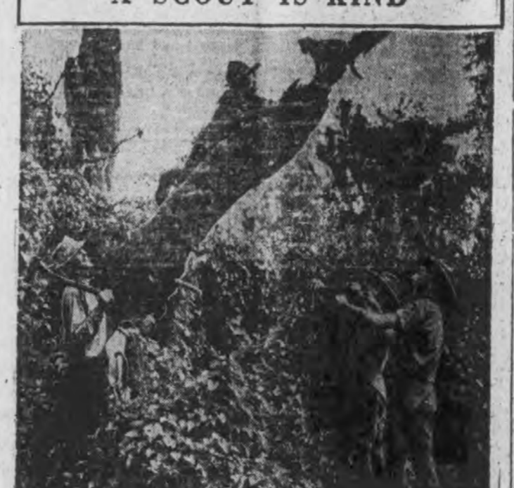
"RESCUE your pet cat, madam?" All in a day's adventure for Senior Scouts (Boy Scouts past their 15th birthday) in this good turn for a stranded pussy. The culprit who caused the feline's dilemma is now securely held by the woodsman.

GINNING at W. J. Carney's corner in the run of Grindal Creek in the center of several gums, and running thence North 50 1-2 degrees East 406 poles to several small trees in the edge of Jones' Branch; thence North 2 degrees East 80 poles to an oak stump in the edge of Mog's Island; thence down the branch to the said Guilford Moore's own line; thence with his line South 51 1-4 West 348 poles to a pine on the road; thence with the road South 45 East 101-4