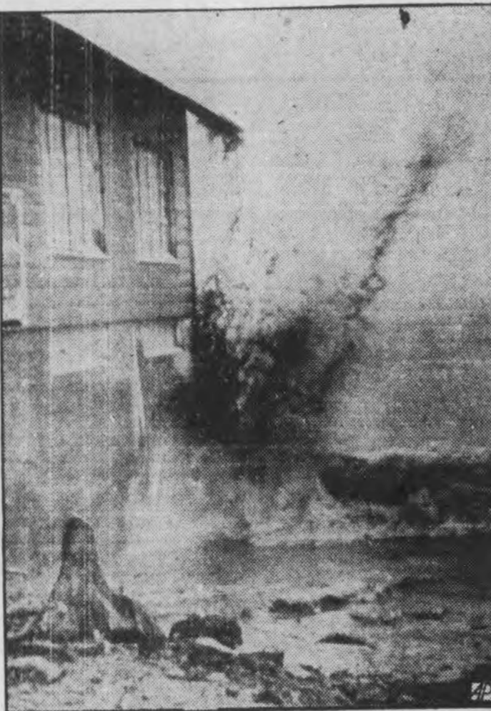
Wnpped up by gale winds that attended winter's worst storm, 25-foot waves battered the shore of Lake Erie at Buffalo, N. Y. The water is shown battering a summer resort. Meanwhile the police stretched ropes along streets in Buffalo to aid pedestrians in making their way along.