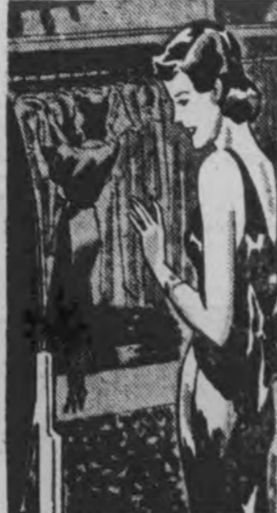
Save More Money! Watch For The January Sale Ads!