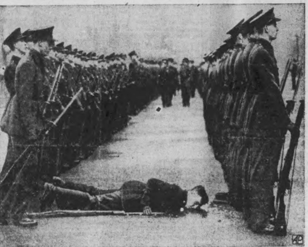
PROBLEM IN MILITARY ETIQUET was solved when cadet who fainted during inspection at Woolwich, England, recovered before Viscount Gort (center) reached end of line.