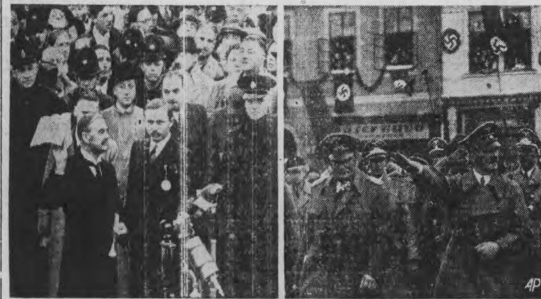
IN ENGLAND—Chamberlain shows off German friendship agreement upon return from the four power conference. IN CZECHOSLOVAKIA—Hitler triumphantly enters the Sudeten area on the heels of his army.

By VOLTA TORREY AP Feature Service Writer "Out of this nettle, danger, we plucked this flower, safety." Thus Neville Chamberlain summarized September's sorry story.