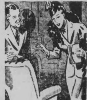
PLANNING To Refurnish? You'll Find Great Values in the January Sale Ads!