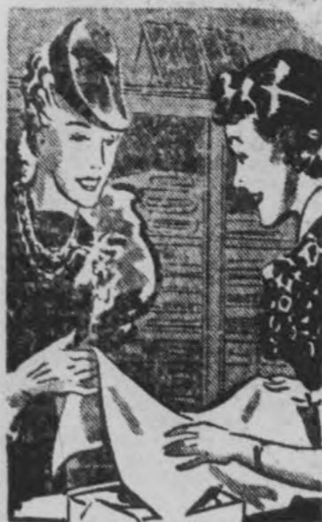
STOCK UP On Linens During the January Sales!

THERE is a lesson in economy and convenience to be learned from reading Daily Reflector ads. Folks in Greenville and vicinity who check them every day know it! Just a few minutes reading the ads helps them cut hours off their shopping trip. For they shop at HOME first, using the Reflector as a guide in saving money—pleasantly!