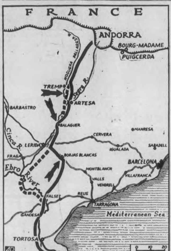
This map illustrates the general scene of battle in Gen. Francisco Franco's offensive aimed at breaking Spanish Loyalist lines and seizing Catalonia. The arrows point to towns which are the objectives of his bitter fighting. The heavy black line indicates the battle front after Franco's advances since December 23. The broken lines denote the front before the beginning of the offensive.