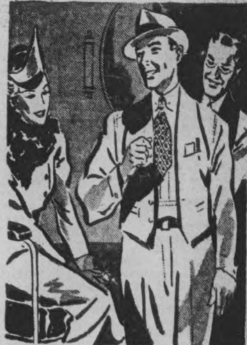
DRESS UP the Entire Family! Check January Sale Ads For Big Savings!