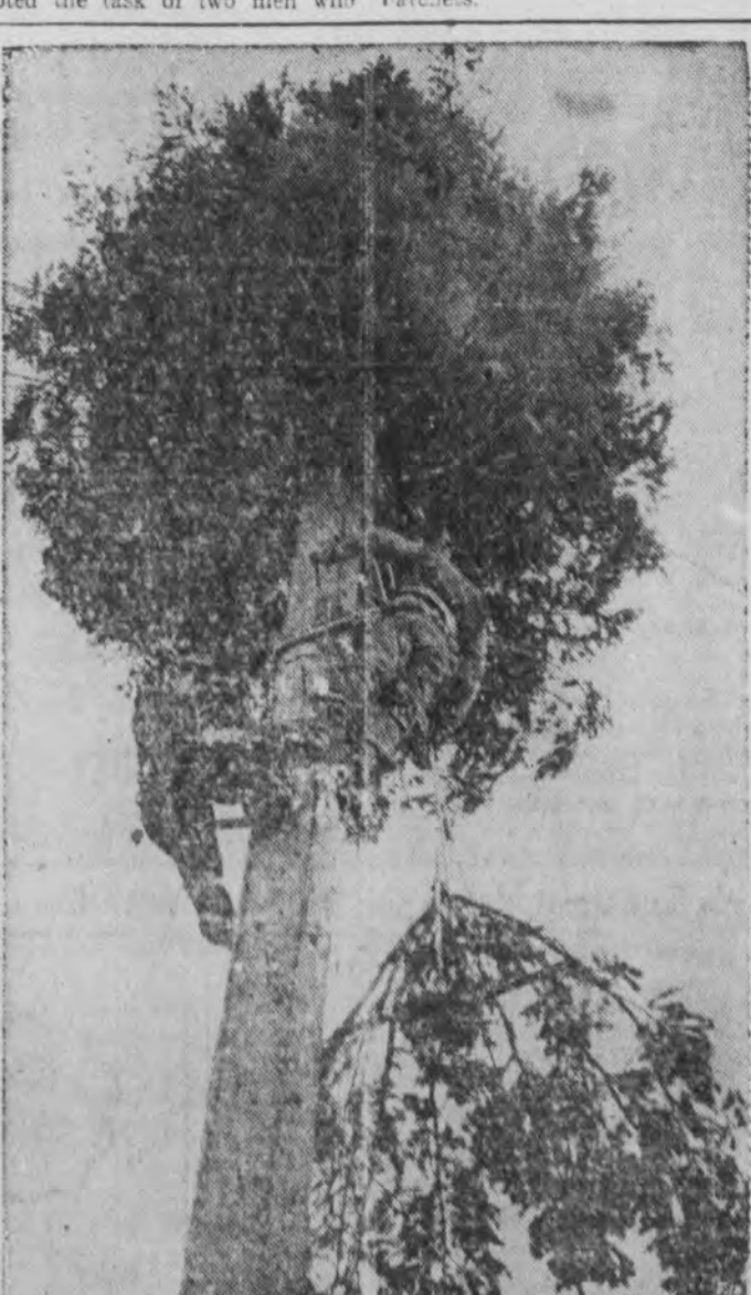
REBUKING NATURE, which failed to provide them with a tall tree to fit their needs, Denver city officials had a Christmas tree tailor-made in the civic center there. The tree with its telephone pole "trunk" is 75 feet high, and more than 970 electric lights twinkled from the finished product. Technique for Christmas-tree building is shown in this photo.