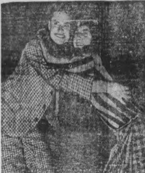
1. EVEN THE DANCERS junked the crazy old big apple and went on to more reasonable things. Here a couple of U. of Penn boys interpret that triumph of logical rhythm—the jam session.