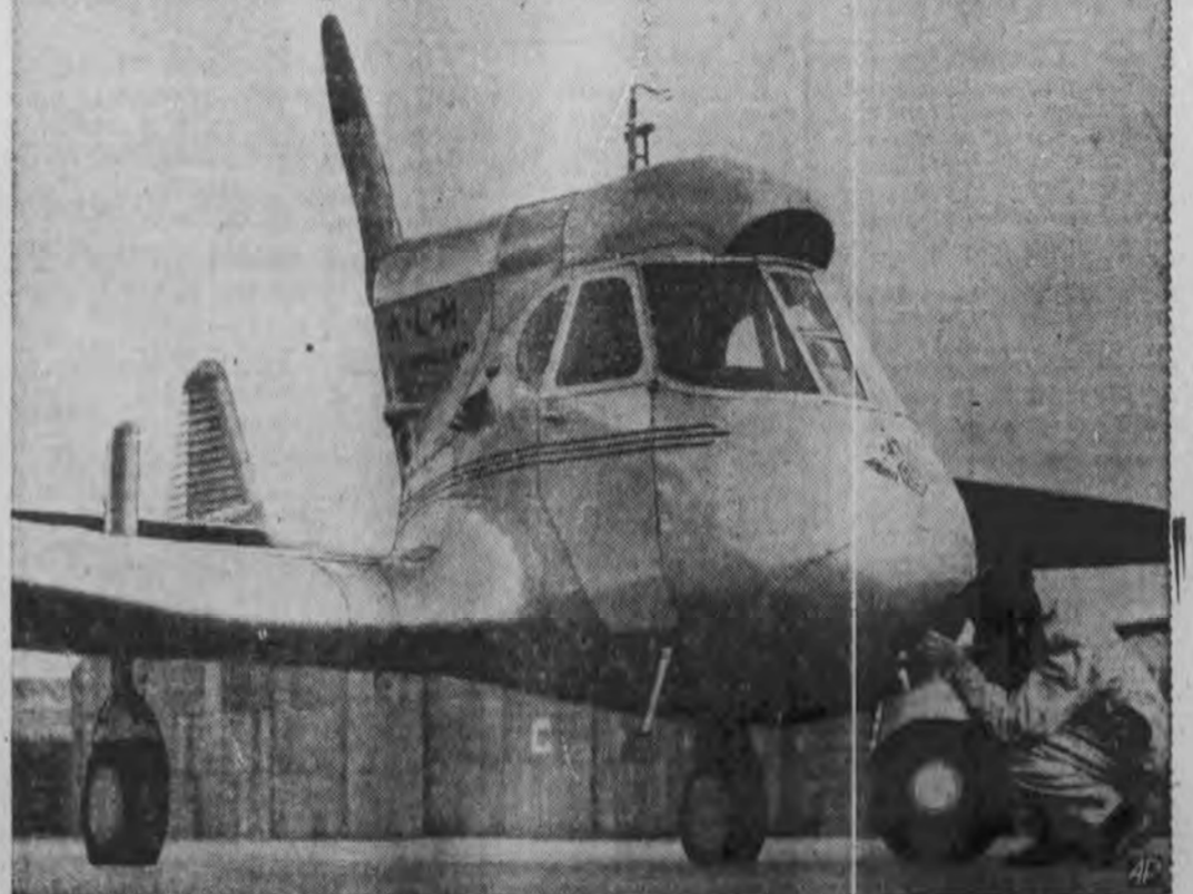
YOU CAN'T BEAT THE DUTCH who designed this bodylegs plane for use in training airliner pilots in nose-landings. With a rear propeller, it has tricycle landing wheels.