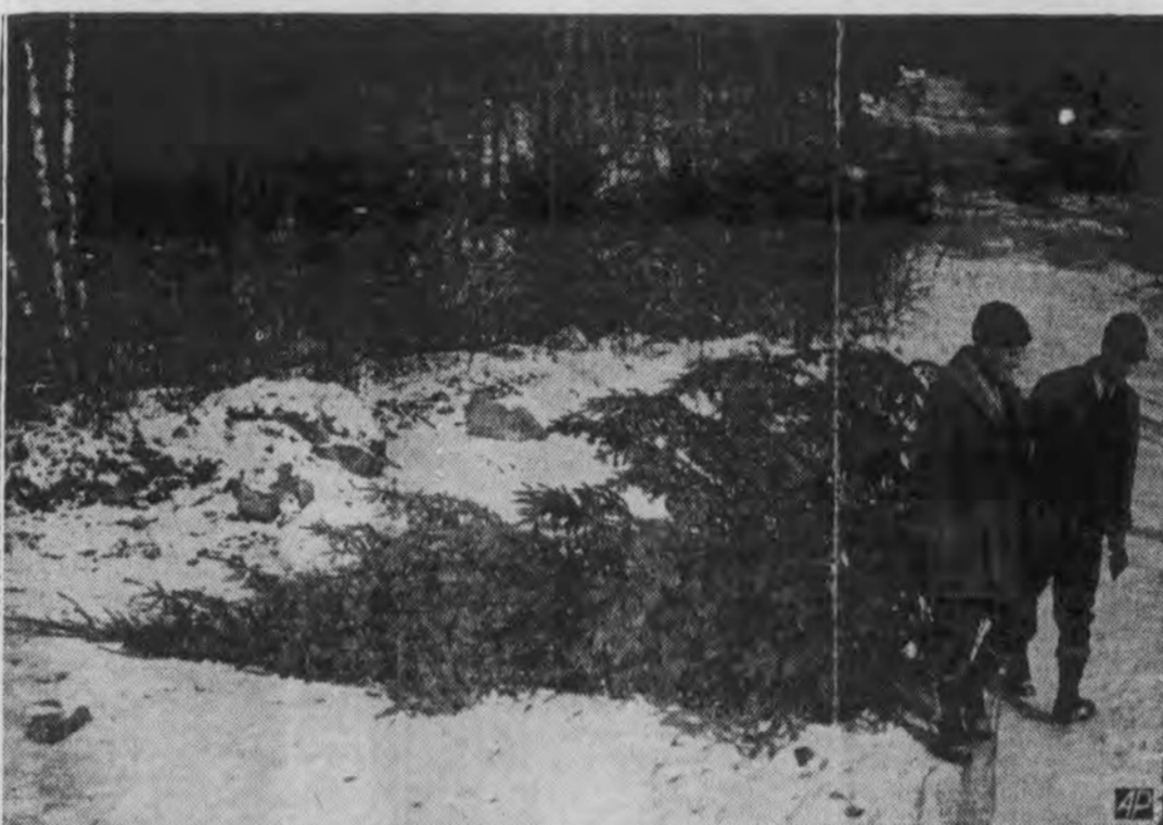
THE PRESIDENT'S CHRISTMAS TREE will be this 20-foot balsam taken from the snow-covered woods 35 miles east of Albany, N. Y., by conservation department employes.