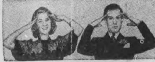
NUT—shouted "chestnuts" and a stomp replaces "ol" of the Lambeth Walk.