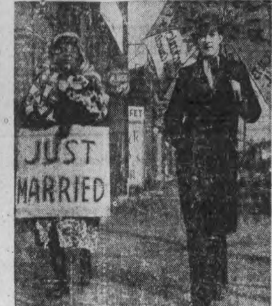
2. THIS IS HOW a St. Louis employer used his logical faculties when faced with labor picketing. The picket doesn't seem very embarrassed but the "just married" gag was tried elsewhere 100.