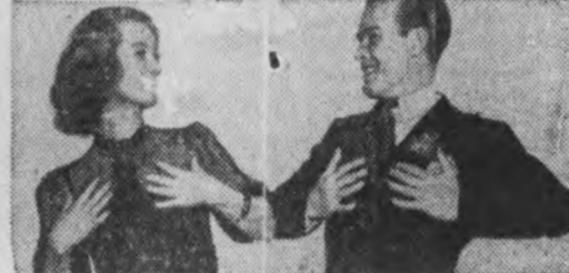
CHEST—The English dancers do another gesture in the lance the king started.