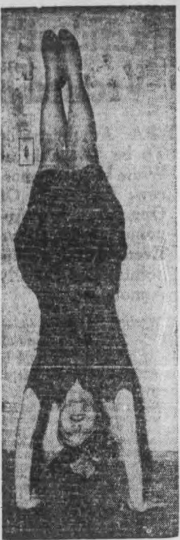
3. WHEN SALLY RAND loses a bet, she pays off. So it was only logical for her to stand on her head after being convicted of scratching and biting candid camera fans. Sally had bet she would be acquitted.

(By The AP Feature Service) One comforting thought on the events of 1938—they did follow the rules of logic. Not only the big, world-shaking ones, but the bush league occurrences showed a reasonableness comforting to reporters gone gaga with the dizzy sequences of recent years. Fininstance: