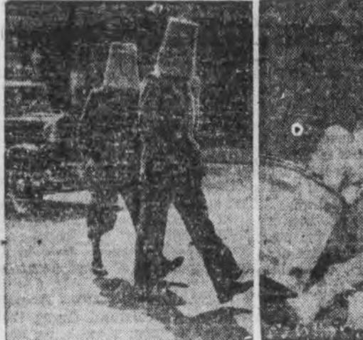
6. GERMAN THOROUGHNESS provided this idea of impressing safety rules on auto drivers. The logic is that careless pedestrians are no briffer than this.