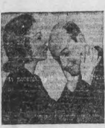
5. ACTRESS GLENDA FARREL, running for mayor of North Hollywood, won the election by figuring things out in advance. She reasoned—"Why kiss babies?—they don't vote."