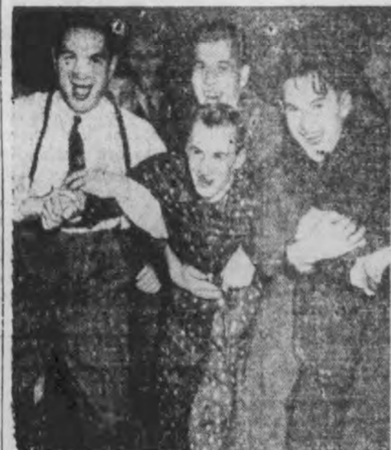
YOU were given a pajama party by Fordham grid-ders, in a New York City station. You visited many stations to cheer your favorite teams as they left for the wars.