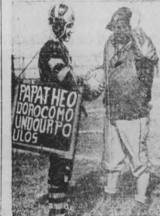
YOU felt sorry for sports writers who couldn't spell many players' names, and who had trouble finding enough Americans for All-America teams.