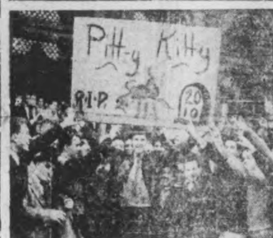
YOU took part in pre-game and post-game celebrations, like this one wherein Carnegie Tech rejoiced over beating Pitt. Some of your revelry brought headaches to the police.