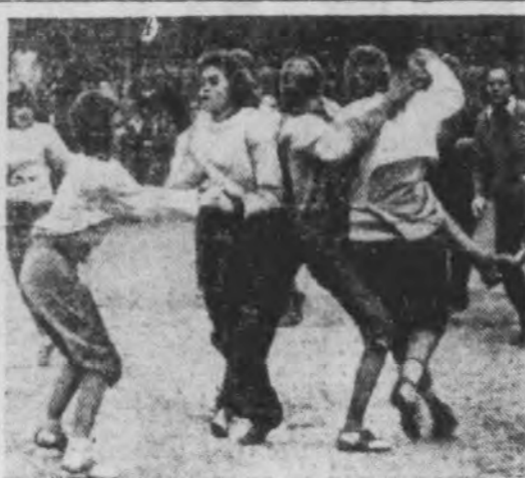
YOU may have watched powder puff pigskin pushers. Feminine football was a 1938 innovation. You may have seen these Galloping Girls at Webster Groves, Missouri.