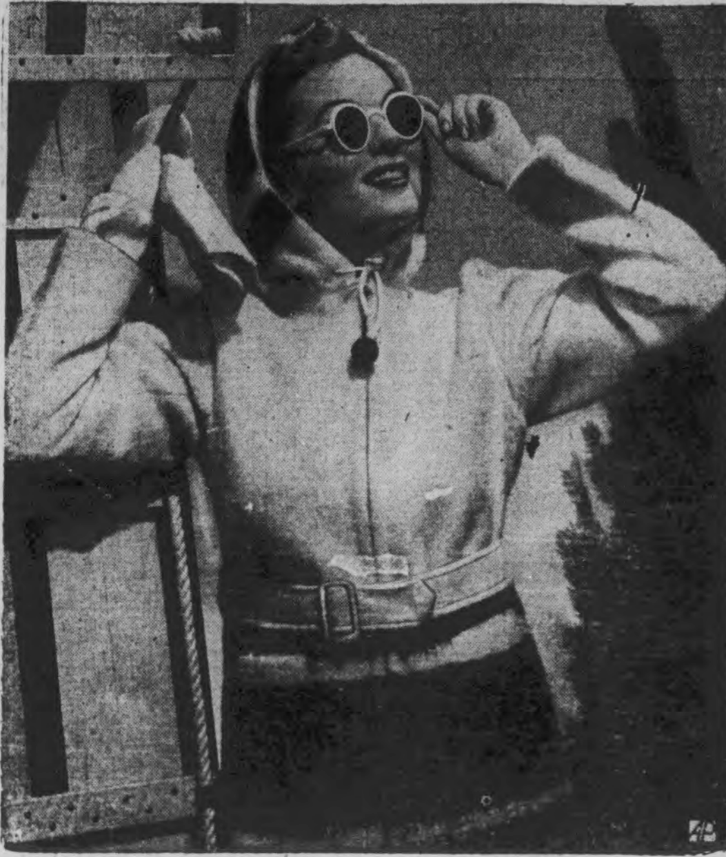
Here is a jacket which can swoop down toboggan slides to a volley of fashion cheers. The white blanket wool, which makes it, is banded in bright blue and topped with an attached hood striped with the same hue. It lies snugly under the chin.