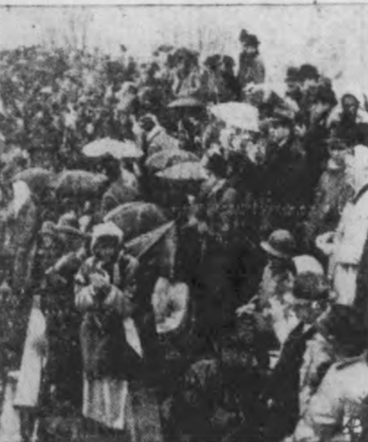
YOU WELCOMED the chance to get out into the fresh air, sunshine, etc. You felt sorry for those who had to stay at home and listen to the game by radio.