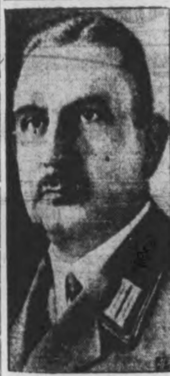
Bernard Rust (above), German minister of Education, ordered rectors of German universities to oust Jewish students.

for all fertilizer, ginning, and any other expense connected with the production of the cotton.