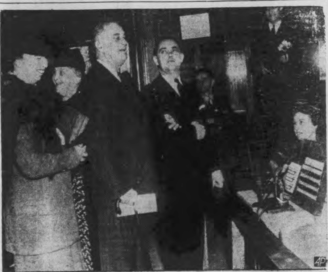
Accompanied by members of his family, President Roosevelt is shown at the historic town hall in Hyde Park, N. Y., to vote in the "off-year" election. Left to right: Mrs. Roosevelt, Mrs. Sarah Delano Roosevelt, the President's mother; the President, and an aide. Seated at the table is an election official. Later newspaper men asked the President if he voted the "straight ticket," he smiled and replied it was a "secret ballot."