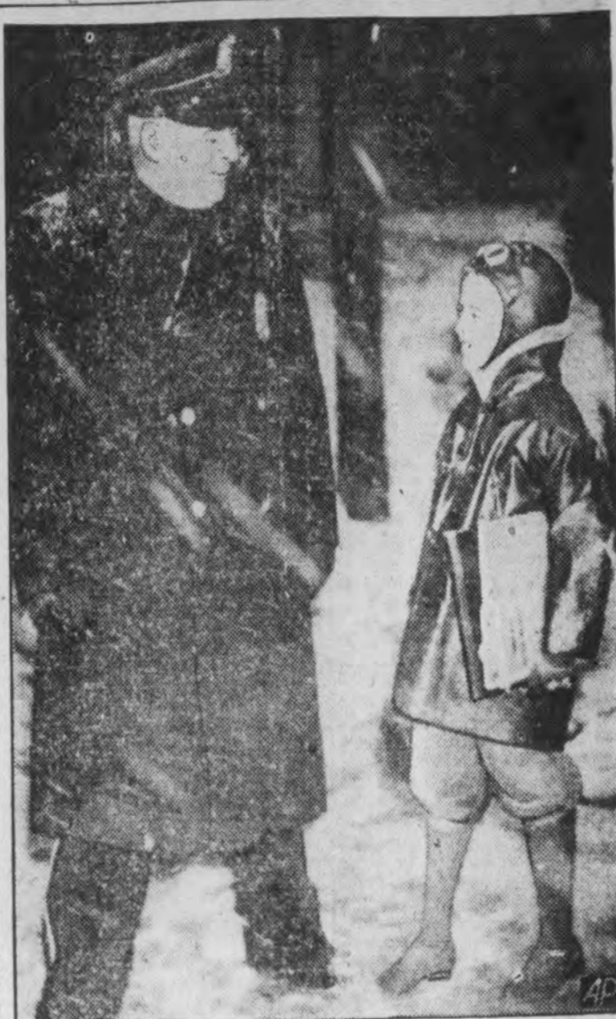
Warm, dry weather came to an end at Kansas City with the arrival of a snow storm. Here a policeman and a schoolboy chat as the flakes fall. What are they talking about? Well, sir, your guess is as good as ours, but we have an idea—you guessed it!—the weather.