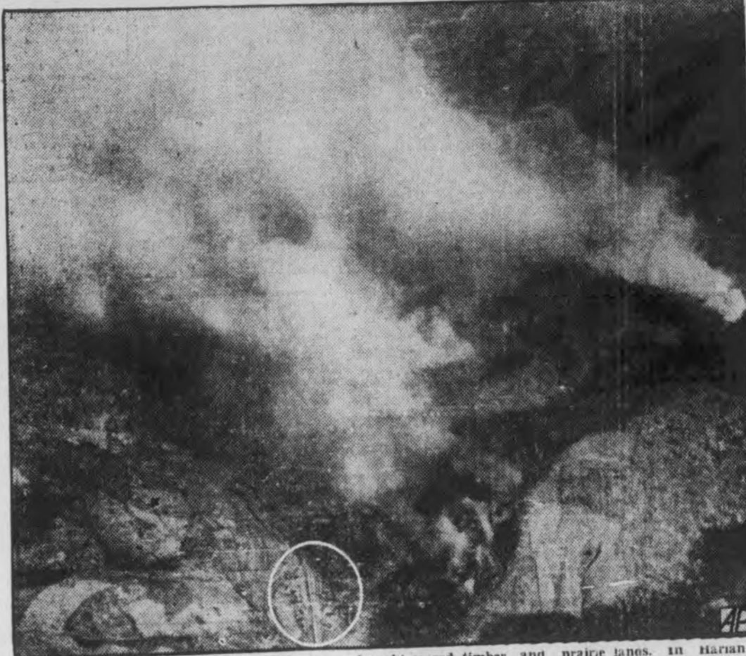
In more than a dozen states fires race across drought-seared timber and prairie lanes, in Harlan county, Ky., the situation is described as "acute" and more than 1,000 fire-fighters are on the job. This aerial picture shows how close fire is to the little mountain settlement of Pansy (located within circle), in Harlan county.

NOTICE OF ADVERTISEMENT OF SALE OF LAND FOR NON-PAYMENT OF TAXES North Carolina—Pitt County. Town of Greenville -S-V-