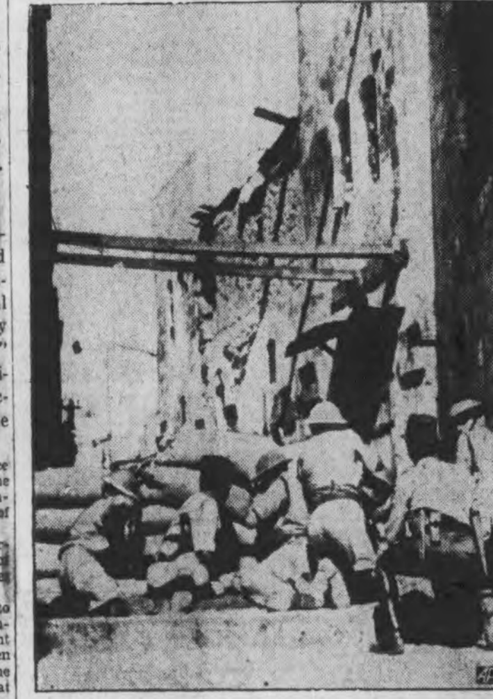
After rebel Arabs had held the Old City of Jerusalem for four days, British troops marched in and took control of the district. Here a British detachment is shown barricaded behind sandbags in one of the narrow streets to prevent the ousted Arabs from re-entering.