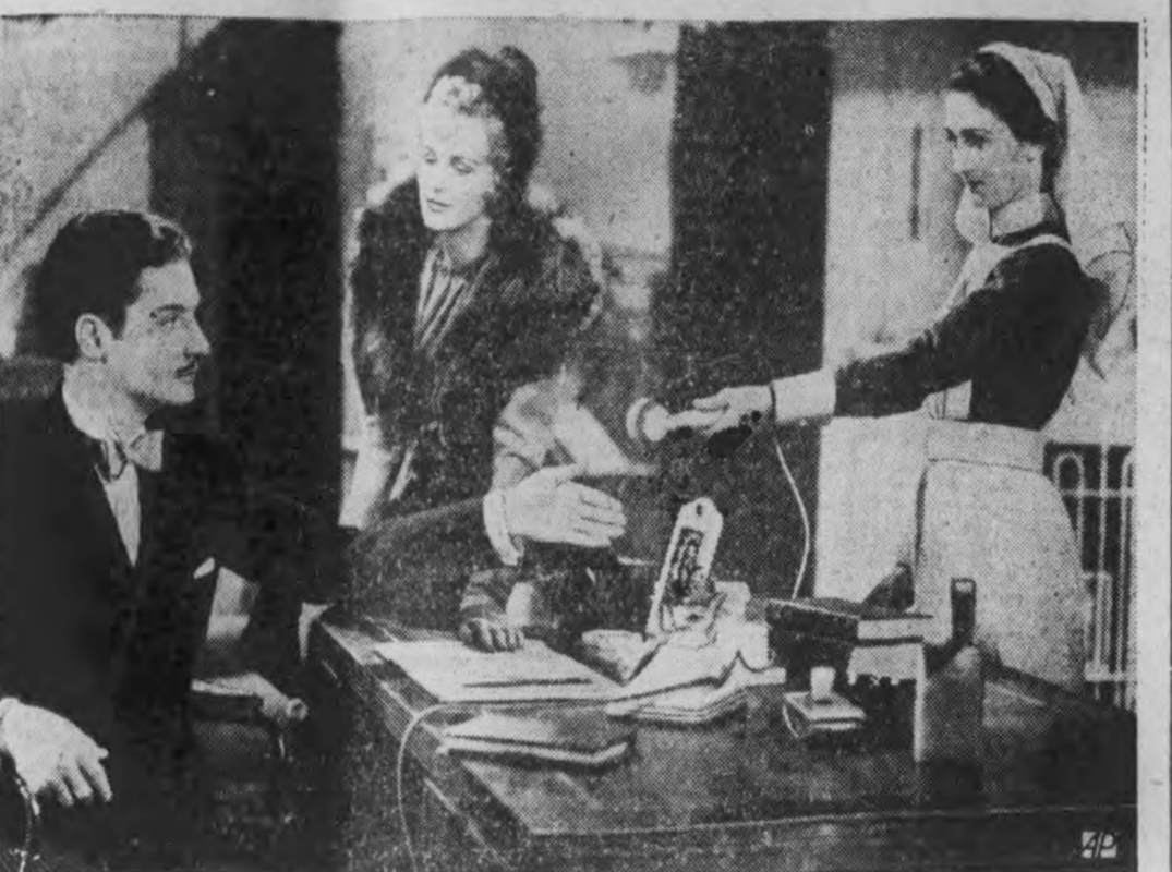
Robert Donat, pictured with nurse (Joyce Bland) and wealthy patient (Penelope Dudley-Ward) in a scene from "The Citadel."

By ROBBIN COONS AP Feature Service Writer Hollywood—This is probably all wrong. It's practically a rule in this town that a movie that's colossal automatically is a movie that's best. A movie that's a spectacle is a cinch for first place. But somehow this department, despite two "colossals" ("Men With Wings" and "Suez") is going overboard for "The Citadel." I like it first because it has a story to tell—and a significant story. A. J. Cronin's authorship is practically a guarantee. I like it for its acting. Robert Donat's performance is different from—and tops—his work as "The Count of Monte Cristo." There's a splendid and sympathetic role for Rosalind Russell who is due for new attention because of it. Had Expert Directing And I like it for its direction by King Vidor, who incorporated a wealth of telling and touching incidents, who lost no opportunity for dramatic effects in a (necessarily) rather talky film. Its title, "The Citadel," refers to the unseen goal toward which