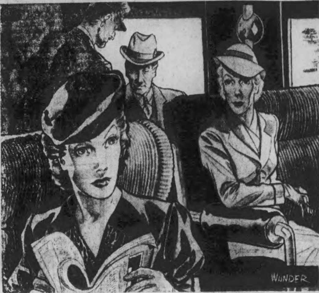
The girl across the aisle was staring at me again. She looked strangely familiar, but I couldn't place her.