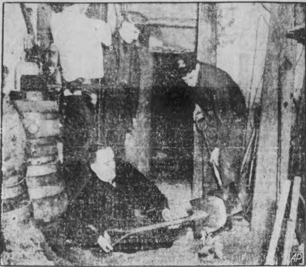
Police are shown digging into the cement floor of the basement in the Ukrainian hall at New York where they discovered bones believed to have been those of Arthur Fried, young business executive, who was kidnapped and held for $200,000 ransom last December. Four men have been arrested and FBI agents and police continued searching the cellar for other possible victims of a "kidnap syndicate." Three of four suspects have confessed to authorities.