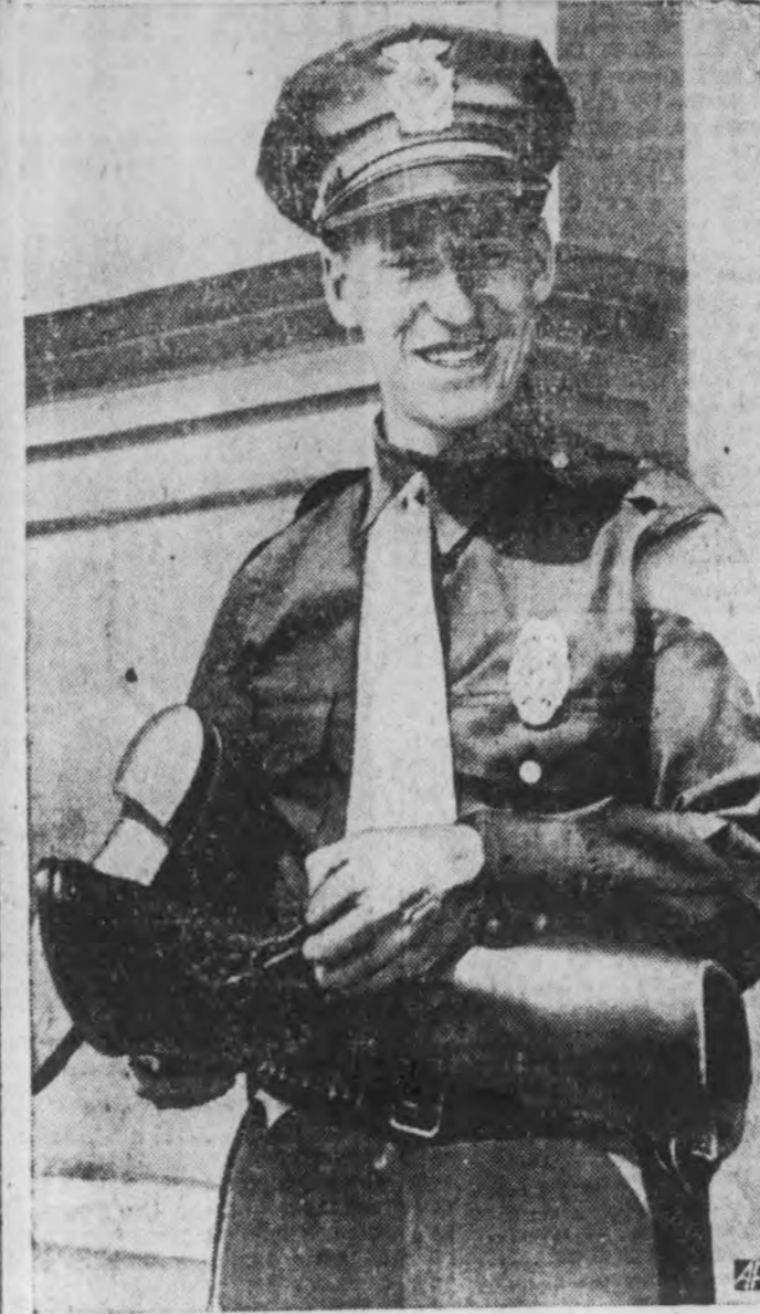
IN ANY FOOT RACE between a law-breaker and Officer Don Lash (above) of the Indiana state police force, the man being chased had better beware. Lash, one of Indiana university's greatest distance runners, has changed his track suit for an officer's uniform. His records include a time of 4:07.2 for the mile at Princeton—the second fastest mile ever run.

This was the situation: In 1933 the department of agriculture held that livestock commissioners in the Kansas City stockyards were charging excessive