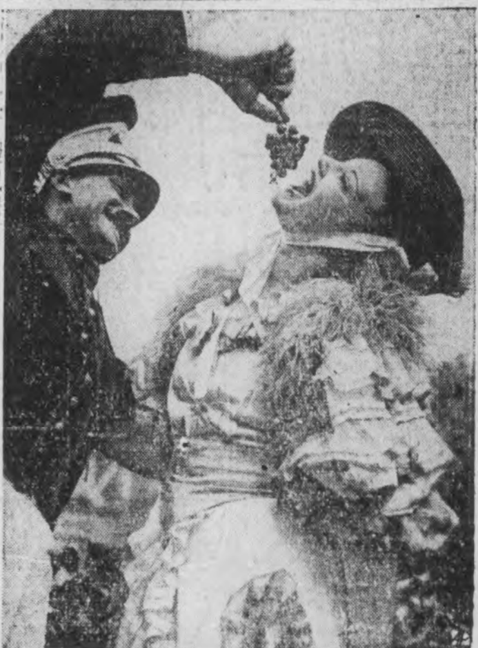
DON'T MENTION SOUR GRAPES to these two. A fair Paris miss samples the harvest from Montmartre vines.