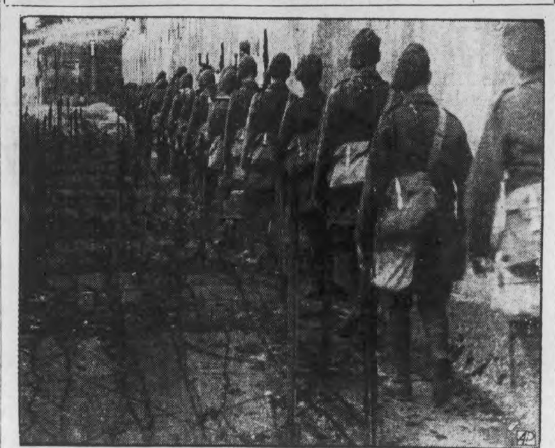
The Maginot Line, marking what is probably one of Europe's most impregnable fixed frontiers, extends for about 250 miles along France's eastern frontier from the Belgian border to a point near the Swiss border. Here are French soldiers moving along a narrow passage between barbed wire entanglements and the fortification wall as they go to their posts in one of the pillbox fortresses.