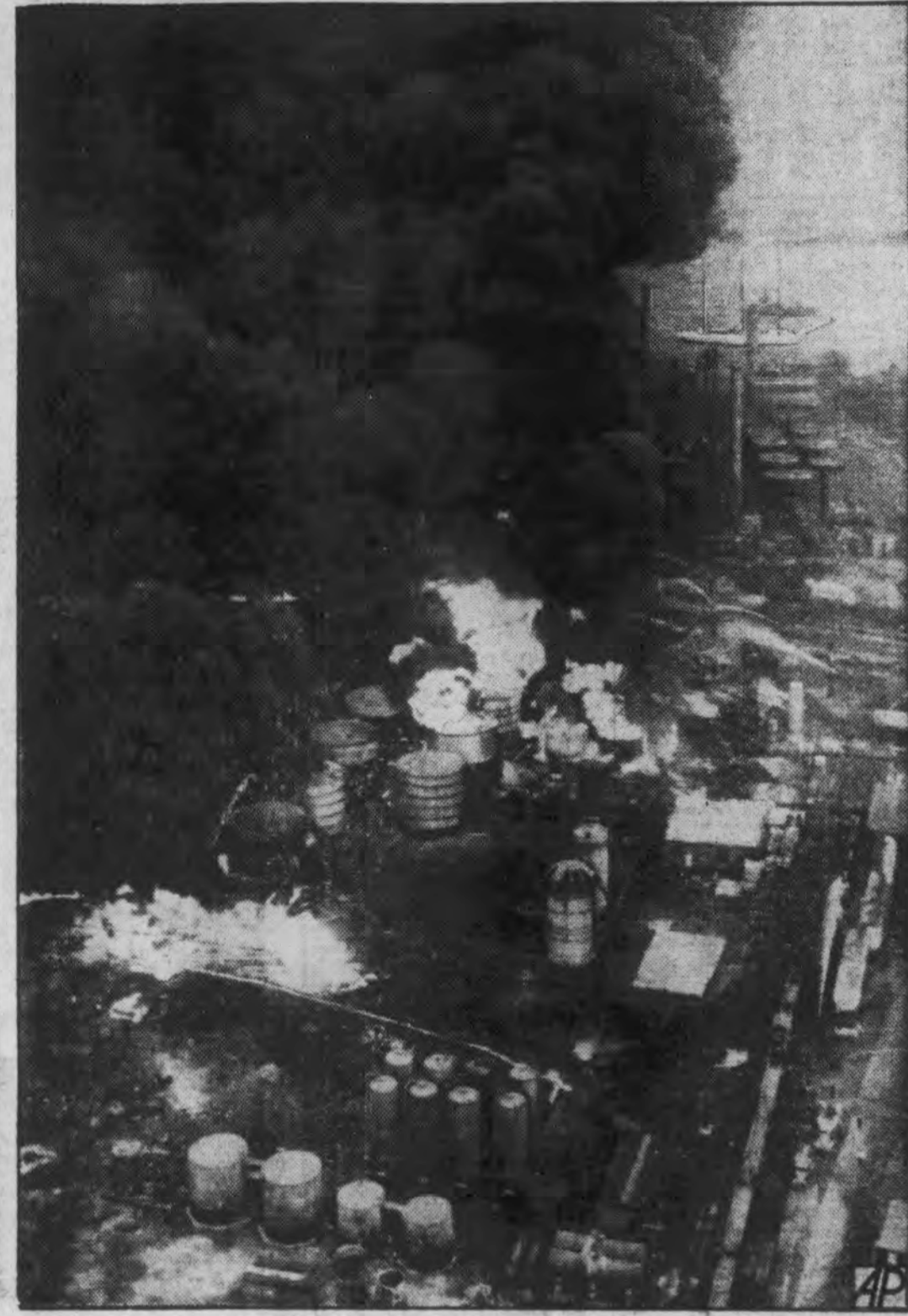
Under a dense pall of smoke 1,500 regular and volunteer firemen from several municipalities battled to subdue an eight acre oil fire at the Cities Service company's "tank village" near Linden, N. J. This aerial picture of the refining field during the blaze shows also the confluence of the Arthur Kill and Rahway rivers. Other property was threatened by the million-dollar fire, and two score firemen were injured.