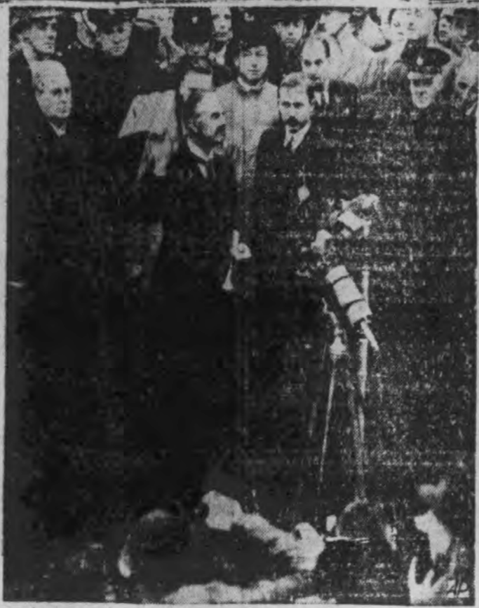
A PIECE OF PAPER flutters from the hand of England's lean Premier Neville Chamberlain, who was given a conquering hero's welcome by Britons on his return from the Munich conference. Arriving at Heston airport, the premier waved aloft the agreement he and Adolf Hitler signed, pledging that their two nations had no desire ever to war against each other.