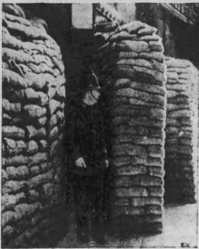
Action speaks louder than words, thought worried Britons, who kept on building barricades, digging bomb shelters, buying gas masks even while diplomats were discussing terms at Munich. This is Snow Hill police station in London. Hitler threatened war; he got fertile fields and mineral-bearing Czech lands, and "reclaimed" 3 1/2 million Germans on his soil.