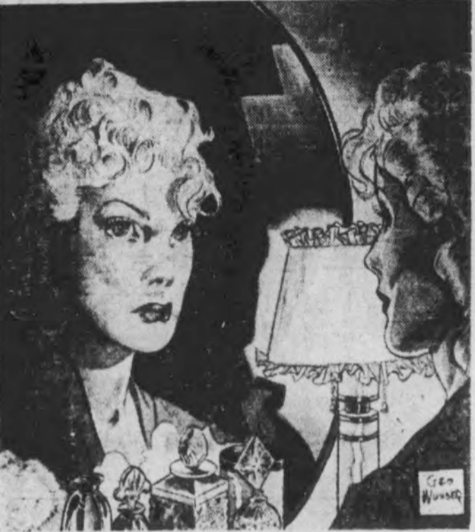
Kathleen went to a mirror. This was the face that "smirked" at MacDonald.

At three o'clock the next morning, Dan drove Cleo Riley, nee