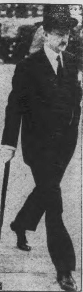
Disagreeing with the foreign policy of Great Britain's Prime Minister Neville Chamberlain, Alfred Duff Cooper (above), first lord of the admiralty, resigned his post.

Attacked by Resigned First Lord of Admiralty