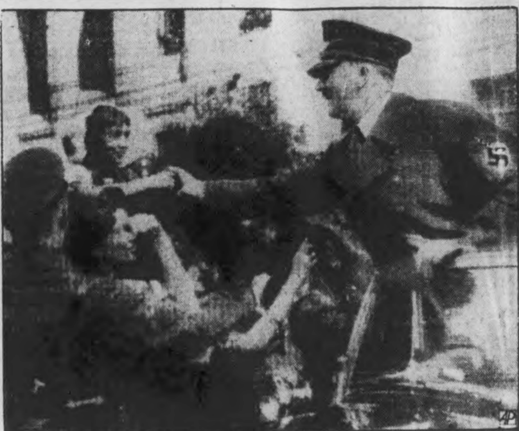
Nazi Dictator Adolf Hitler of Germany returned from Munich to Berlin to receive a conquerer's welcome from 500,000 hailing citizens enthused over the acquisition of the Sudetenland of little Czechoslovakia. This radiophoto shows Der Fuehrer being greeted by Sudeten women in their native gard.