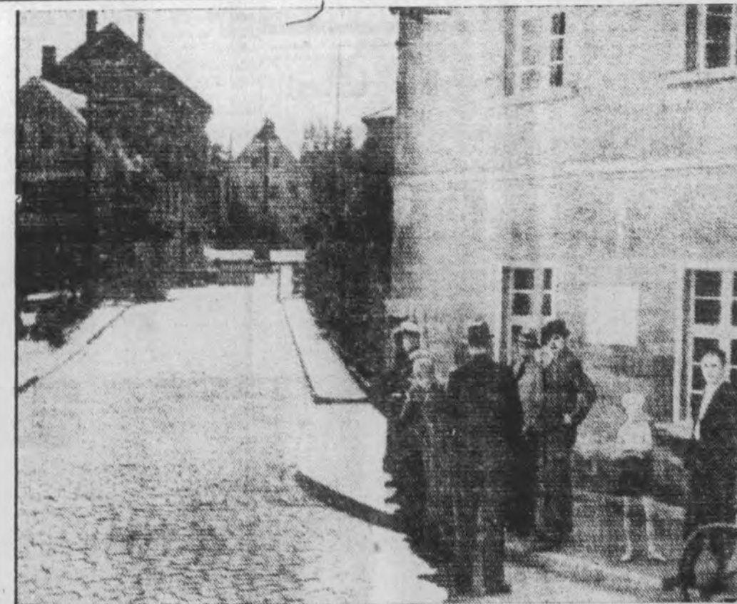
This radiophoto of a frontier scene at Spidenburg, Germany, shows a group of Germans behind the town's custom house looking toward the Czechoslovakian customs barrier where 17 were reported wounded shortly before in a clash between Czechs and German Sudeten. The Germans claimed the Czechs crossed the frontier and opened fire.