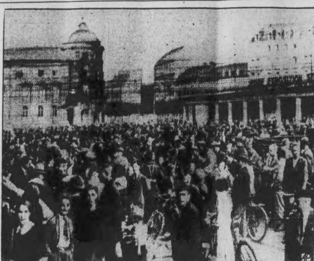
France swelled her armed forces to well over 2,000,000 men by summoning to the colors 280,000 additional reserves. The call to arms was announced by newspaper, radio and bulletin board. This radio photo shows citizens of Paris reading a copy of the mobilization order posted on a bulletin board.