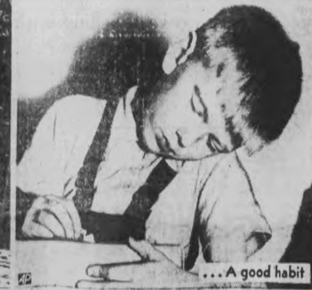
Housework helps develop...

THIS youngster doesn't get paid for setting the table. Mother disapproves, believing that children should help. Usually, the boy selects his own job. It keeps him interested. He works alone, start to finish, and takes pride in accomplishment. Instead of pay, he collects an allowance—15 cents—on Saturdays. It goes into his bank. He has been banking a gradually increasing allowance since he was three, so mother believes he has developed the habit of saving.