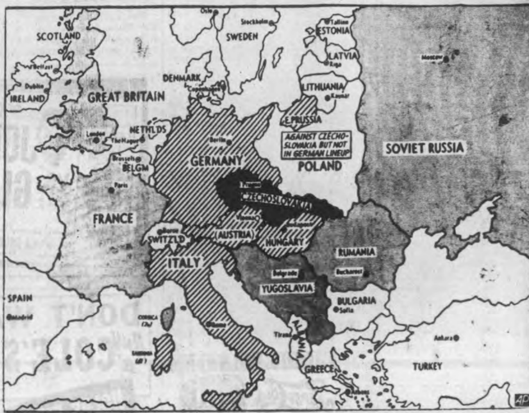
With Chancellor Hitler's declaration that he will not give up his claims in Czechoslovakia, followed by the announcement that Great Britain, France and Russia would stand together in defending the Czechs, this map shows how the nations of Europe line up on the brink of war. Countries designated by diagonal lines go with Germany, the dotted nations go against her. Poland demands a share of the Czech nation but thus far has not joined any alliance. Countries shown in white are neutral thus far. Czechoslovakia, core of the trouble, is identified in black.

LINE-UP FOR WHAT MAY BE EUROPE'S REAL WAR GAME