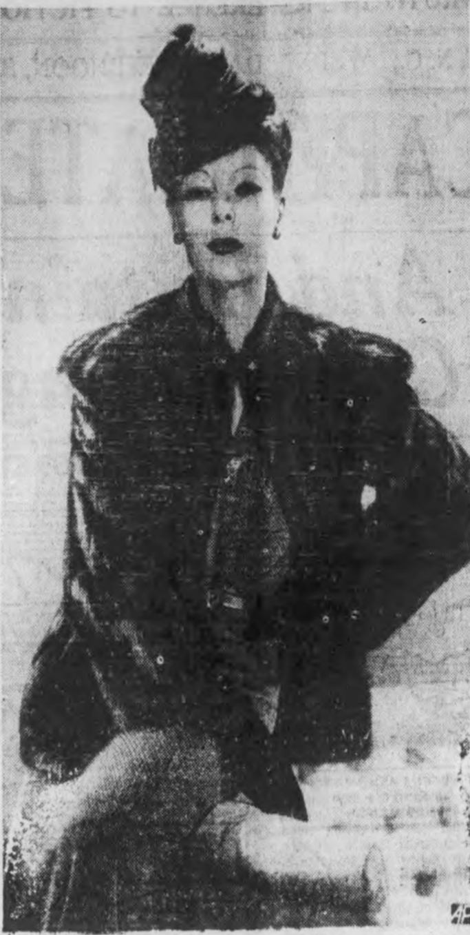
Dressed for cocktails and dinner, this young New Yorker wears a slim frock of blue and silver lame tricot topped by a suave mink jacket. Her tall toque of brown duetyn is trimmed with mink spirals and sapphire studded silver hoops gleam in her ears.

him as if he did have heart disease. The condition is likely to become fixed. The patient may be made a permanent invalid by the addition of a physical disability to the already present emotional or psychological disability. There is a precious saying among medical men to the effect that "it is far easier to rub a disease into a limb than to rub it out of the limb." This places a great responsibility upon the examining physician. It is no easy matter to differentiate between imaginary pain and that due to organic or functional disease.