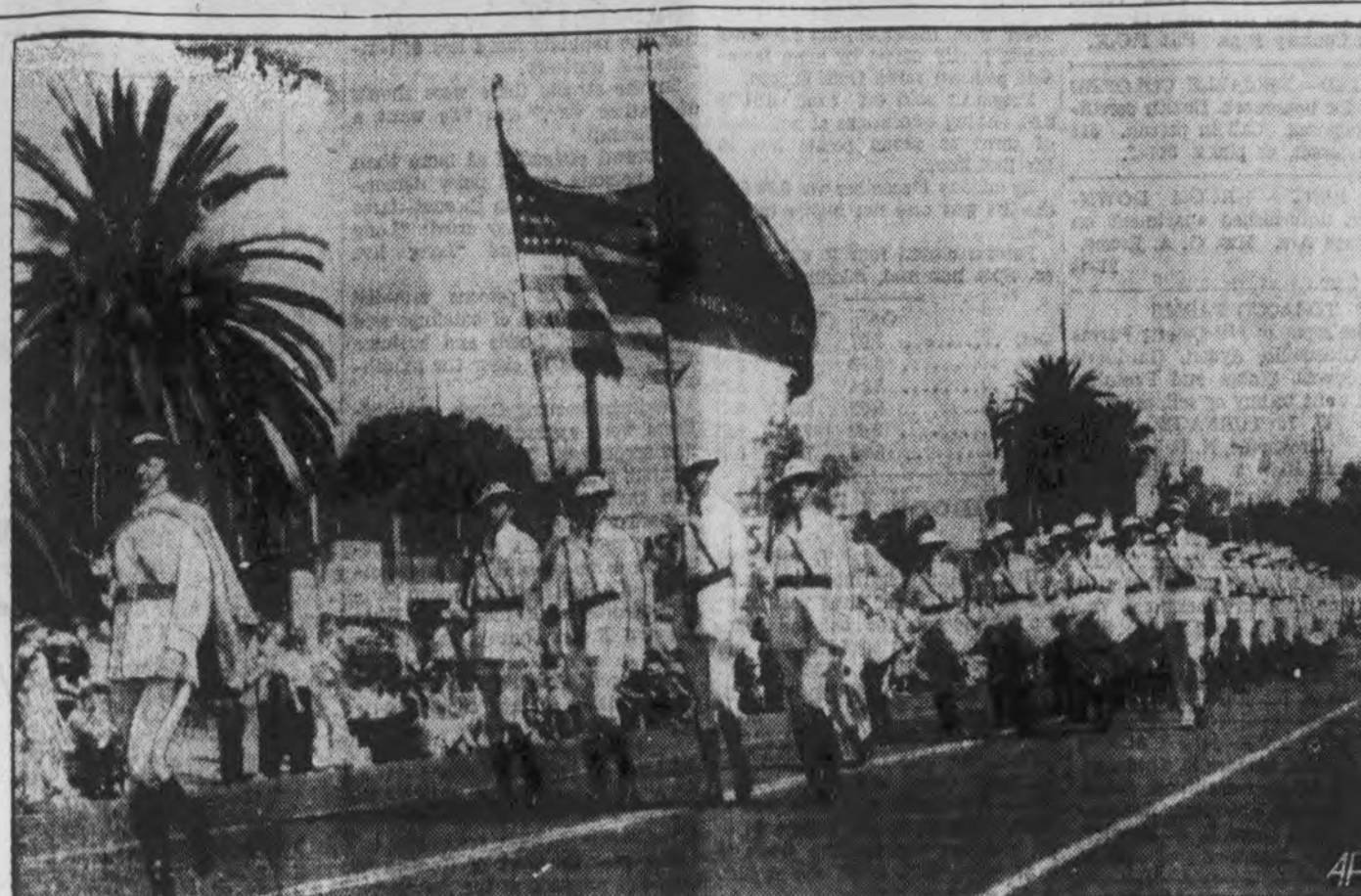
With spry step that belied approaching years, 40,000 graying soldiers of World War days marched through Los Angeles streets in the American Legion parade during the Legion's annual convention there. Nearest the camera, the crack drum and bugle corps of Miami, Fla., is shown as the line of march passed smartly down Figueroa street.