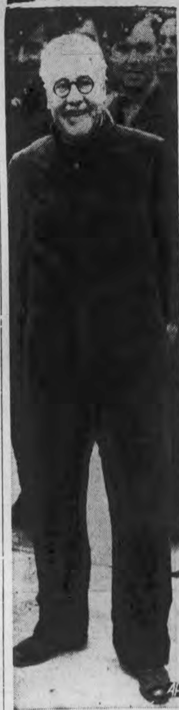
MINISTER of England's air force, Sir Kingsley Wood donned overalls to inspect Britain's balloon barrage—a mammoth device of chains and wires to entrap enemy planes.

1—The Sudeten districts Czechoslovakia which in district elections last May and June voted 75 per cent or more for the Sudeten-German party of Konrad Henlein will be considered to have decided on