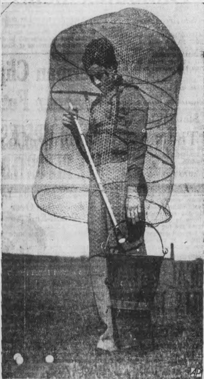
HOOKS AND SLICES on a golf practice range in Sydney, New South Wales, don't worry this lad who wears a cage of wire-netting. The balls are picked up by a suction cup on the end of the stick, to be reclaimed later by players.