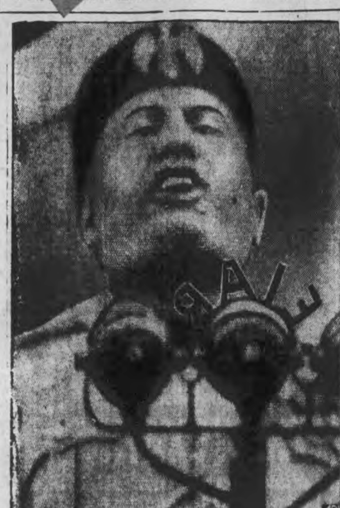
Premier Mussolini of Italy is shown in this radiophoto at Trieste as he told cheering thousands of his countrymen that in case of a general European war, Italy would be on the side of Germany.

Mussolini remanded a plebiscite for the Sudeten German minorities in Czechoslovakia.