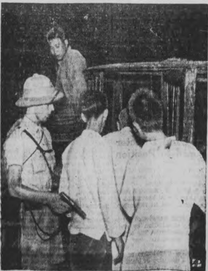
SUSPICION IN SHANGHAI With high peak as wave of lawlessness forces police to search natives for firearms.