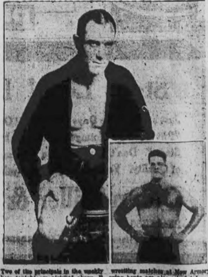
Two of the principals in the weekly wrestling matches at New Armory here tonight are pictured above. B