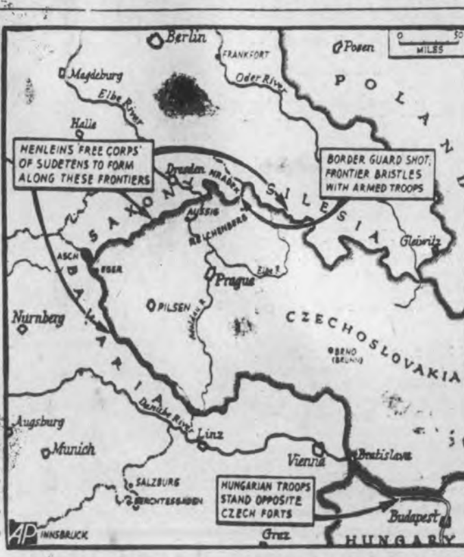
Jittery Europe became even more nervous when Nazi Konrad Henlein, outlawed leader of the Sudeten German party, announced in Germany formation of a "free corps" of army-trained Sudeten. The armed corps will be drilled and held in readiness against the day when they may be ordered into action for the Fatherland. This map shows the border territory where the corps will form. It was stated that the corps will be on duty in Czechoslovakia, as well as the German provinces of Silesia, Bavaria and Saxony.