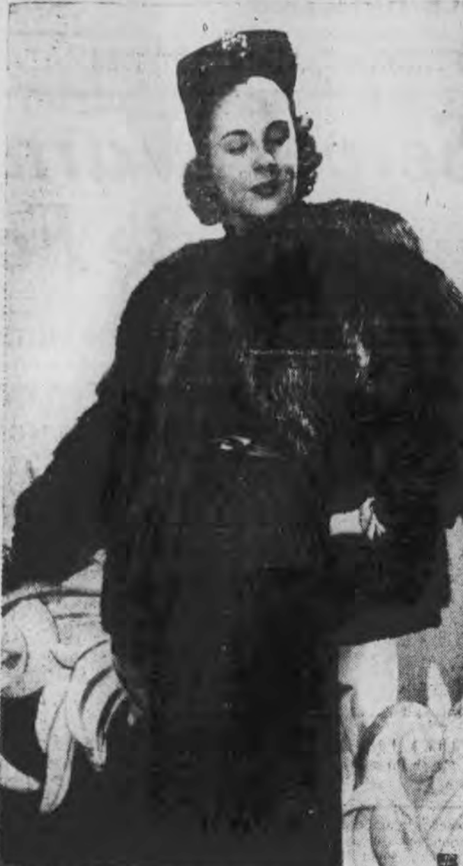
For the college girl who wants something different in fur coats an American designer has made this one of black fox on the season's favored square lines. It steps out with a black wool suit woven with a raised stripe and a draped black toque finished with a jeweled clip.