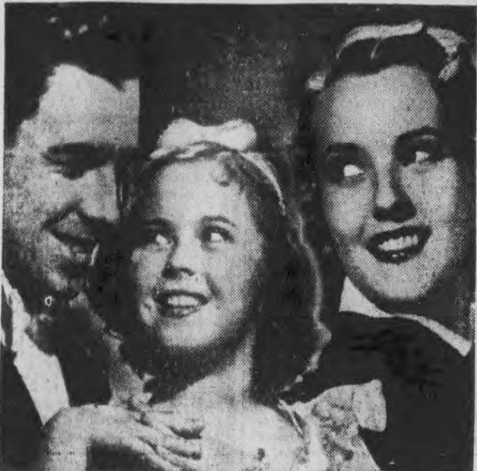
Oh! ho! its George Murphy, Shirley Temple and Phyllis Brooks featured in "Little Miss Broadway" opening at the Pitt Sunday.

SUM EXPENDED TO AID NEEDY (Continued from Page One) drawing old age assistance funds which during the year ran up a county total of $35,302 given to the needy aged. Highest payment in the state in the aid to dependent children fund was one of $60 given to a family having seven children to care for, while 20 families in the state received a grant of $50 or more, the majority of the grants ranging from $10 to $16 and most going to families with two or three children. The father being dead was listed as reason for dependency of 10,572 children, while continued absence from home on the part of the male parent was given as the cause why 4,189 more should be placed on the public rolls. Total public assistance expenditures for the state for the fiscal year ended June 30 came to $3,026,153.22 combined federal, state and local funds with a state-wide total of $2,208,367.29 going for old age assistance and $816,285.93 being granted to dependent children. Thirty-three thousand and sixty persons were on the old age rolls at the end of the year receiving average grants from the funds of $8.97.