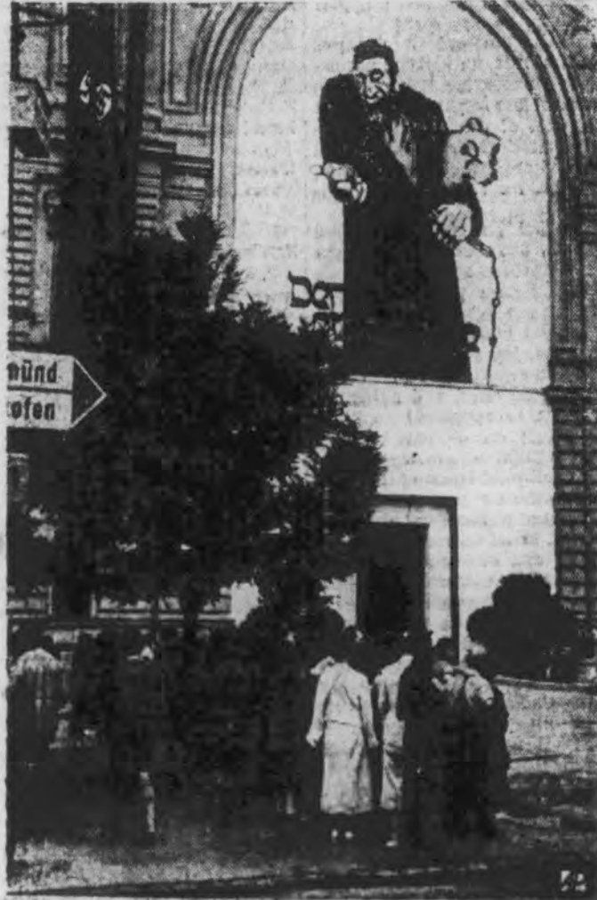
THE ETERNAL JEW is title given anti-Semitic exhibition newly opened in one of Vienna's largest halls (above).