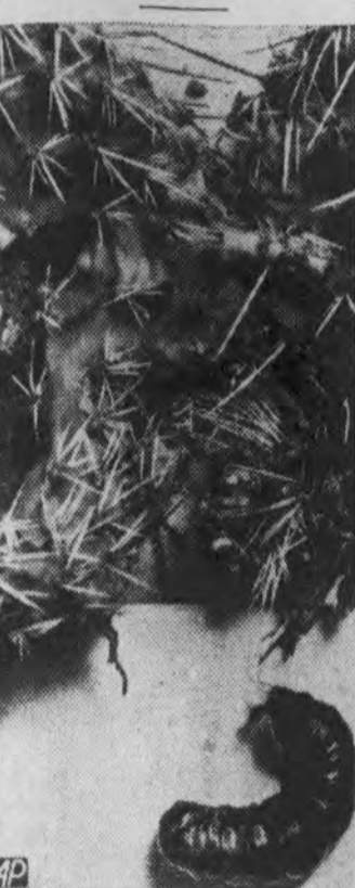
WORM AT WORK By The AP Feature Service Colorado Springs, Colo.—(AP)—