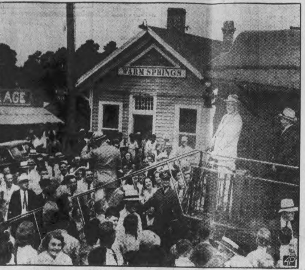
Surrounded by a crowd at the railway station, President Roosevelt is shown alighting from his special train at Warm Springs, Ga., for a visit at the little village he calls "my other home." He rested there for a day before his speeches at Athens and Barnesville, Ga., August 11. Shortly after his arrival, he had luncheon with Governor Rivers of Georgia and Lawrence Camp, New Deal enthusiast, seeking the Democratic nomination for the United States Senate seat of Senator Walter F. George. In a luncheon speech the President expressed the hope Camp "will be the next Senator from this state."