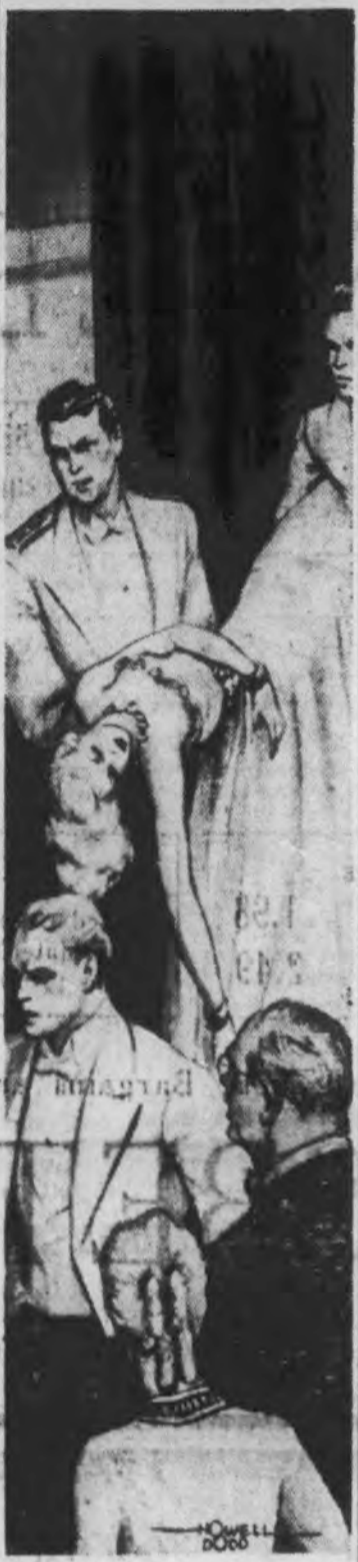
Two hefty fellows carried the limp body.

"The little doctor halted in the act of another assault upon Hugo's cheeks and gave me an uncommonly shrewd and searching look. Satisfied apparently, he advanced and solemnly offered me his hand. "Any friend to my dear Hugo is a friend to me," he assured me. "I am only sad that I meet you on so tragic an occasion. We must reconquer ourselves later at my