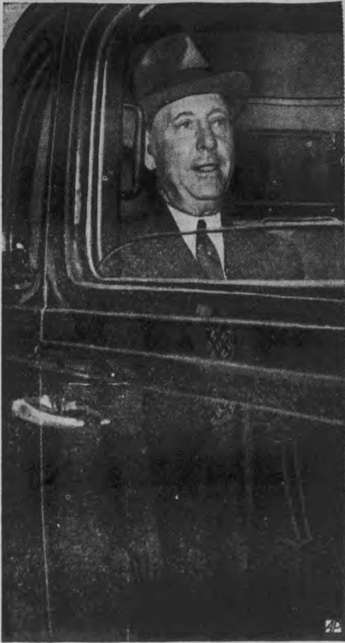
LOOK CLOSELY to see change in shape of Jersey City mayor, Frank Hague, as shiny car leaves Civil Liberties hearing.