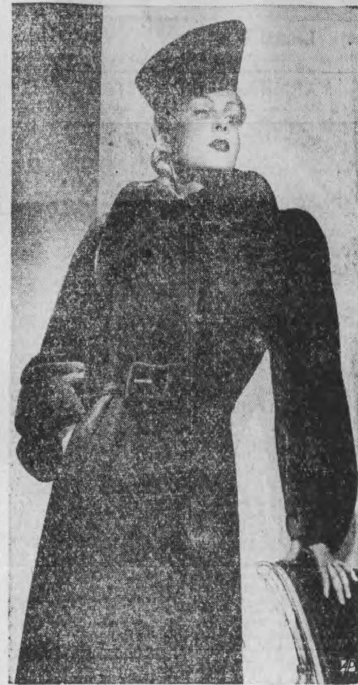
This fall coat recently made its debut at a New York Fashion Show featuring wool coats in "rural autumn" color. Beaver makes its collar and sleeves. (Design by Carmel Bros.)