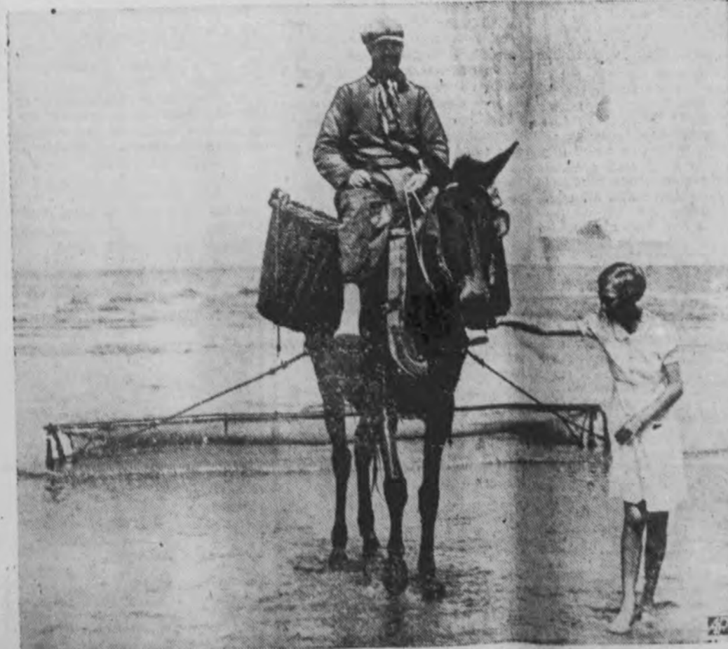
NOT EVERY FISHERMAN has had the honor of being led to shore by royalty. This is Princess Charlotte, 11, daughter of Belgian king, helping with a shrimp haul at La Panne.