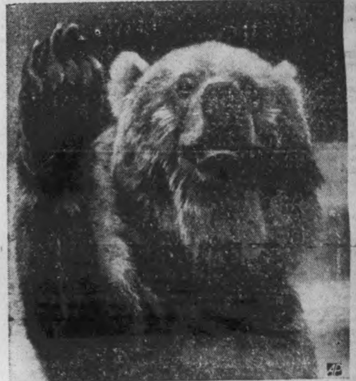
HIS POLITICS is strictly on the quiet with this Detroit bear, but that salute seems unmistakably Fascist.