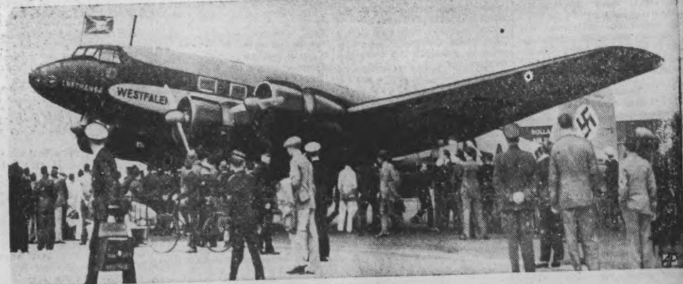
ON ENGLISH SOIL A GERMAN PLANE LANDS , to the admiration of a crowd at Croydon airport in Surrey. The ship represents latest German developments in passenger planes; accommodates 26 passengers; weighs 15 tons.