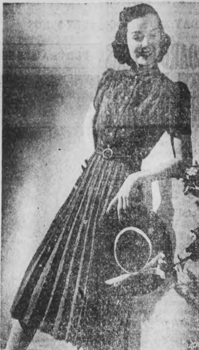
COTTON LACE FOR COCKTAILS —A practical afternoon frock to add to a vacation wardrobe is made of deep blue cotton lace with a fine white thread outline. It is designed with a shirtwaist bodice and pleated skirt and worn with a navy blue felt hat banded in white grosgrain ribbon.