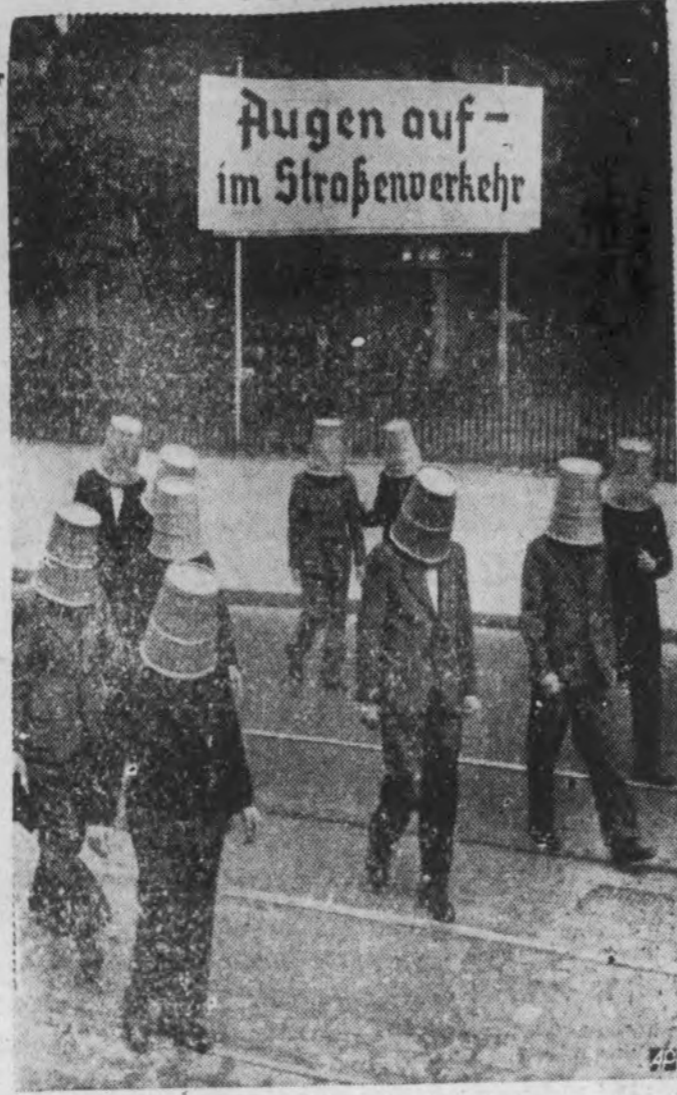
PEDESTRIANS' FOLLY might be title of safety drill in Berlin, designed to show unseeing carelessness of pedestrians.