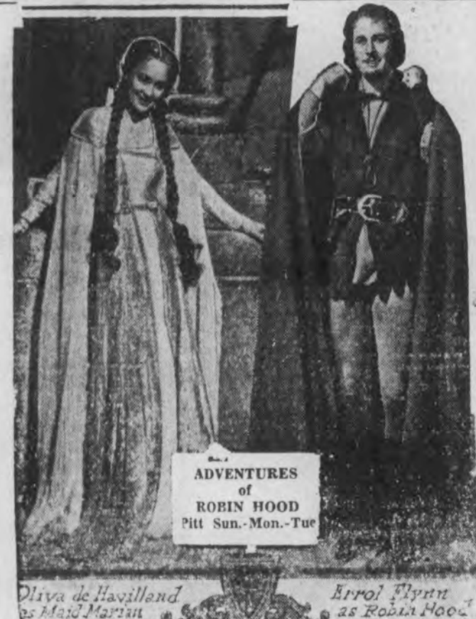
ADVENTURES OF ROBIN HOOD Pitt Sun.-Mon.-Tue Olivia de Havilland as Maid Marian Errol Flynn as Robin Hood