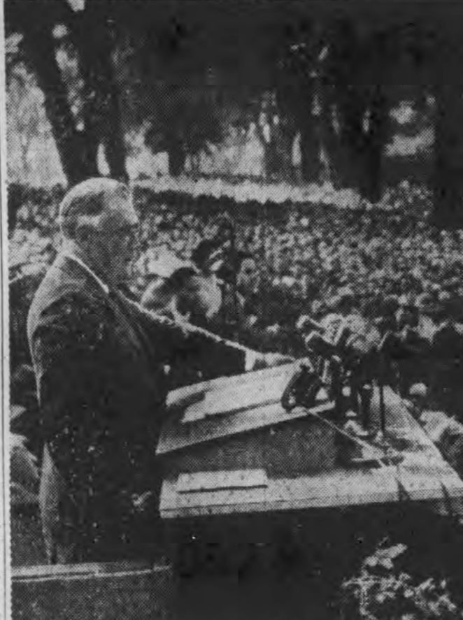
In the first address of his transcontinental speaking tour, delivered at Marietta, Ohio, before a crowd celebrating the 150th anniversary of the settling of the Northwest territory, President Roosevelt included a word of praise for Senator Robert Bulkley, staunch New Dealer who is a candidate for re-election on the Democratic ticket. Here Mr. Roosevelt is shown addressing the crowd.