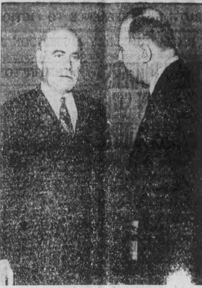
The lifting of New York's political fog revealed Gov. Herbert H. Lehman (left) and John J. Bennett, Jr. (right) New York's attorney-general, as the political men of the hour. Gov. Lehman announced his candidacy for the United States Senate seat left vacant by the death of Dr. Royal S. Copeland. Bennett tossed his hat in the ring as the Democratic aspirant for New York's governorship.