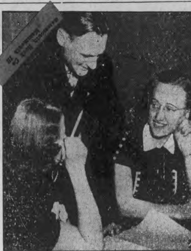
United States Senator Gerald P. Nye of North Dakota grins broadly as he watches his lead grow over that of Gov. William Langer in their race for the Republican Senatorial nomination. This scene of him studying returns from the primary was in the Associated Press Election Bureau, in Fargo.