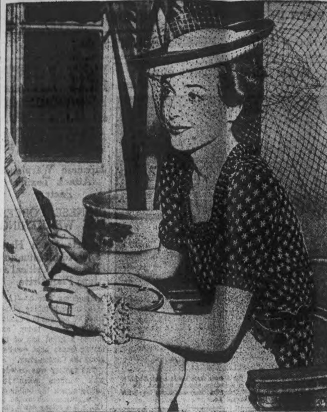
Black and white star-printed crepe makes this spring frock, seen at lunch time recently in the New York Ritz. The white straw hat is banded in black ribbon.