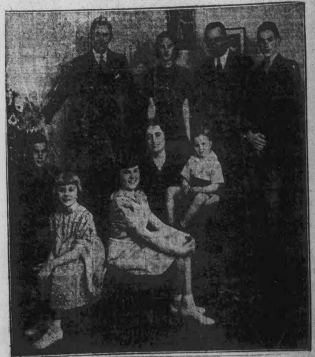
FRANK HANCOCK, CANDIDATE FOR U. S. SENATE, WITH A BRILLIANT RECORD OF EIGHT YEARS IN CONGRESS, IS ENDOSED BY OUTSTANDING CITIZENS OF THE STATE. MR. HANCOCK WILL SPEAK OVER A STATE-WIDE RADIO HOOK-UP TONIGHT AT 10 O'CLOCK.