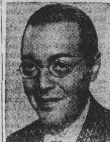
Peter Lorre Mr. Moto of Hungary

Hollywood's best known orientals of the moment are: