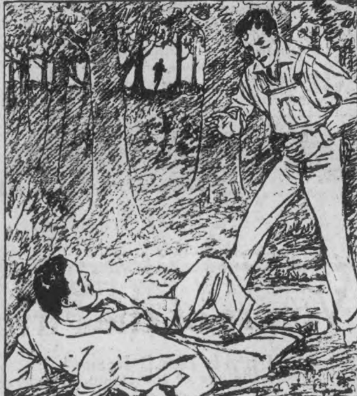
Asey stopped short. "Be back," he said briefly.

Chapter 25 Knocked Out ONCE in the deepening shadow of the pines, Asey dropped his mantle of carefree indifference. He had not actually seen anyone lurking around, but he felt sure that someone was lurking. There had to be. Someone had fired the barn, all right, and Asey was the first to admit that it was an excellent piece of work. Not just a complete bit of demolishing, either.