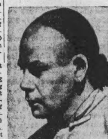
Paul Muni Mr. Wang of Austria