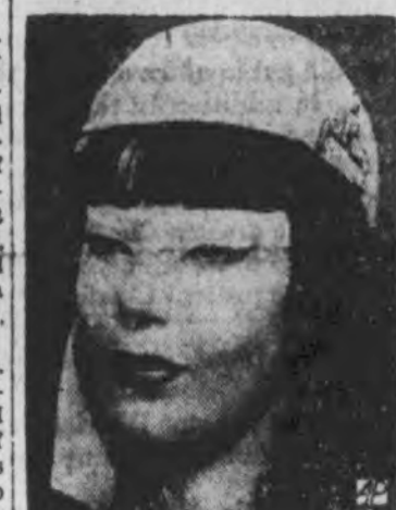
Loretta Young Salt Lake City "Chinese"