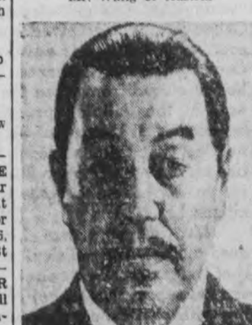
Warner Oland Charlie Chan of Sweden

dier, sang two numbers: "Let the Celestial Concerts All Unite" by Handel; and "Gloria in Excelsis Deo" by Bach.