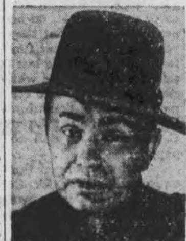
Edward G. Robinson "Hatchet Man" Of Rumania