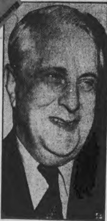
Sen. James J. Davis (R-Pa.) who won his battle for re-nomination in Pennsylvania's Republican primary, is shown wearing this great big victory smile as he attended the meeting of the Tennessee Valley Authority investigating committee in Washington.