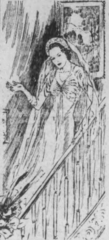
"Poor Cissy! Poor Reuben! Poor me!"

The burden of all the world dropped from him. He stooped and