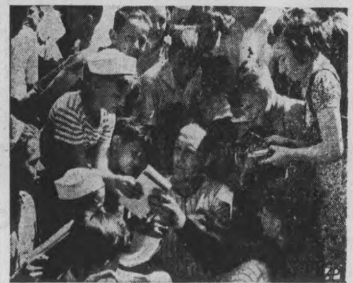
Charles Ruffing And Friends In Florida

This spring Red was the first Yankee to reach top con-