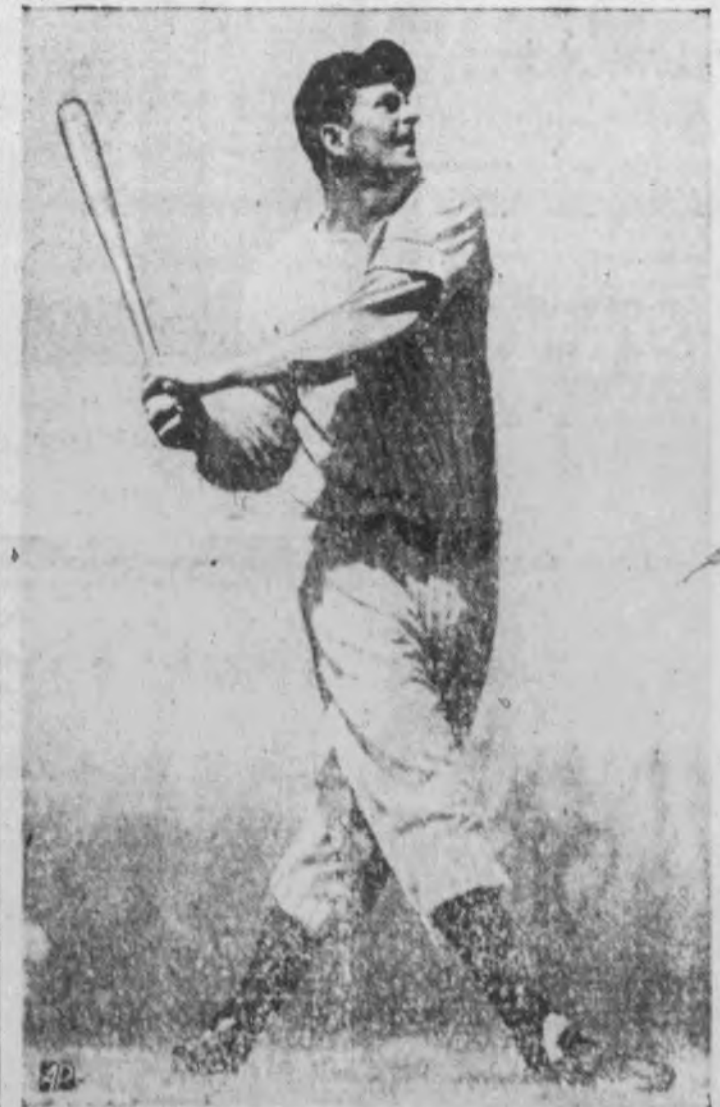
George Selkirk In A Well-Known Pose

GEORGE SELKIRK—"Twinkletoes" is likely to supply added punch to the already powerful attack of Mur-