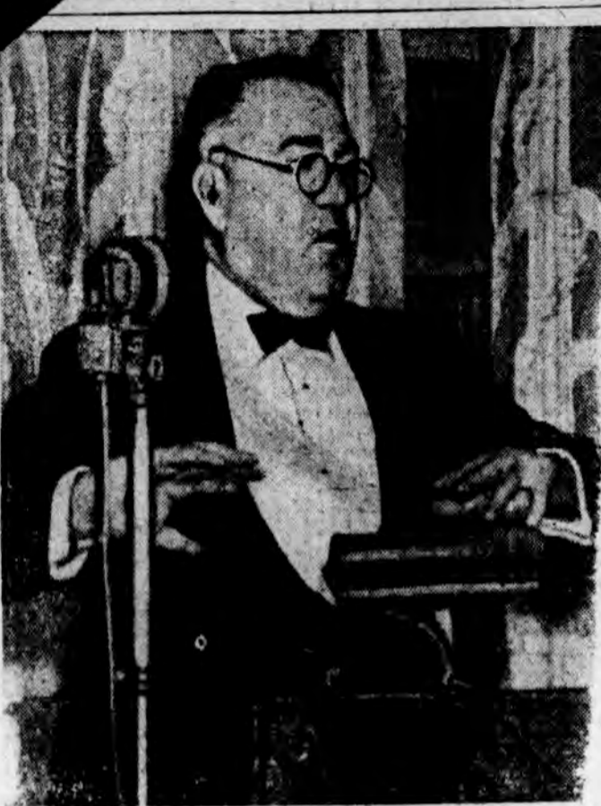
Turning that corner neared actually in speech of General Hugh S. Johnson (above) who told Economic Club of New York that he believes we have turned the corner toward improvement—so much so that I think the market is a buy. He also predicted trend toward conservatism in federal government.