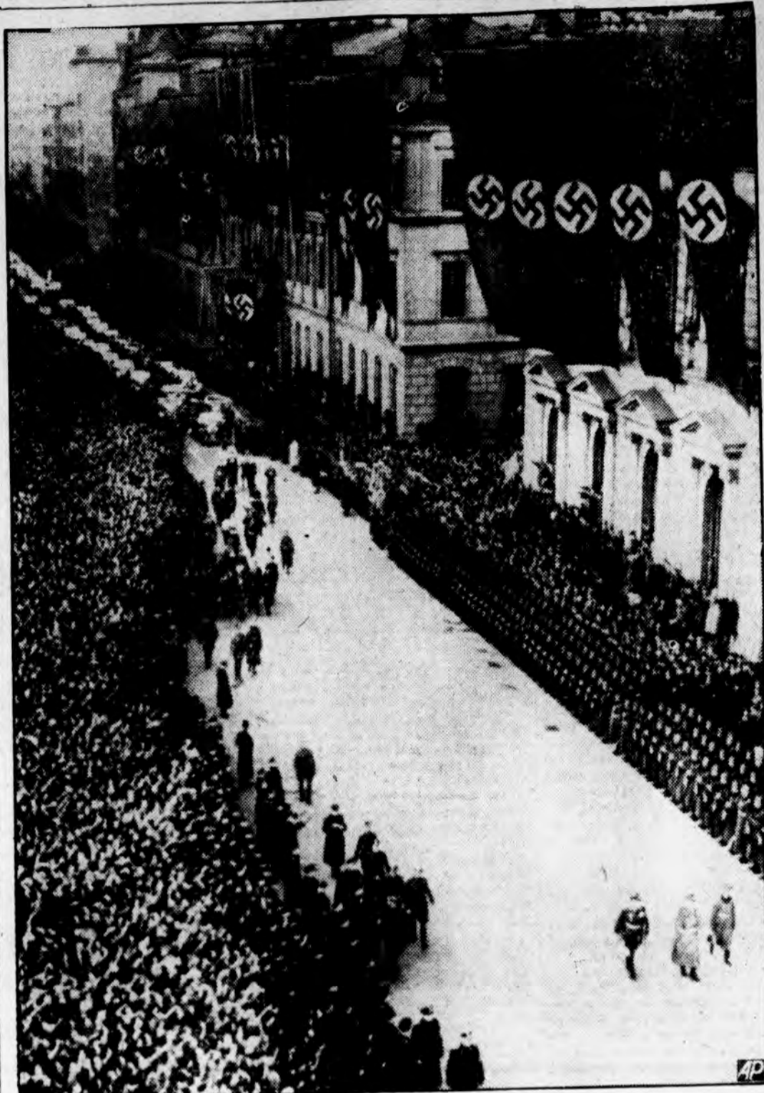
Just about everybody in Berlin turned out March 16 when Adolf Hitler came marching home again after his bloodless conquest of Austria. Below, at right center, is the Chancellor. On his right is his No. 1 man, Field Marshal Hermann Goering; on his left a regimental commander. Thousands of throats were roaring "Heil!" when this picture was taken. The swastika-draped building at right is the chancellery.