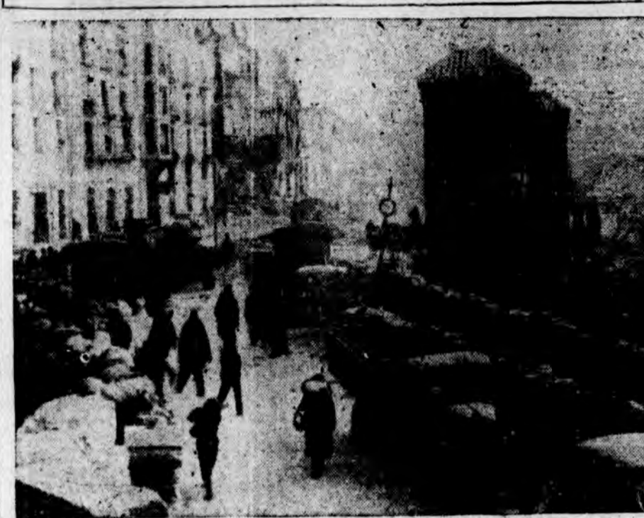
Sandbag barricades and shattered buildings still stand in Teruel as grim reminders of siege accompanying Franco's recapture of Teruel from government troops. Recent dispatches hint that Anglo-Italian negotiations may lead to withdrawal of Italian troops.