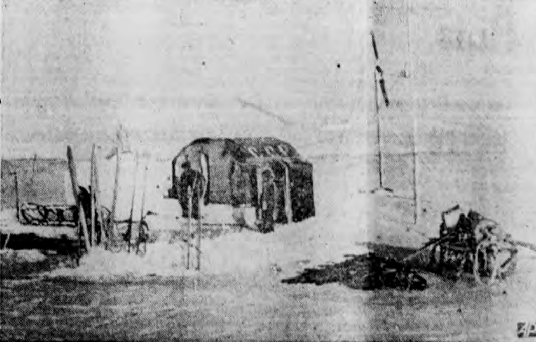
DESOLATE CAMP ON ICE FLOE was left without regret by four Russian scientists, who drifted 1,000 miles from North Pole to a point off Greenland before Feb. 19 rescue. Valuable records compiled by the scientists in the Arctic were brought back to the Soviet Union.