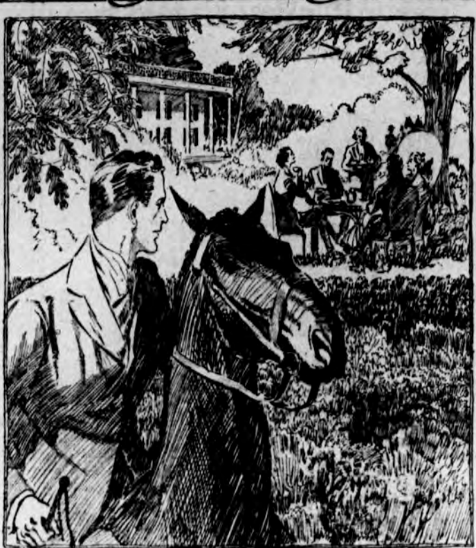
He was drawn against his will, like steel to magnet.

The Story So Far: The boxwood hedge surrounding Goodloe's Choice in the Maryland hunting district is a symbol and a sacred boundary. On the outside is Reuben Oliver whose self-made fortune is not enough to make him acceptable. On the inside is Judith Goodloe in love for years with dashing Gary Brent just home from abroad. T. is being served in the garden.