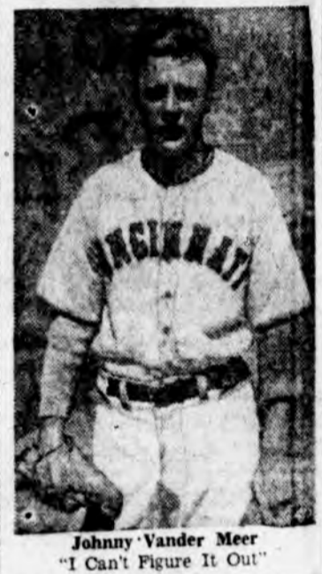
Johnny Vander Meer "I Can't Figure It Out"

Tampa, Fla., March 21.—The Typical American Boy is still wild. Johnny Vander Meer, Cincinnati's handsome young left-hander, has perhaps as much stuff as any rookie down under the Florida sun but he seldom knows where the ball is going.