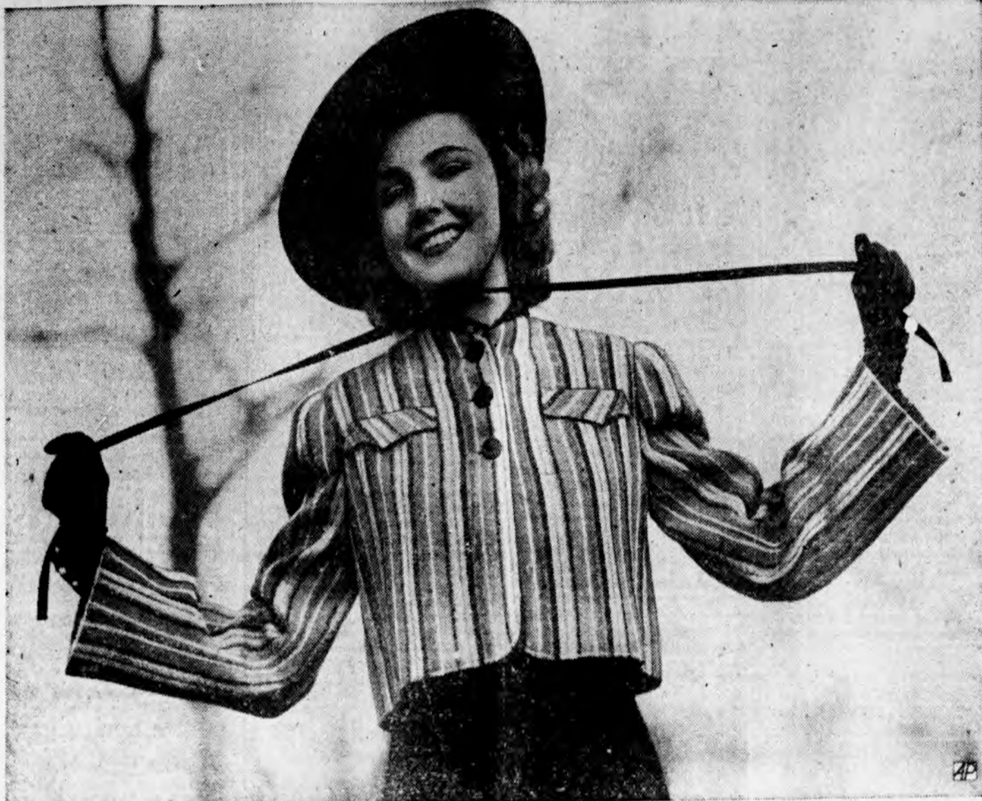
SPRING TONIC There is a "spring tonic smartness" to this season's use of links a gray, green and wine striped wool bolero with a stripes. One of the new costumes for immediate wear wine tweed skirt. It is worn with a big off-the-face felt hat.