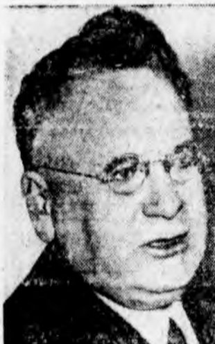
Maxim M. Litvinoff

A cultured wealthy Jew, he is back at helm in France after fall of another cabinet on issue of the franc. He has been a socialist depu- ty and champion of peace since the war. As premier in 1936 he won fight to keep France out of the Spanish war. As chief of a popular front coalition, he had to be an political strategist. At 66 he still is a penetrating logician, keen debater, aggressive leader. Blum gives his orders through Foreign Minister Joseph Paul-Boncour.