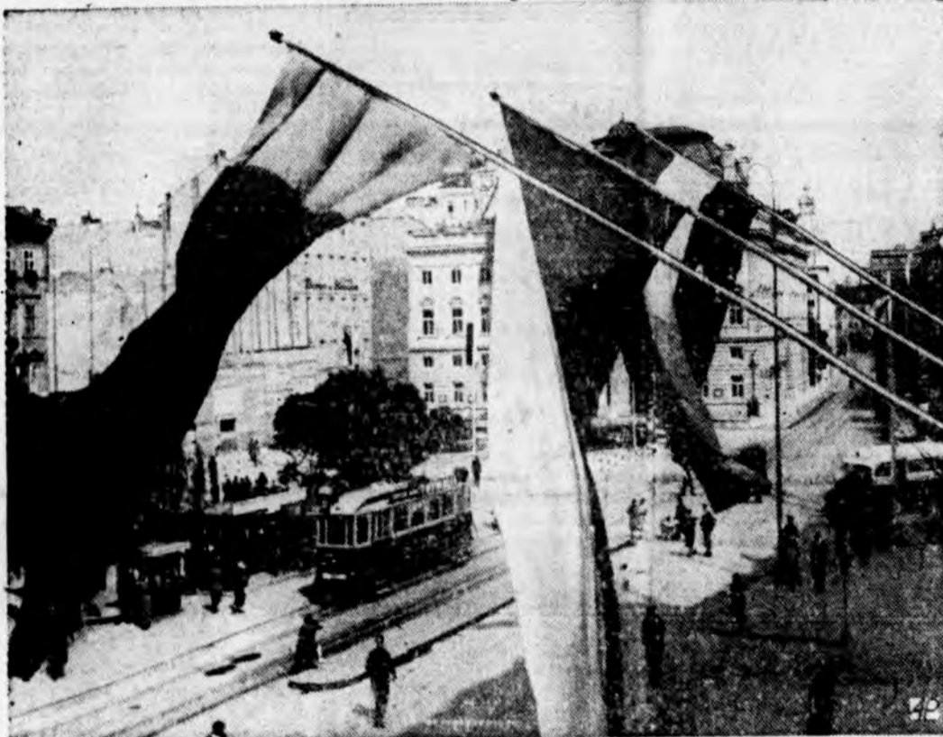
WHILE FLAGS OF THE 'LITTLE ENTENTE'—Rumania (left), Czechoslovakia and Yugoslavia (right)—flutter from window at Bratislava, statesmen recall Bismarck's words, "The Master of Bohemia is the master of Europe." And Czechoslovakia, with some three and a half million Germans among her people, awaits the next move of Hitler—the "dreamer of Berchtesgaden."

Army strengths in the table above as estimated by qualified military experts, are listed in the order of their rating for military effectiveness man for man and weapon for weapon rather than on a basis of numerical superiority.