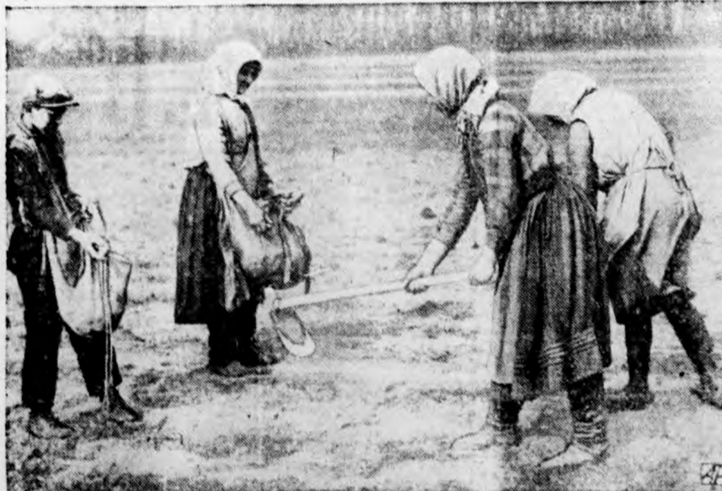
IN HER 54,000 SQUARE MILES, Czechoslovakia, which includes old Bohemia, has minerals such as coal, iron, gold. She is one of Europe's richest nations, agriculturally. Her peasants plant potatoes (above), harvest sugar beets and grains, especially barley for beer. Almost half of the more than 14 million population engages in agriculture. Forests produce more wood than is needed.