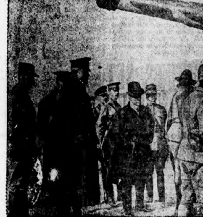
UNDER CAMOUFLAGED GUN walked Pershing (foreground) when he and the then Secretary of War Newton D. Baker inspected a ship being used for war purposes.