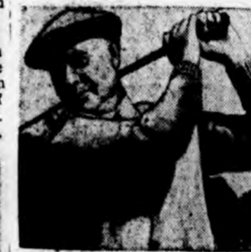
Harry Vardon "If He Only Had Been Able to Putt..."

The Amateurs Four great amateur competitors complete our top ten.