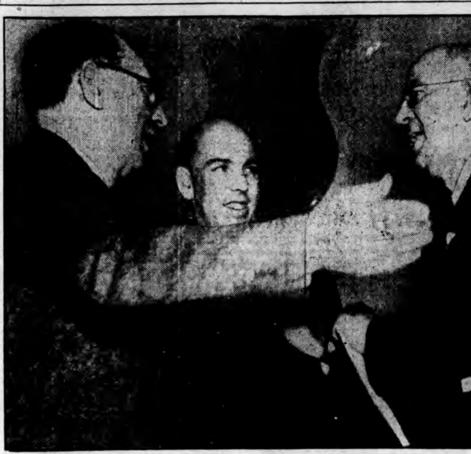
Admiral William D. Leahy (left), chief of naval operations, declared at the House Naval committee hearing in Washington that the United States could "very profitably" engage in the development of dirigibles but that it was more important that the nation build battleships, which he termed "the bulwark of defense and offense." Here the admiral is shown in a lively debate with Rep. John M. O'Connell (D-RI) (right). The third person shown is Rep. Ralph O. Brewster (R-Me.), an interested listener.