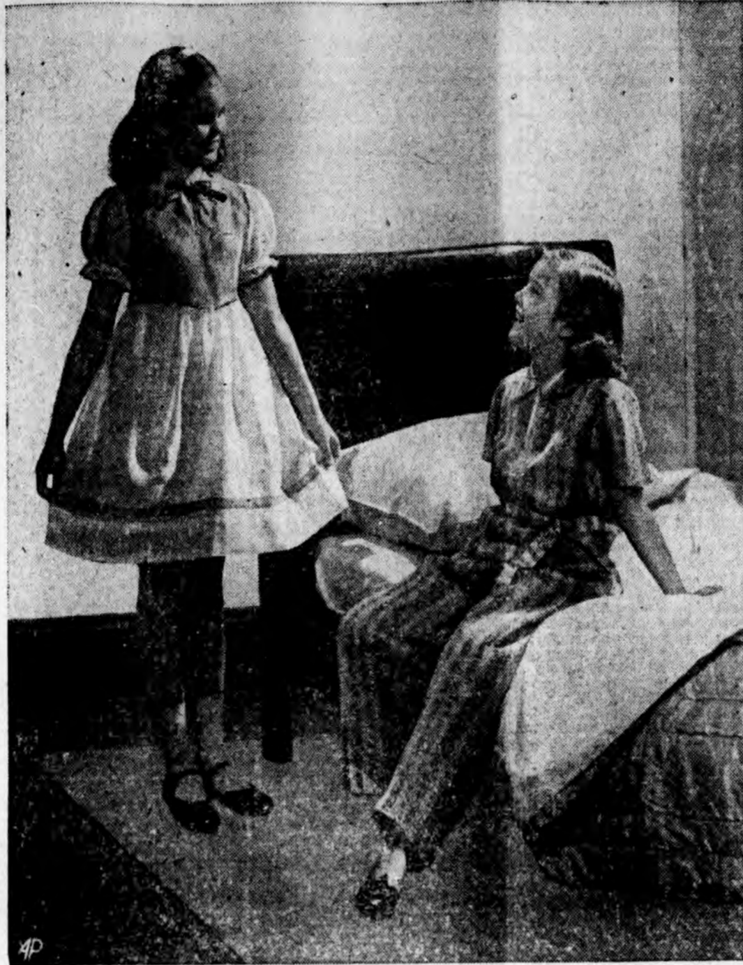
The Frock, Inspired by Snow White's Costume, of Blue and White Dotted Swiss; Those White Batiste Pajamas have Rose and Blue Floral Stripes.

When it comes to hats, bonnets are going to be smart for youngsters of all ages, the stylists declare. In these, felts in such shades as ginger and luggage-tan are slated for popularity. Boys' suits of cheviot, flannel or coarse serge, are designed with short, slightly flared trousers and double-breasted jackets. Washable play suits for younger boys combine a shirt and trousers which button to the shirt or are topped by suspender straps.