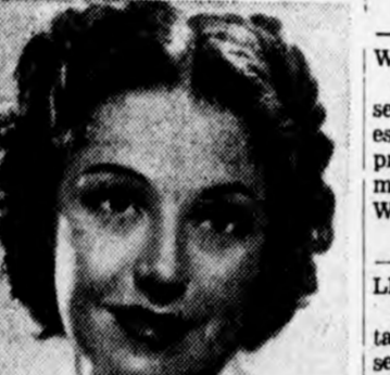
MARJORIE WEAVER (20th Century-Fox) chosen for her work in "Second Honeymoon," which revealed the directors sty, a "distinctive personality."