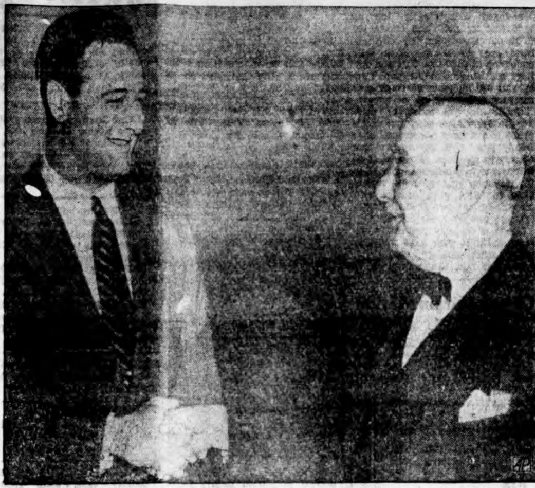
"Larrupin' Lou" Gehrig, ironman first baseman for the world champion New York Yankees, has joined the holdout ranks. Gehrig (left) here shakes hands with Col. Jake Ruppert, owner of the Yankees—but he made it clear to the Colonel that he wants about $40,000 to play this year. The Colonel announced that $35,000 was the limit.