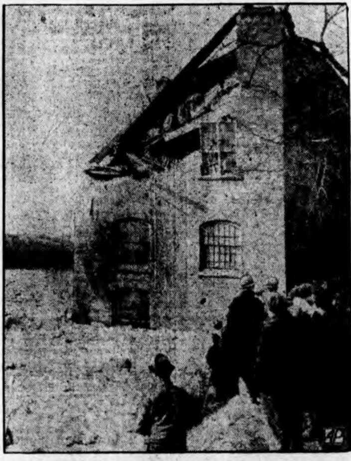
Partial collapse of this building at Amsterdam, N. Y., was brought about by the incessant battering of ice floes in the flooded Mohawk river.