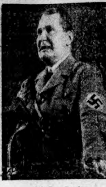
Col. Gen. Goering