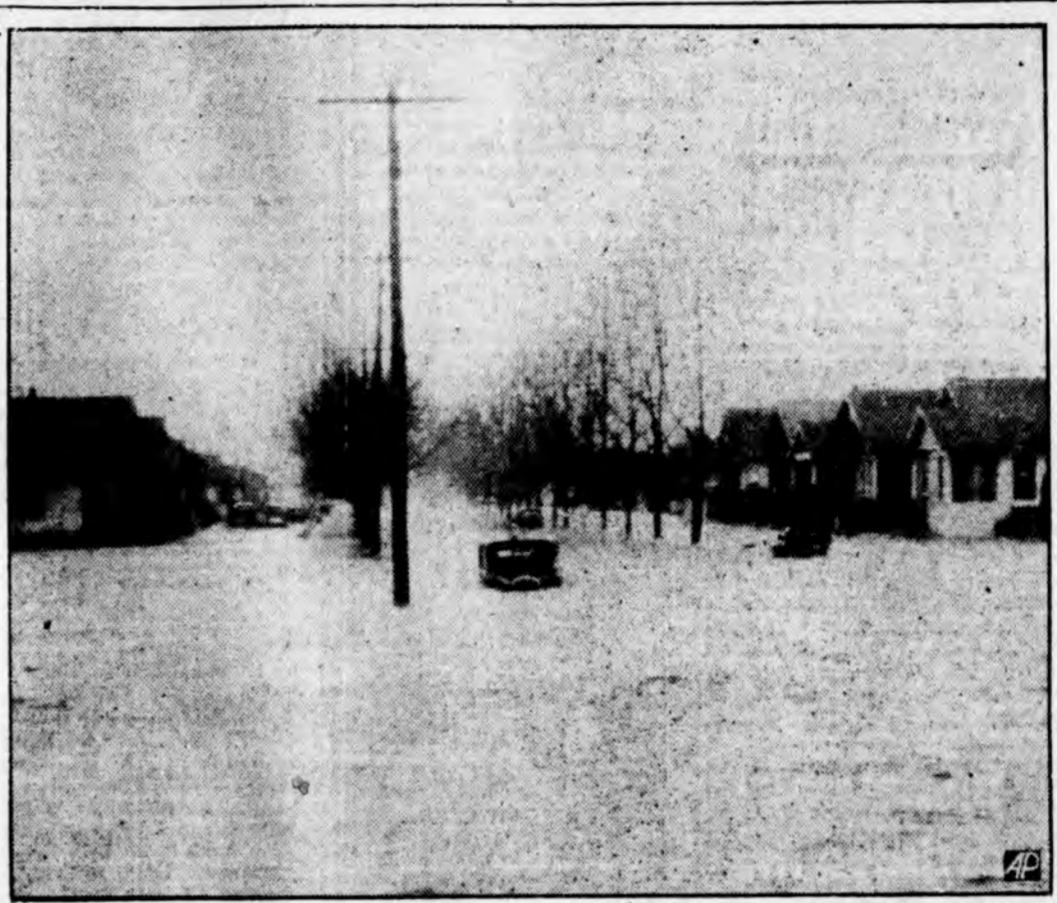
This scene in the northwestern section of Rockford, Ill., was typical of conditions when mid-winter flood water raced through that city. More than 60 families were driven from their homes.