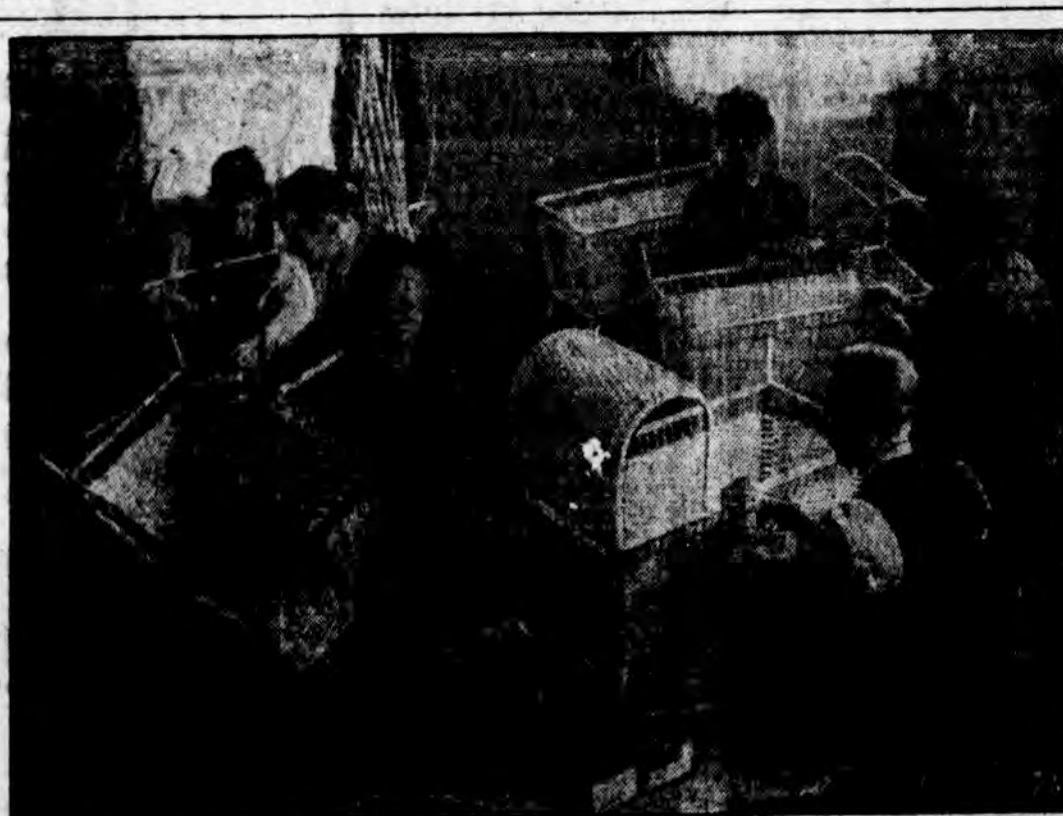
CRADLE WON'T ROCK WITH ROYAL HEIR to Holland's Princess Juliana whose approaching motherhood is a matter of joy to the Dutch people. If the baby is a boy he'll receive one of those rocker-cradles being made in a boys' school. In Amsterdam, an artillery battery has enough ammunition to fire the prescribed salutes: 101 rounds for a prince, 51 for a princess, and double honors in case of twins. Confinement is expected this month.