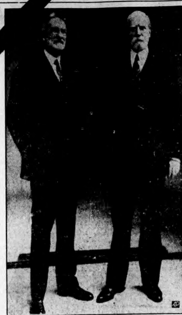
After 15 years' service on the Supreme court bench, Associate Justice George Sutherland (left) says farewell to Chief Justice Charles Evans Hughes.