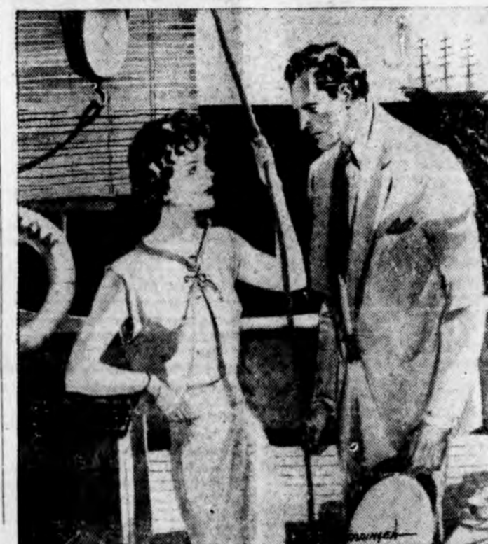
"What you do," said Christine coolly, "isn't of the slightest importance to us."

Chapter Two WE KNOW WHAT WE'RE DOING ROBERT FORRESTER stirred restlessly. "I assure you we quite know what we are doing," he said. "I point out to you that my father undoubtedly knew more about the native peoples of these islands than anyone else who has recently lived. If you will be generous, Captain Clyde, I believe you will admit that we have reason to know something about what we are doing." "I knew your father," said Clyde shortly. This was true, but it was unfortunate that his tone indicated clearly that he had not thought much of the man. Anthony Forrester, late owner of the Avon, had been a retired civil officer of