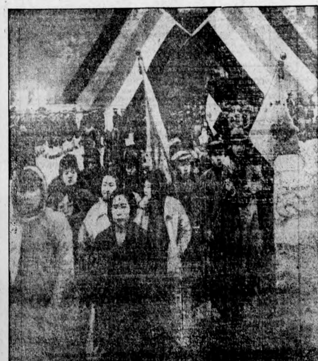
GRIM WERE THE FACES AND SLOW WERE THE STEPS of Chinese citizens who joined—but not happily—in parade celebrating establishment by Japan of a Chinese gov-