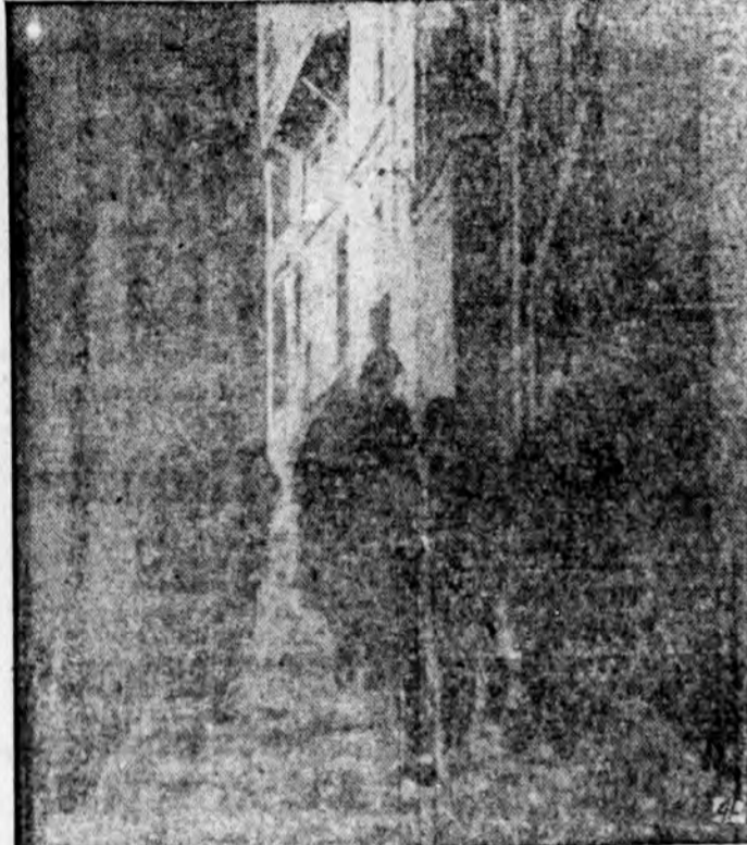
DEATH LURKS BEHIND CORNERS of winding streets in Teruel, Spain, where government soldiers are seen, making their cautious way in search for rebel snipers. Fiercest battles of the civil war have been fought between the government and insurgents for possession of strategic Teruel.