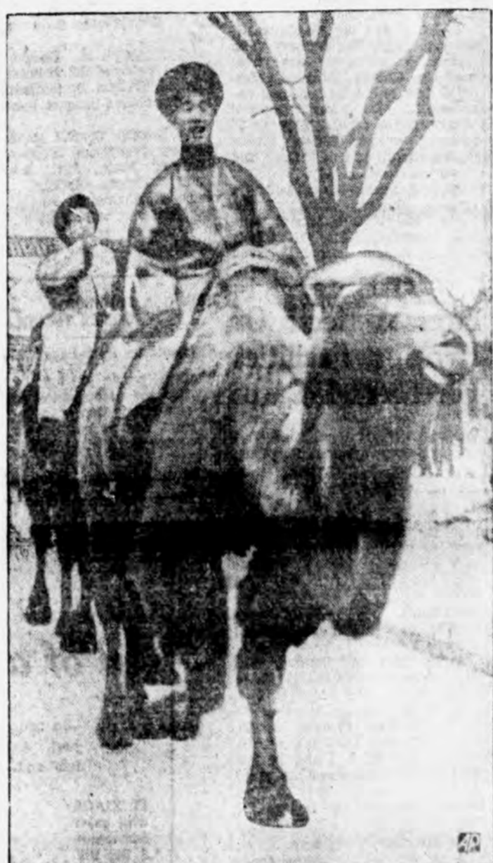
ON SACRED CAMELS rode the Rama priests during celebration for Japanese-inspired government at Peking, China. This smiling priest seemed not at all to mind the ride.