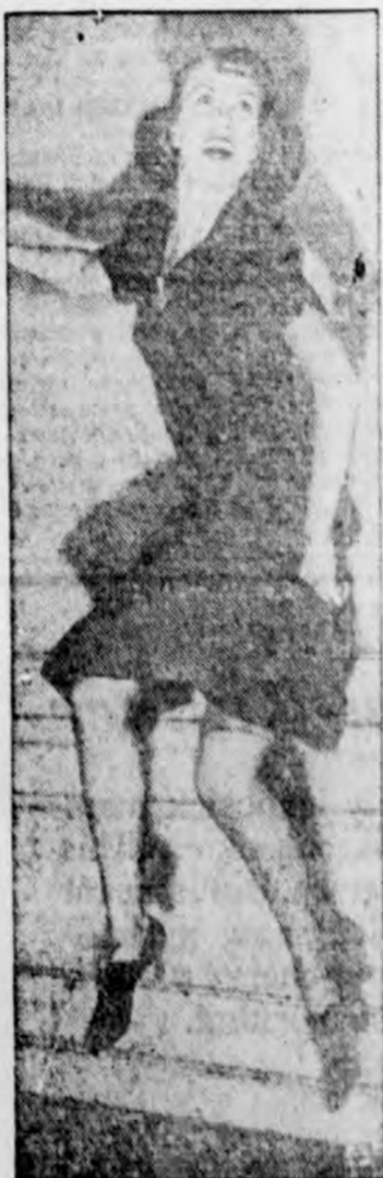
DON'T LOOK NOW but there's a new dance on its way. So says Eleanor Powell, who originated it, calling it the "chuck-a-boom" after the sound a bass drum makes. Above is one step.