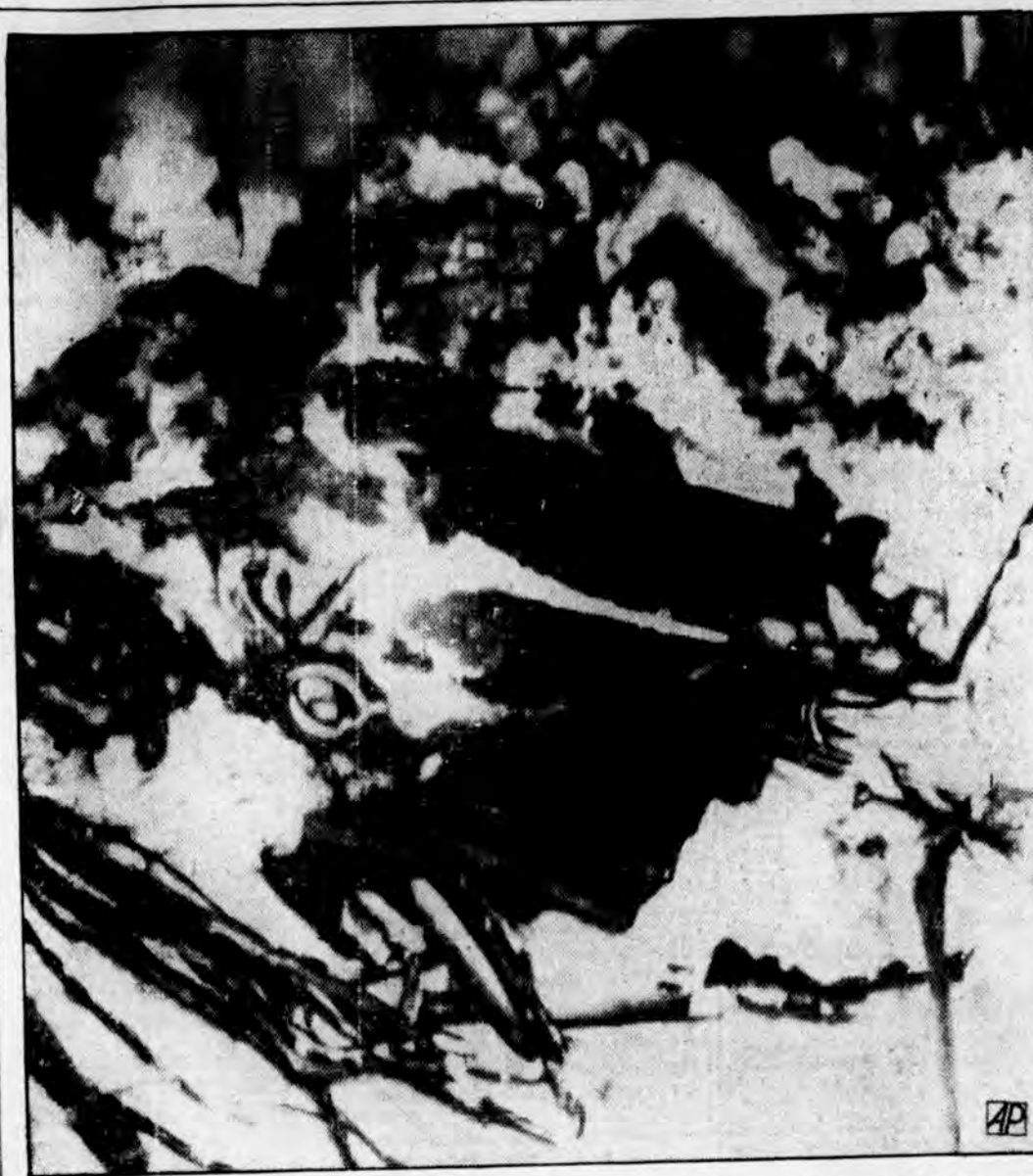
This charred and scattered wreckage on a mountain peak near Bozeman, Mont., graphically tells the story of the crash of a Northwest Airlines plane in which 10 persons perished.