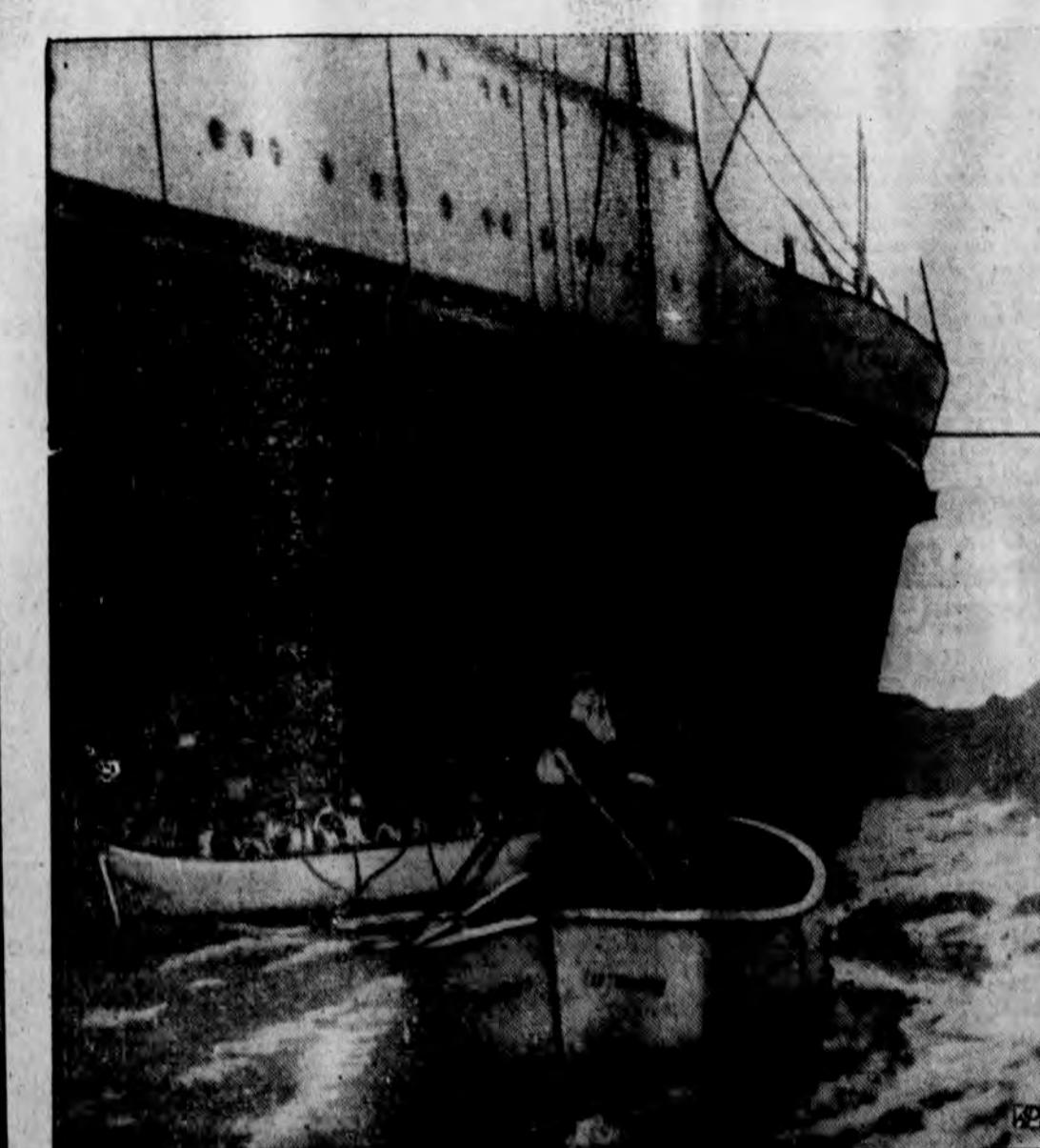
SEA PERIL WAS WORSE THAN WAR PERIL for the $8,000,000 S. S. President Hoover which ran aground near Formosa while trying out a new course to avoid Sino-Japanese war. Here, lifeboats filled with passengers are pulling away for nearby island.