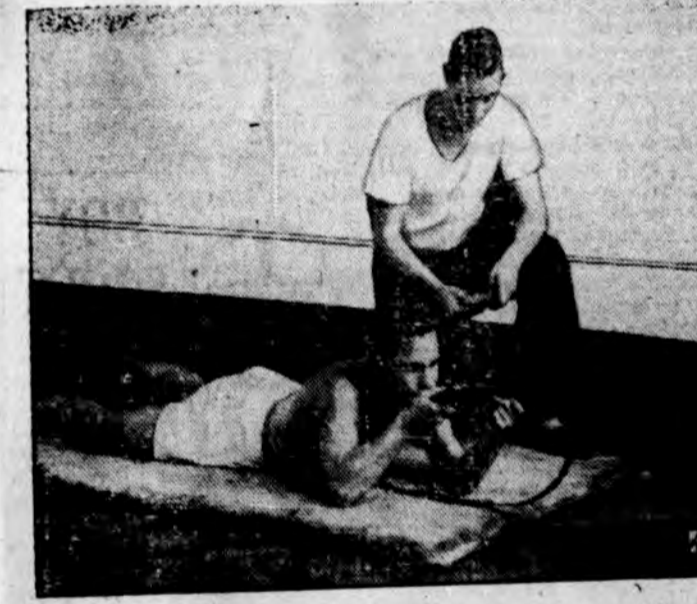
THAT AIM MAY BE TRUE, and death swift, Austrian schoolboys being trained for future wars learn to steady their arms by lying prone. Such classes are common in Vienna.