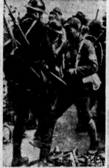
EAST MEETS WEST A French soldier disarms a Chinese seeking refuge in Shanghai's French Concession.

A Government Problem... In Spain, scoffing at compromise, El Caudillo Franco took his soldiers southward to continue the war into the winter.