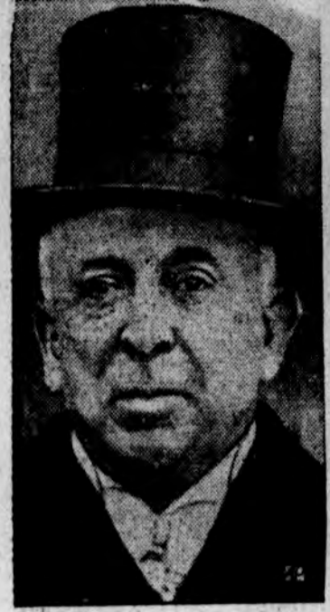
ANTI-SEMITIC Octavian Goga whose pro-German National Christian party opposes democracy, is new Rumanian premier. Fascists have long tried to swing Rumania Right.