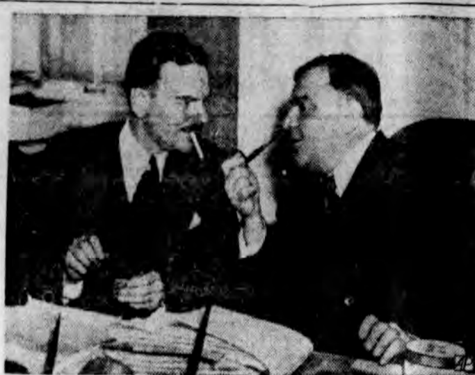
THEY BAGGED A BEAR Tom Dewey (left) and Fiorello H. LaGuardia.

The procedure should be politically safe. If the investigation should fail to disclose the collusion that Jackson thinks there is among powerful industrialists, no harm would be done. If regulation should be indicated, as he predicts, the Dem-