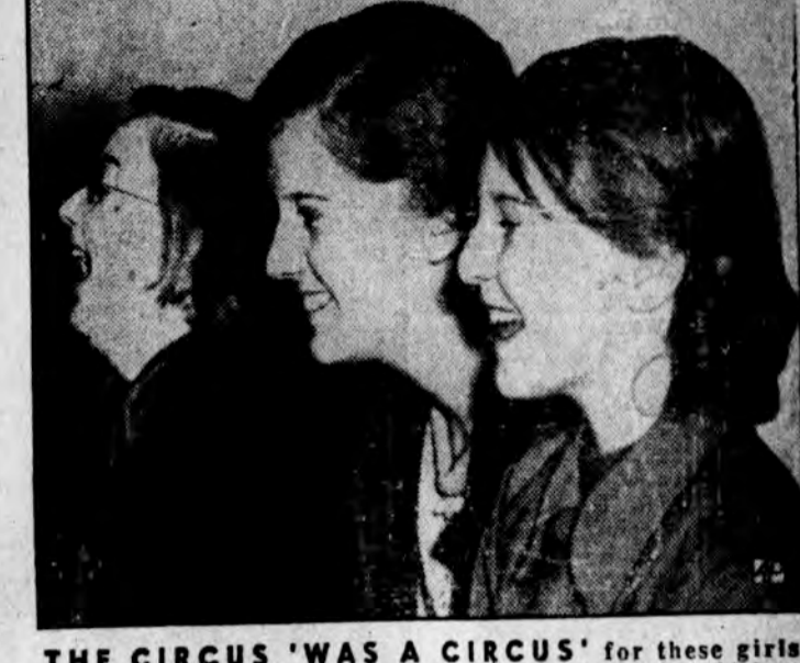
THE CIRCUS 'WAS A CIRCUS' for these girls laughing merrily at the antics of some clowns. Some 6,000 children saw the free show at a London stadium.