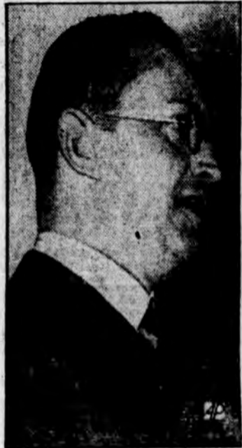
ALARM is felt over pro-Hitler activities of Konrad Henlein, 39, who is campaigning for autonomy for German people in Czechoslovakia. Government fears he'll disrupt republic.