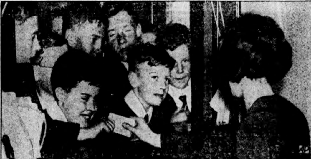
SWEET IS THE BUSINESS of the "tuck-shop" at England's exclusive Westminster school where end of study periods signals rush to buy candy, buns, chocolate and toffee. Big difference between these and American youngsters is that they call candy "sweets" and "biscuits" are cookies.