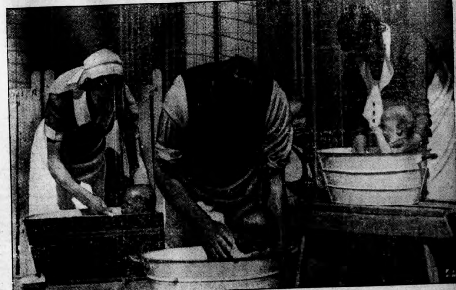
BORN THE MONTH A NEW KING WAS CROWNED. these triplets at Wellington, New Zealand, received the king's bounty and are being cared for at Karitane home. Even father helps mother and nurse at bath time. The three were born last May, at time George VI was crowned in London.