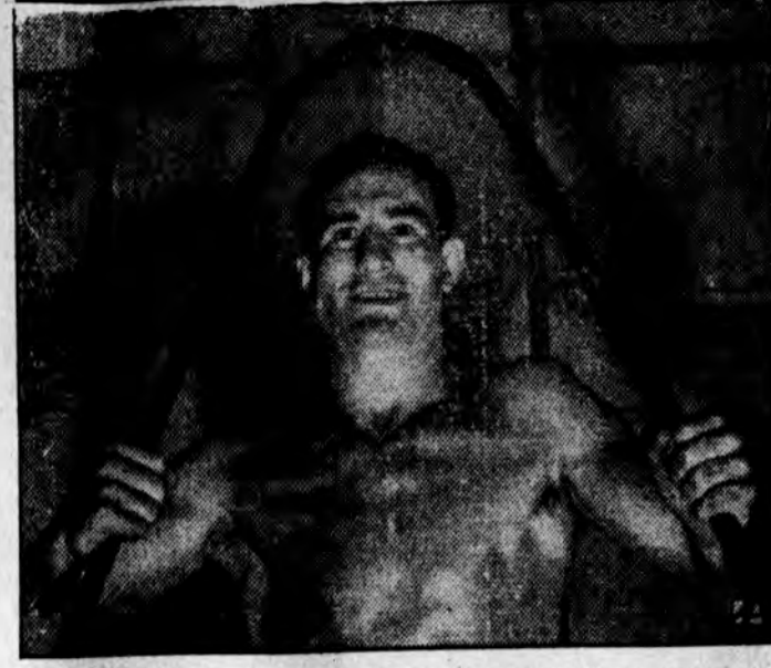
STEELING SELF FOR BATTLE with Fred Apostoli, Freddie Steele, middleweight champion, pulled this strong man stunt at his training camp in Summit, N. J.