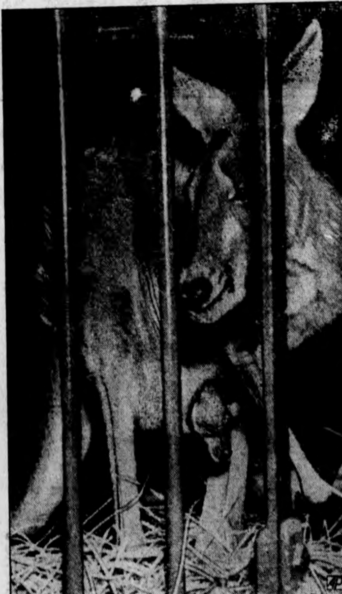
CROWDS SO UN-NERVED 'JIGGER.' a kangaroo at the Kansas City zoo, that she threw her 7-month-old baby from pouch, and it died. Crowds had flocked to view baby.