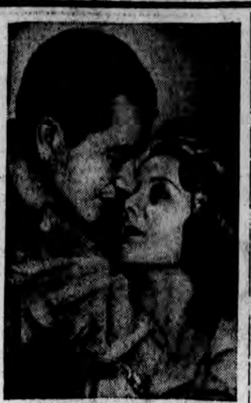
Robert Young and Florence Rice in "Navy Blue and Gold," glorious Annapolis romance which will be the Christmas day feature at the Pitt Theatre.

New York, (AP)—The man on the street—the average American worker in the manufacturing industries—made more money per hour in 1937 than he did in 1929, but, because of shortened hours of labor, he earned less per week. As computed by the National Industrial Conference Board, a research organization supported by large corporations, the average hourly wage, for the ten months ended October 31, was 61.7 cents. In 1929 it was 59 cents. By the week, the 1937 average was $27.52 in 1929 it was $23.55. The 1937 depression figures were 49.8 cents an hour and $17.05 a week.