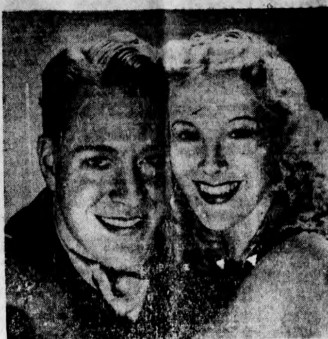
Nelson Eddy and Ilona Massey in "Rosalie" opening at the Pitt Sunday. Eleanor Powell is started with Nelson Eddy in this magnificent screen treat.