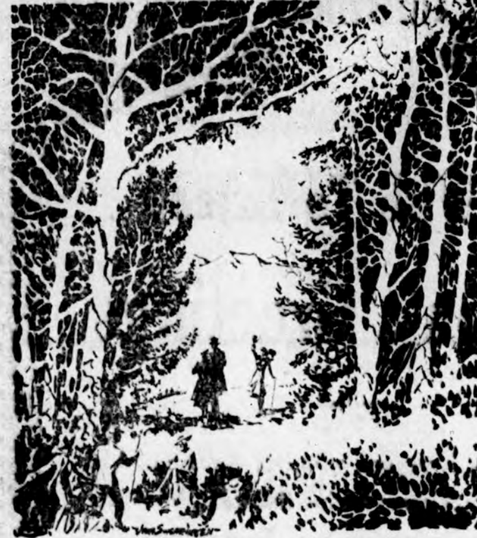
They struck deeper into the woods.

A Violent Intrusion They were just about to sit down to lunch when a great commotion arose in the kitchen. Running feet, excited voices. Then