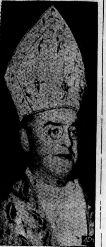
In ceremonies at Philadelphia, the Most Reverend Eugene Joseph McGuinness (above) was consecrated as Bishop of Raleigh in North Carolina. He has been general secretary of the Catholic Church Extension Society.

Auto Output Near 1929 New York, (AP)—Assembly lines pushed automobile output in 1937 to the second highest figure in history, turning out an estimated 3,000,000 cars and trucks. Ward's Automotive Reports, Inc., gives the 1936 production at 4,616,000, 1932 at 4,831,000 and 1929 at 5,622,000. In 1930 there were 138,834 Japanese and 74,954 Chinese in the United States.