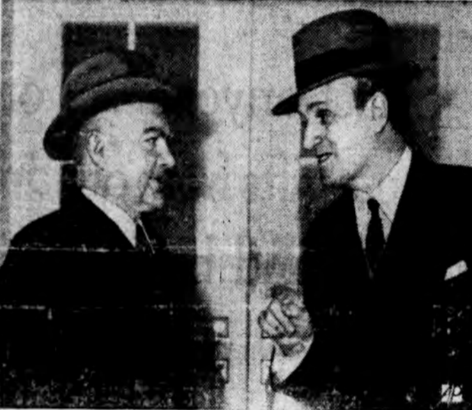
Judiciary Chairmen Talk Supreme Court Rep. Sumners (left) and Senator Ashurst at the White House.