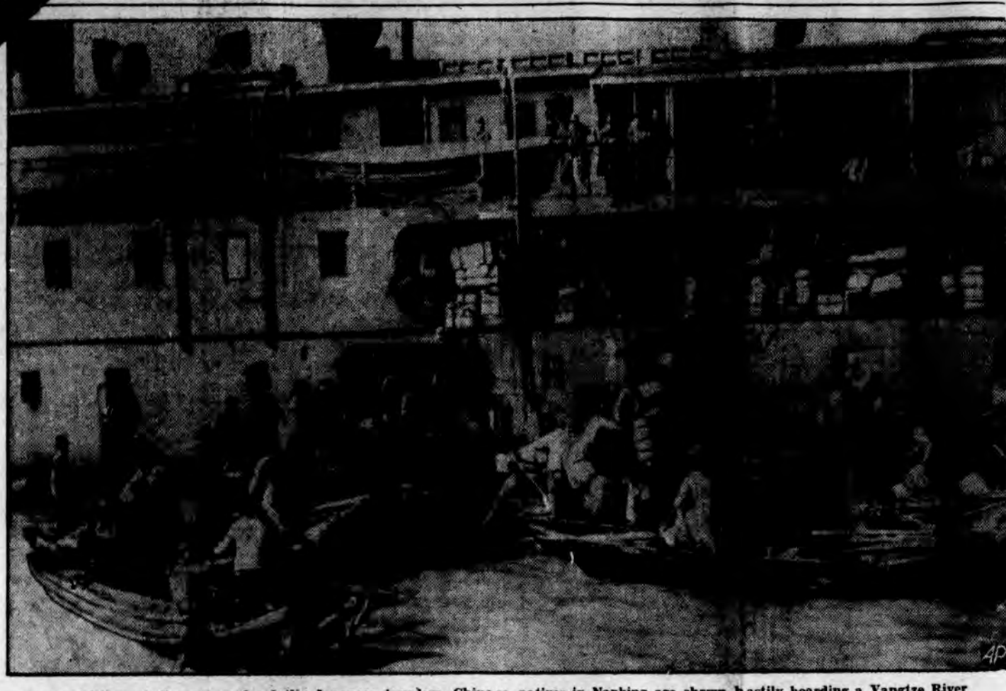
Terror-stricken at the approach of the Japanese invaders, Chinese natives in Nanking are shown hastily boarding a Yangtze River steamer for flight shortly before the capital city fell. The refugees were carried up stream out of gun range. This picture was flown to the United States aboard a Pan-American Clipper.