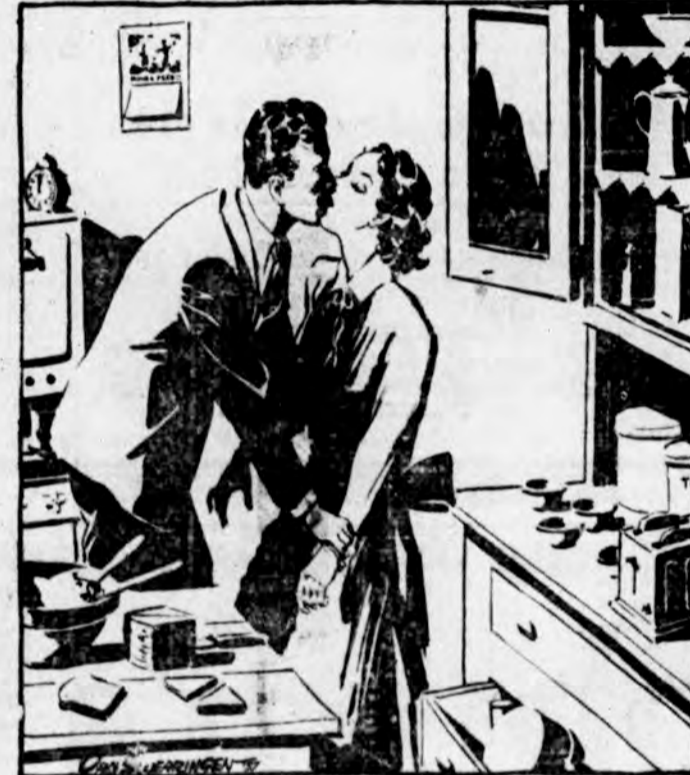
"Happy New Year!" cried Bill, and kissed her.

Chapter 13 Happy New Year! AS NELDA scrambled the eggs she thought briefly of Reck's party at Rio Del Mar that she missed. How unpredictable life was. Here she was in a green wool dress with one of Doris Powell's aprons tied around her instead of sitting at a table in the white tulle gown with a solicitous waiter hovering near to anticipate her every want. "You know your kitchen mechanics," Bill said. "Not so bad yourself," she retorted. "Case of necessity with me." "I've just learned to cook in the past few weeks—I mean everyday meals. The only thing I knew before that was chafing-dish stunts." "Guess you've found that life means more than chafing-dish stunts." "And how!"