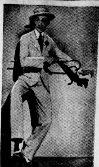
Mischa Auer, one of six featured comedians in Universal's "Merry-Go-Round of 1938," Pitt, Wednesday-Thursday.

Cincinnati (AP)—Bill McKeehnle, new Cincinnati baseball manager, has explained why he switches to a curve-stemmed pipe while hunting. He says it enables him to shoulder his gun without removing his pipe from his mouth.