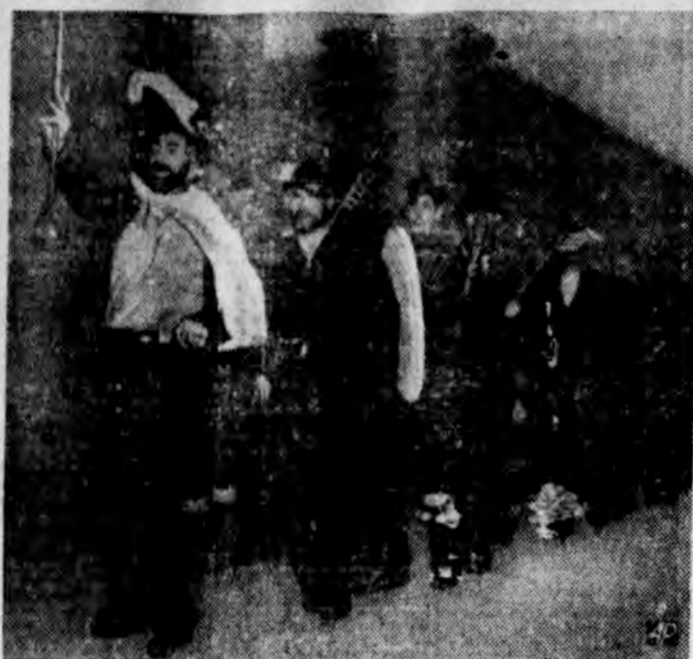
Sit-Downers Rise and Parade

A Premier Pays A black storm swept America's