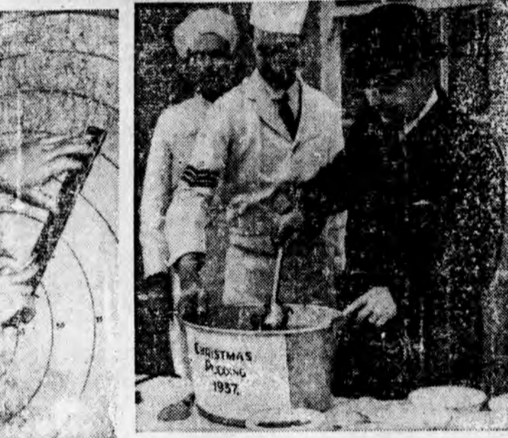
ARMY CHEF Leslie Hore-Belisha, British war minister, is shown taking a hand in the preparation of the pudding his British soldiers will have for their Christmas dinner.