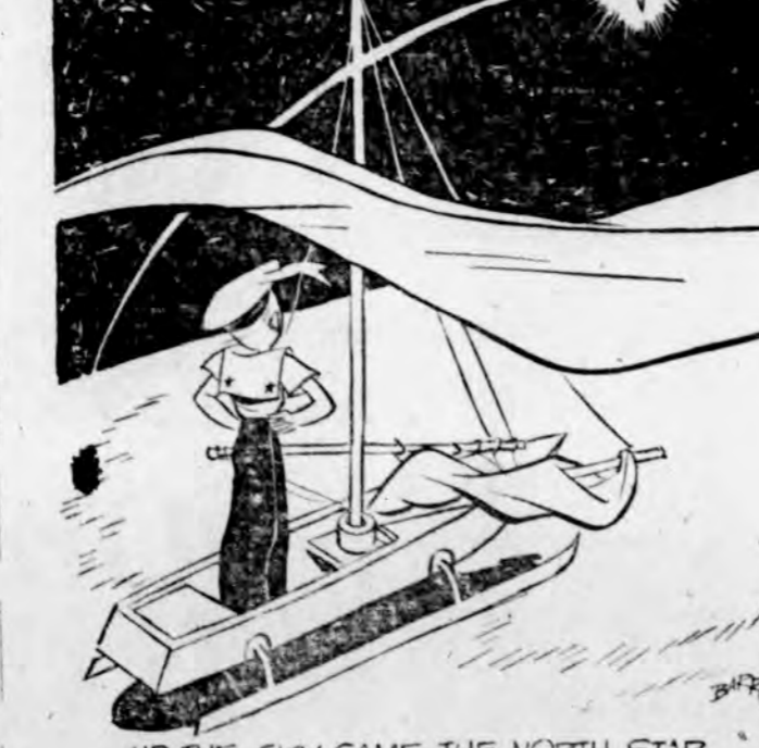
UP THE SKY CAME THE NORTH STAR

THE STORY SO FAR: A sailor or doll, who is attempting to rescue Helga, one of Santa's dolls, from a white fox held in a squirrel village because the squirrels want his help for a son that was bewitched.