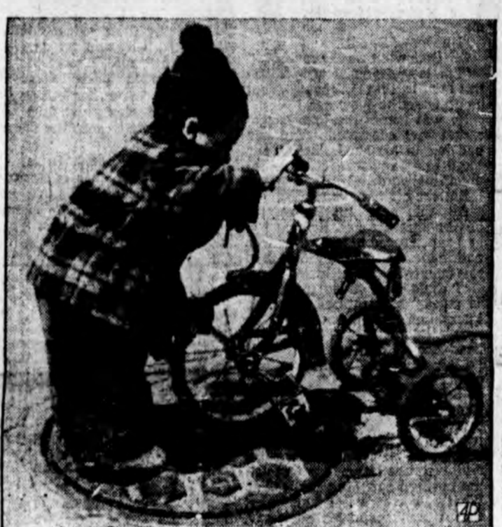
A good toy, such as a tricycle, provides exercise.