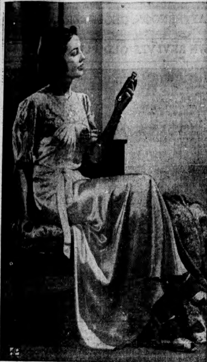
SLEEVED NIGHTDRESS—nightdresses have sleeves again. Here you see them in a short puffed version made of Alencon lace and attached to a round-necked yoke of the same lace. The gown is a luscious ivory satin.