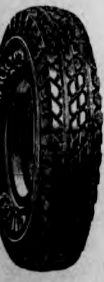
RETREADED BY S. AND A.