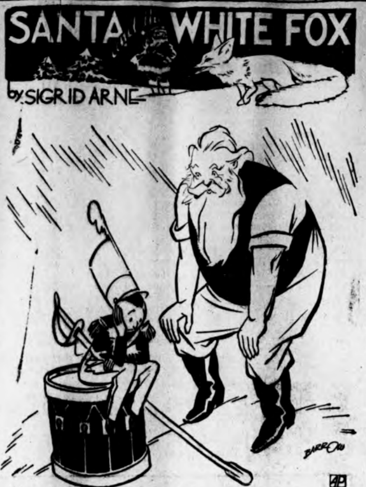
"PERHAPS WE'D BETTER HAVE A TALK"

DO YOUR CHRISTMAS ELECTRICAL SHOPPING UNDER THE BEACON There you will find prices and terms to suit. Look for the beacon light.