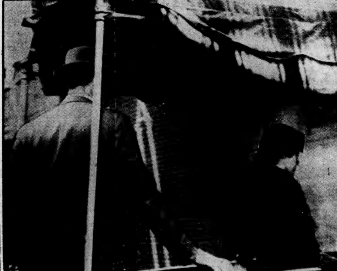
Coming down the third-class gangplank in an effort to hide their arrival, Col. and Mrs. Charles A. Lindbergh are shown as they reached New York aboard the liner President Harding for a surprise visit to America. Their voyage was marked by complete secrecy and ended temporarily at least— their two-year, self-imposed exile abroad. The "Lone Eagle" refused to talk with reporters, but ship's officers explained they had come to spend the Christmas holidays with Mrs. Dwight W. Morrow, Mrs. Lindbergh's mother, in Englewood, N. J. Their two sons remained in England.