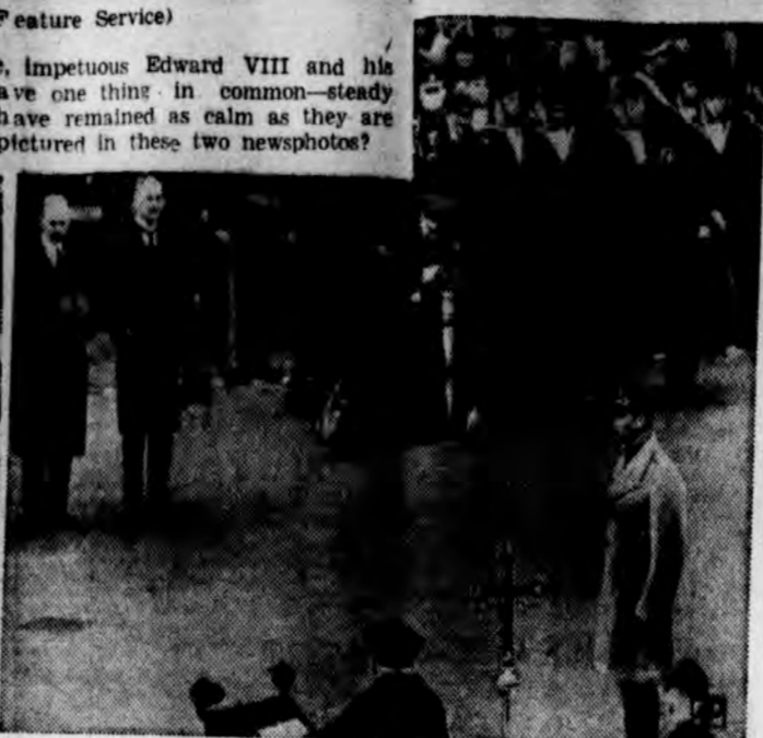
NOV. 11, 1937 George (foreground) moved not a muscle as police suppressed a shouting spectator a few feet to his right when the man broke the two-minute period of silence and rushed at him while the king stood at attention before cenotaph in Whitehall on Armistice Day.