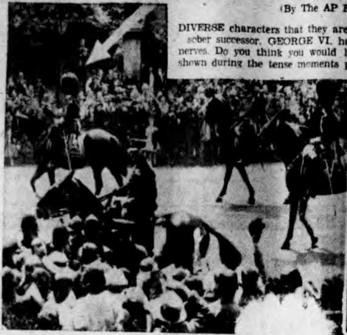
JULY 16, 1936 A quick glance to his left was the only indication Edward (arrow) gave of even noticing the disturbance when a spectator slithered a pistol at the feet of his horse as the king rode through the streets of London in ceremonies celebrating his birthday.

DIVERSE characters that they are, impetuous Edward VIII and his sober successor, GEORGE VI, have one thing in common—steady nerves. Do you think you would have remained as calm as they are shown during the tense moments pictured in these two newsphotos?