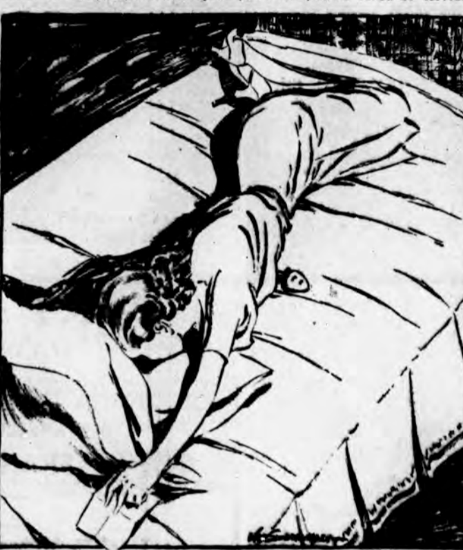
Nina flung herself on the bed and wept and wept into the pillow.

Had he heard then, from Honey, when he drank out of it? Had he raised it to his lips, for the first delicious swallow, all unsuspect-