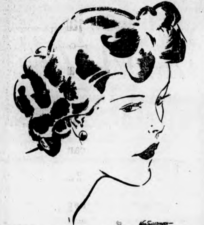
Nina was falling in love. It was the most extraordinary thing.

AFTER David, too, had had a slight and much needed builder-upper with the girls, he exclaimed: "Whew! What an afternoon! Little David with a breath on him like a brewery, demonstrating a closed car, to somebody's Aunt Minnie... aged 70. And the floats... what a case of the floats! I was glad when she insisted on having the windows up, I was afraid I might just drift out of one." "David," explained Nina, "was a verve bad boy last night." "Your partner in crime was just here, my friend," remarked Cordelia, naughtily. "Who—Jack? Oh—Gracie. Really? He didn't seem to care much