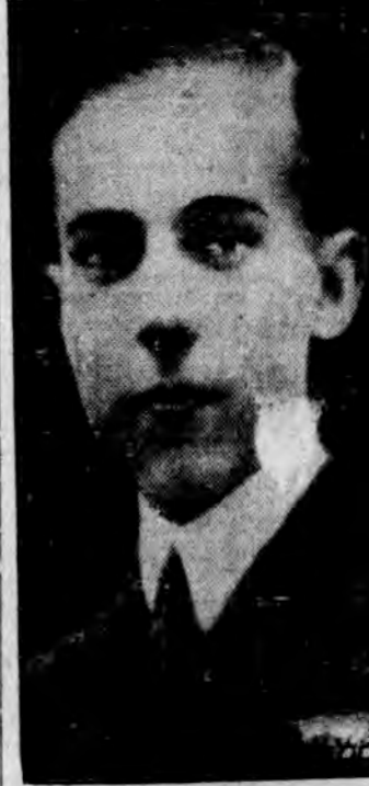
The Count of Paris (above), heir apparent to the non-existent throne, was asked to leave Switzerland when police said they learned he planned to issue a manifesto in the name of his father, the Duke de Guise. The heir pretender Duke, however, released a manifesto from Belgium where he is now an exile. It created intense excitement among royalists when distributed in Paris.