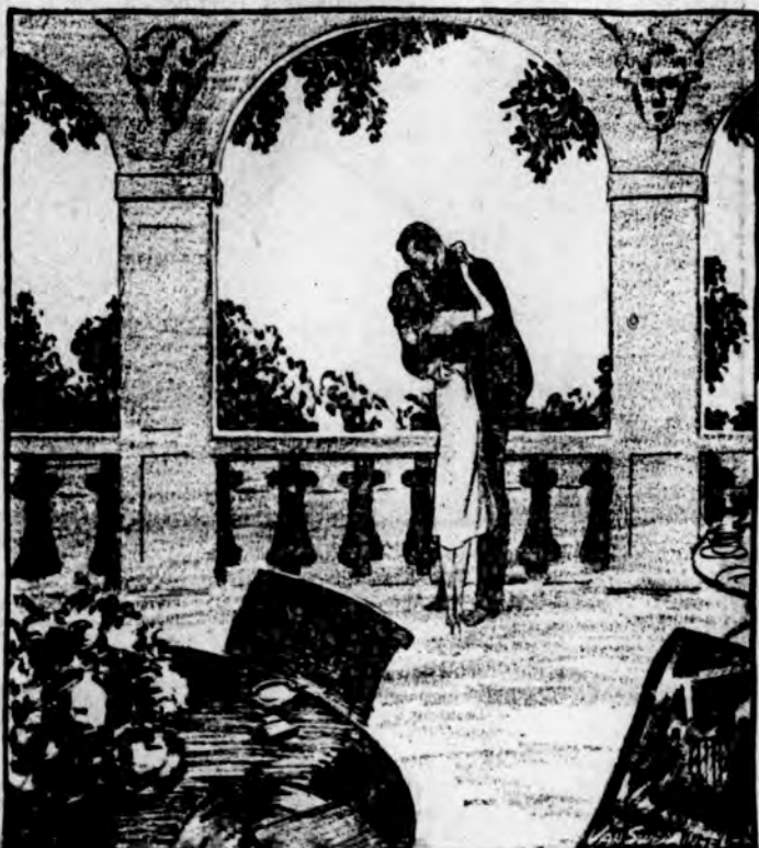
Richard said: "Adorable," against her ear, and then began to kiss her—slowly.

Richard kept to a conservative 55. At Ardsley they turned off, and after a few miles drove in between