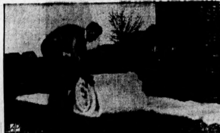
A flower bed gets a glass "wool" blanket.

(By the AP Feature Service) Delicate plants now can take their winter naps under a warm blanket of glass "wool," free from the danger of frost and hard freezes. "The wool" is made of fibers of glass finer than human hair. It is snow white, as soft as cotton fluff, and so light a four-year-old could muscle up a hogshead of it. It's properties as a "mulch," or winter covering for plants, were discovered by R. C. Allen, of Cornell university. It is sterile, lets in a little air and light, keeps out rodents, insects, weeds. It comes in rolls, like cotton; is easily spread, as demonstrated in the picture; and may be rolled up and stored for use year after year. The glass "wool" is made by several companies. At the Corning Glass Works, Corning, N. Y., the output in one day, if stretched out in a single fiber, would reach from earth to the sun.