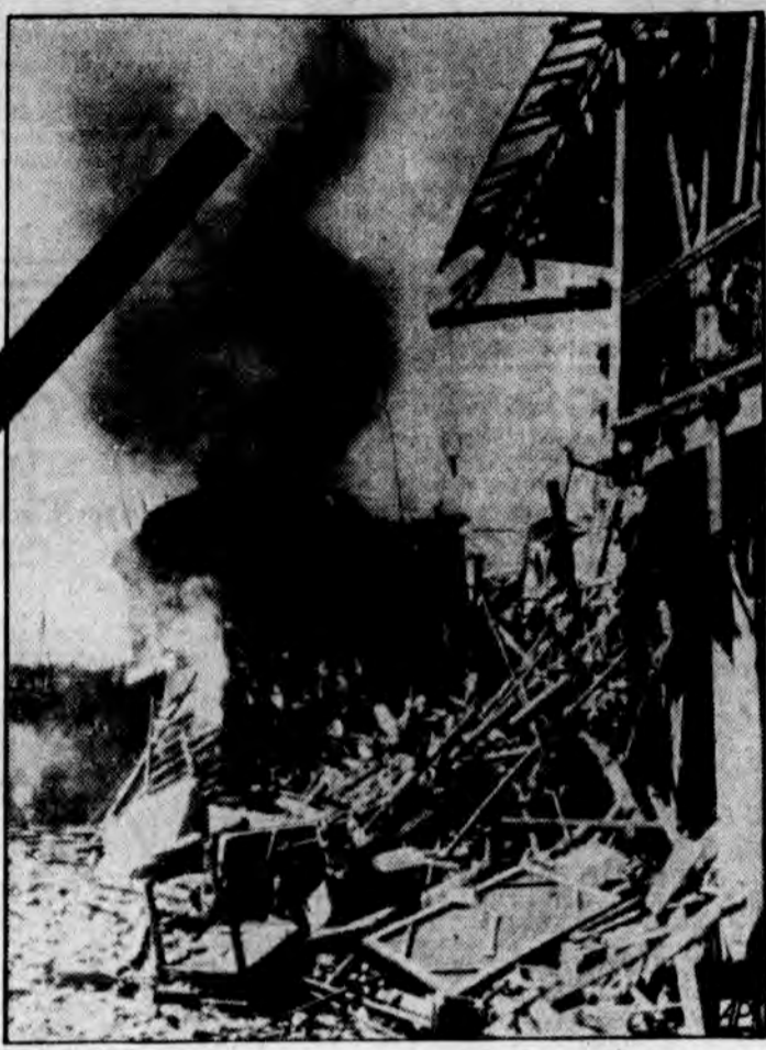
Twisted, smoking debris such as shown here was just about all that remained of Shanghai's Chapei section when the hard-fighting Chinese finally surrendered it to the Japanese. The Chinese were reported strengthening new positions despite current rumors that they might abandon the entire Shanghai front.