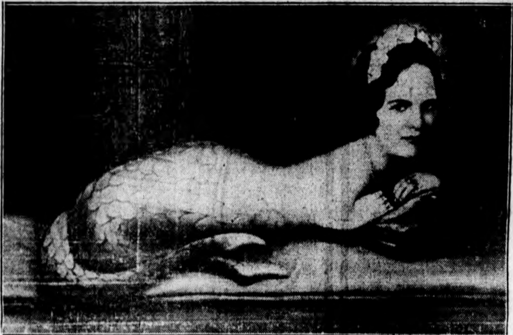
"Sea-Tiny," pictured above, one of the feature attractions with the Mammoth Marine Hippodrome, that will exhibit here for one day only, Wednesday, November 10. This young lady is usually the center of interest aboard the exhibition car; in fact, has been known to "steal the show" from "Colossus," the 68-ton sea monster, also featured.