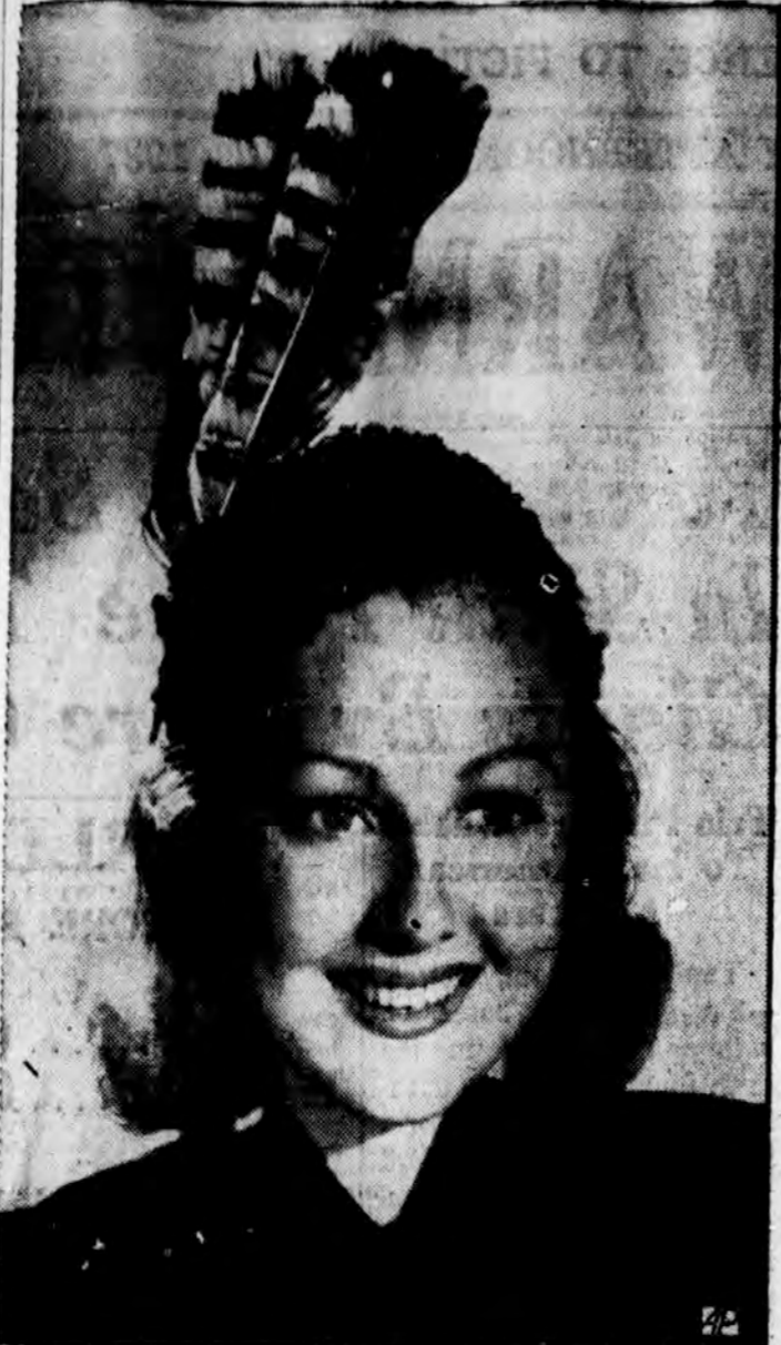
POCAHONTAS PLUMAGE —Two stiff quills, standing in Pocahontas fashion, add dash to this new fall chapeau worn by Virginia Grey, film actress. Their scarlet and gray stripes add a flash of color to the skull cap made of narrow notched bands of black felt.

ago Grand Opera Company, and many others; and last May was added to the bass-baritone section of the Metropolitan Opera Association.