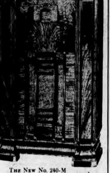
The New No. 240-M EQUIPPED WITH LABYRINTH TRIPLE RANGE - $191.50

The function of radio is accurate reproduction of broadcast programs; the main thing to consider in buying a radio is tone. Many other things enter in, of course, like modern, beautiful cabinet design, easy, accurate tuning, and getting many stations the world over clearly. For all these things, There Is Nothing Finer Than a Stromberg-Carlson. But what we emphasize is the glorious Natural Tone of a Stromberg-Carlson, made possible by the Labyrinth. Labyrinth Radio reproduces programs exactly as they are poured into the microphone, adding nothing, removing nothing. Such tonal perfection can not be duplicated, for only Stromberg-Carlson has the patented Labyrinth—the invention that is