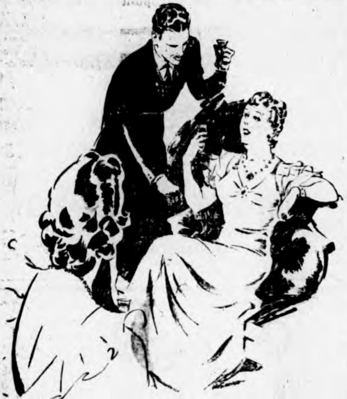
Nina looked at Richard Challoner, critically, for the first time as he bent over Honey.

Chapter Three A Drink to the Bride "It's true all right, I'm happy to say," Richard drew Honey to him in a very sweet way. Something that had felt all taut and constricted—her heart, maybe—relaxed in Nina's breast. Honey was saying: "And I have the heavenliest last name." "What is it, darling?" "Challoner." "Oh, my, yes. It's very, very something, isn't it? 'Richard Challoner.' I like it; and 'Honey Challoner,' too." They were still standing in a little huddle in the upstairs hall. "Would you two grinning things mind coming in and giving me a little data?"