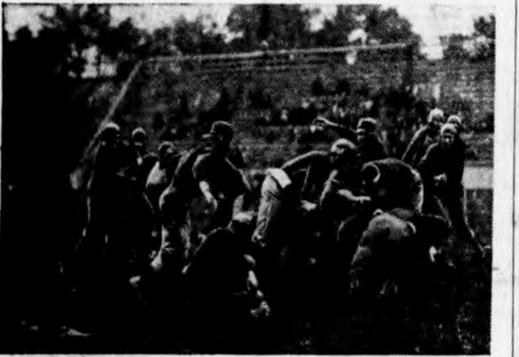
THEN, IN 1913 . . . Ohio State's first football team looked like this in action. The dress of the official is different today, and the outfits of the players. But the biggest differences at Ohio State are in the stadium and in the size of the crowds.

Ohio State's first football team looked like this in action. The dress of the official is different today, and the outfits of the players. But the biggest differences at Ohio State are in the stadium and in the size of the crowds.