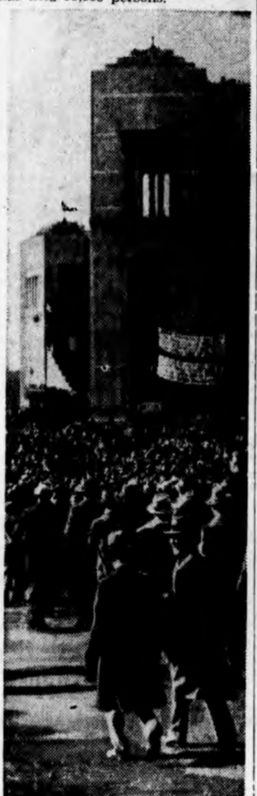
NOW, IN 1937 The scene looks like this as 90,000 eager persons flock to the Buckeyes' $1,600,000 stadium for a home game.

The scene looks like this as 90,000 eager persons flock to the Buckeyes' $1,600,000 stadium for a home game.