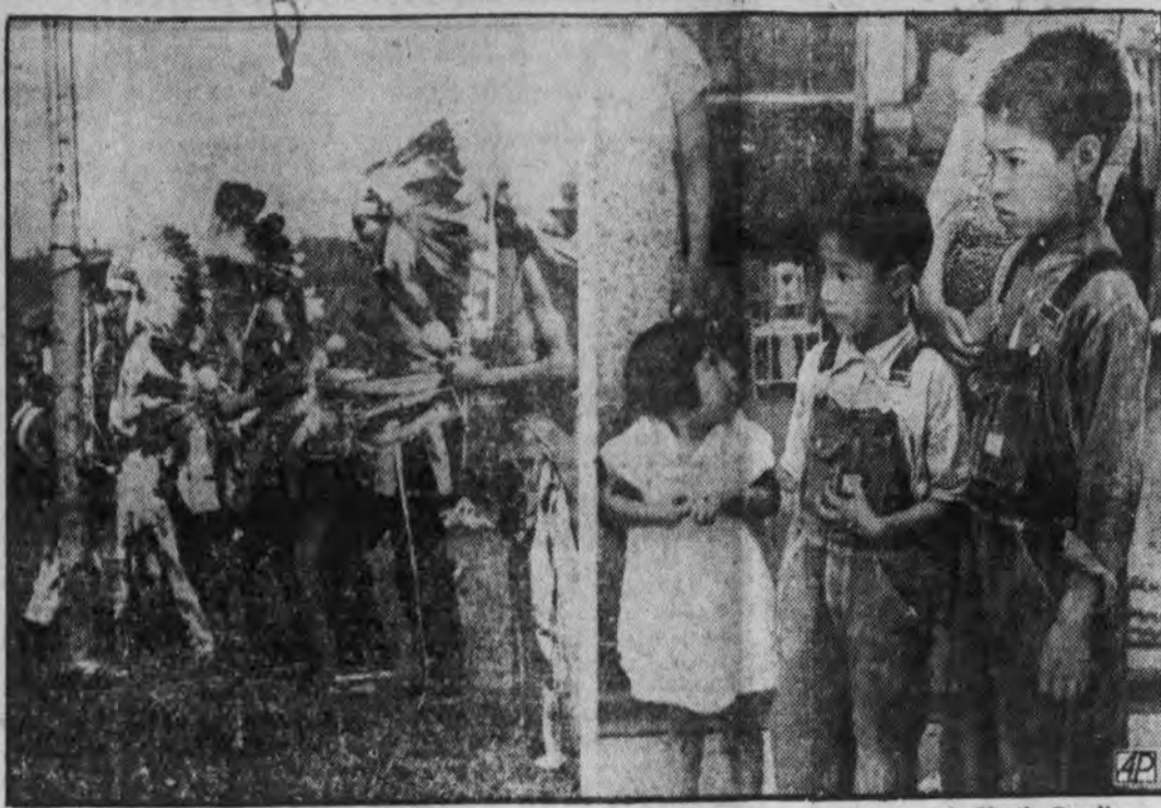
Still distrustful, perhaps, of some of the white man's motives, Cherokee Indians of North Carolina have thus far blocked efforts to build the Skyland Parkway through their reservation to the Great Smoky Mountains National Park. While the route of the $100,000,000 scenic highway hangs in the balance, the 3,000 Indians debate in tribal councils and prepare to vote soon in a referendum on the proposition. These pictures show the Cherokees in characteristic scenes on the reservation. Left, a group of braves in ancient regalia enjoy pageantry in the stadium of their modern school at Cherokee. Right, Indian children in a trading post appear quite puzzled over the behavior of tourists who insist on taking their pictures.