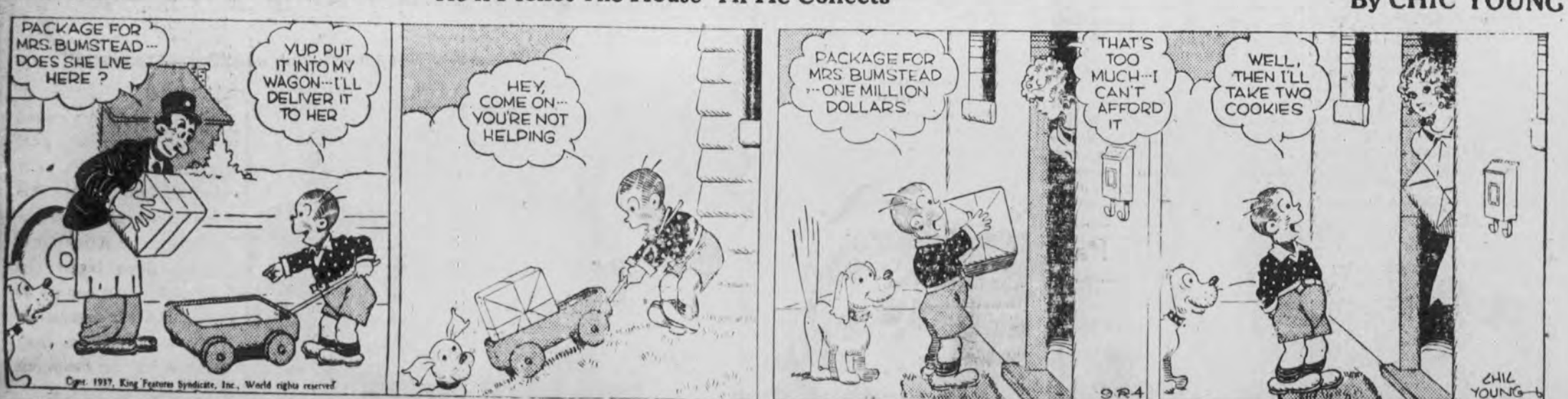
He'll Picket The House 'Til He Collects'