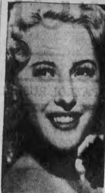
Beautiful Barbara Stanwyck featured in 'Stella Dallas' screen treat opening at the Pitt Theatre next Wednesday.