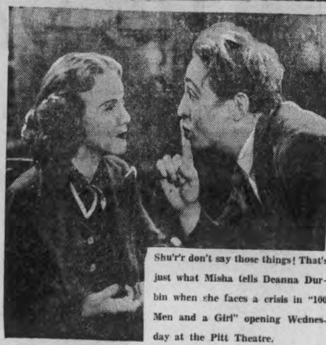
Shu'r'r don't say those things! That's just what Misha tells Deanna Durbin when she faces a crisis in "100 Men and a Girl" opening Wednesday at the Pitt Theatre.