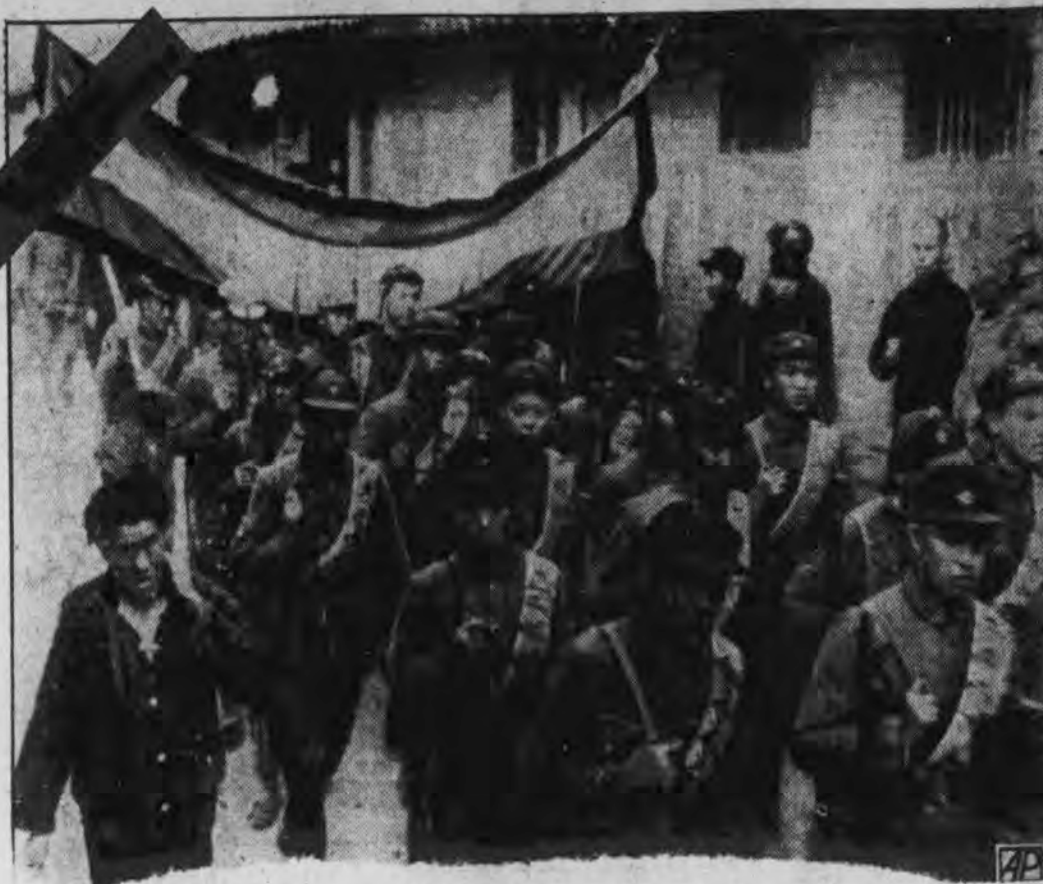
Forgetting their own fight with Chinese Nationalists, these Chinese Communists are marching toward Peiping and Kalgan to join the Nanking government in a united front against the Japanese. The banner they carry praises the "Brave Heroes of Spain," indicating their sympathy for the Loyalists.