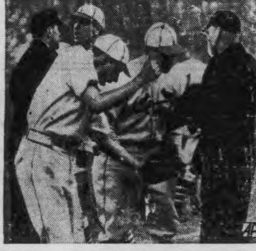
In the old days this would have marked the beginning of a grand free-for-all, but this little episode ended peacefully for the players and two ump.