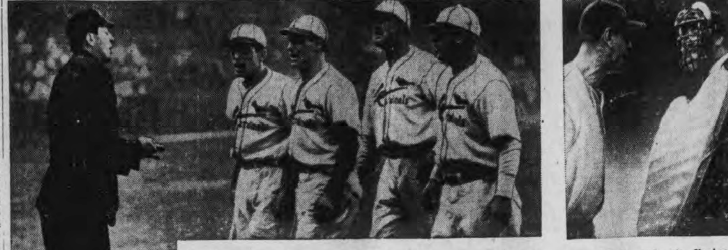
Nowadays the umpire's boss and if the boys don't like his attitude they can take a walk—but it'll cost them. In the "good old days" the ump was always wrong.

witnessed. Pictures of militant batsmen calling the ball-and-strike judge a bum have appeared with astounding regularity in the daily papers since April.