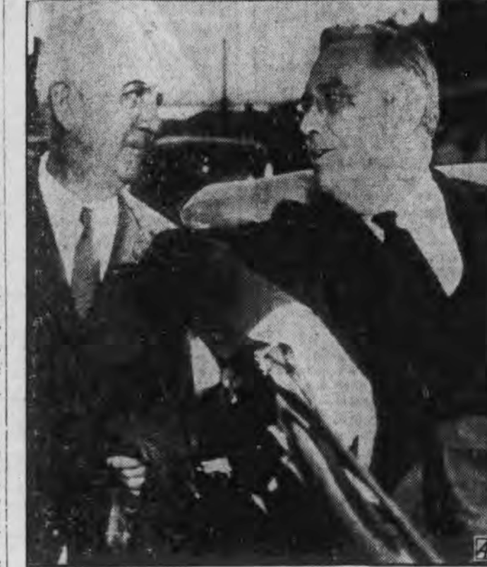
An intent listener, President Roosevelt (right), receives first-hand information of the undeclared Sino-Jap war as he confers at length with Norman Davis, United States ambassador-at-large to Europe. Davis came to Hyde Park where the President is vacationing, to report to his chief. Roosevelt has pledged to "do everything possible to keep the United States out of war."