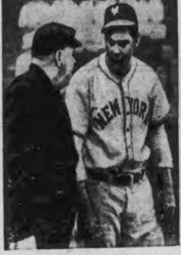
Bill Terry, player and manager, looks like this when he protests a decision—but you oughta hear him.