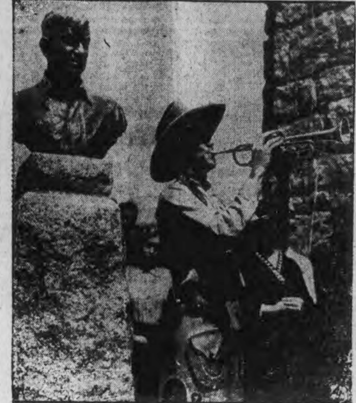
High up on Cheyenne mountain near Colorado Springs, a bronze bust of the late Will Rogers, beloved cowboy humorist, was unveiled Labor day at ceremonies dedicating the shrine of the Sun in his memory. A member of a cowboy band from Hardin-Simmons college at Abilene, Texas is seen blowing taps beside the bust.