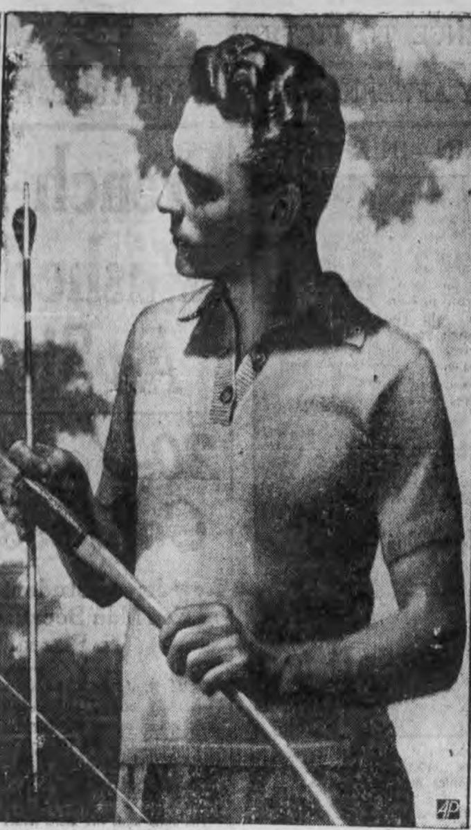
HAND KNIT SPORTS SHIRT —Something smart in the way of sports shirts is worn by this young archery fan. It is hand knit of caramel brown worsted yarn and finished with narrow ribbed bands.