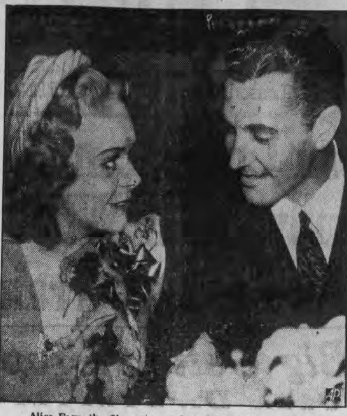
Alice Faye, the film actress who used to sing for Rudy Vallee's orchestra, and her brand-new husband, Tony Martin, also of the films, are shown honeymooning in Hollywood after their elopement to Yuma, Ariz. They met last winter when they were cast together in "Sing, Baby, Sing."

the Philippines to a point where even a first class power would consider it too expensive to conquer them. The total Philippine budget for 1937 is roughly $33,000,000 of which about $8,000,000 is for defense.