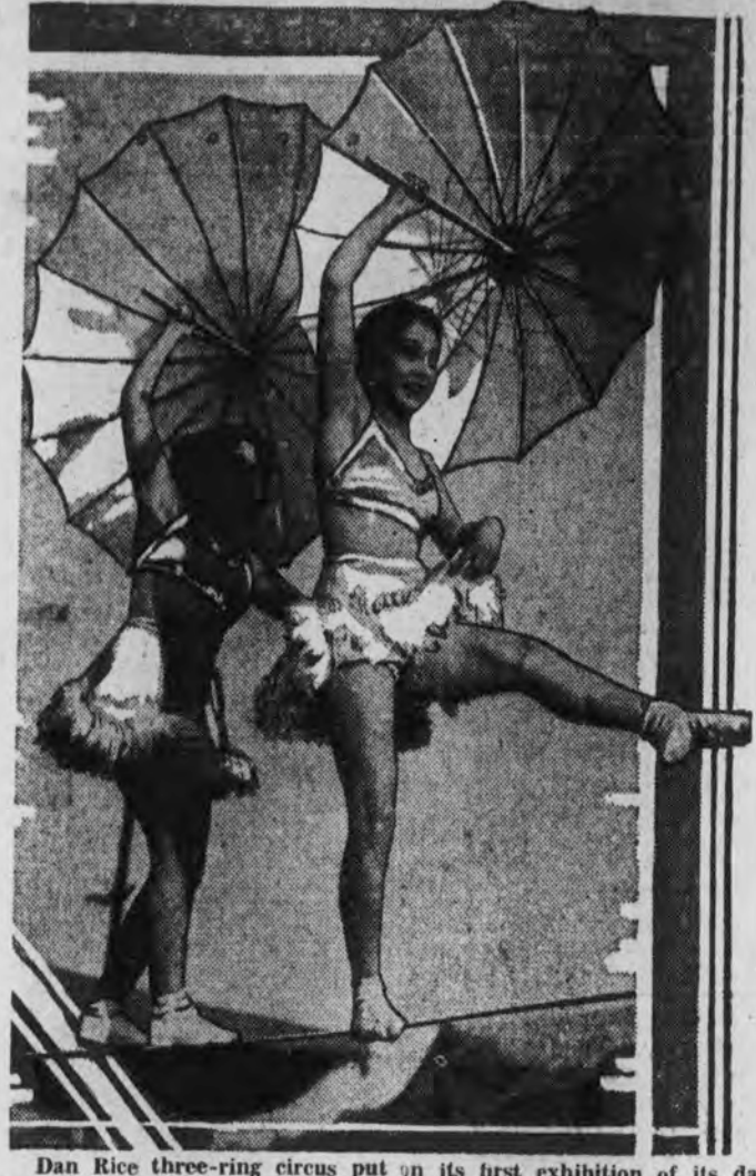
Dan Rice three-ring circus put on its first exhibition of its days stay here this afternoon to a good crowd and will show again here tonight at 8 o'clock. Unloading was completed before noon and the menagerie and big top were in tip-top shape for the initial performance. The tents are located between Dickinson avenue and Chestnut street, this side of the underpass.