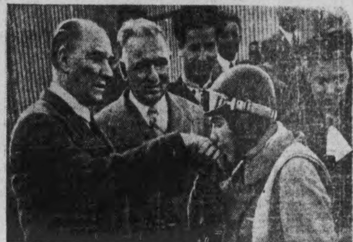
MY BELOVED FATHER

Sabiha Guekhen, the "Flying Amazon of Turkey," shown in her plane (at top) and kissing the hand of her foster father, Kemal Ataturk (above), was trained for her daring career in the regular Turkish army air force school.