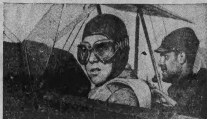
NEVER AFRAID IN THE AIR