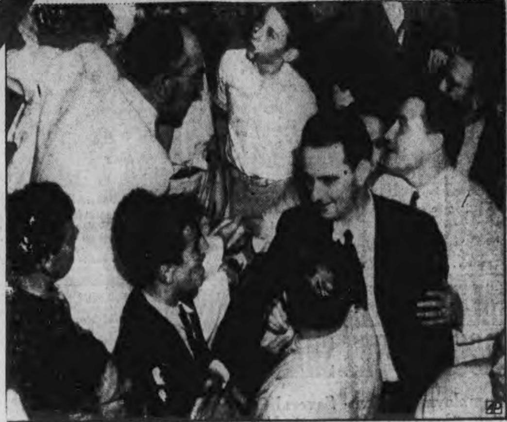
Representatives vied with pages to reach the side of Speaker William B. Bankhead (D.-Ala.), (left in white suit), as congress, leaving many important matters until next session, adjourned after eight months in Washington. This overhead picture shows the general confusion which prevailed after the speaker banged his gavel and announced the house in adjournment.