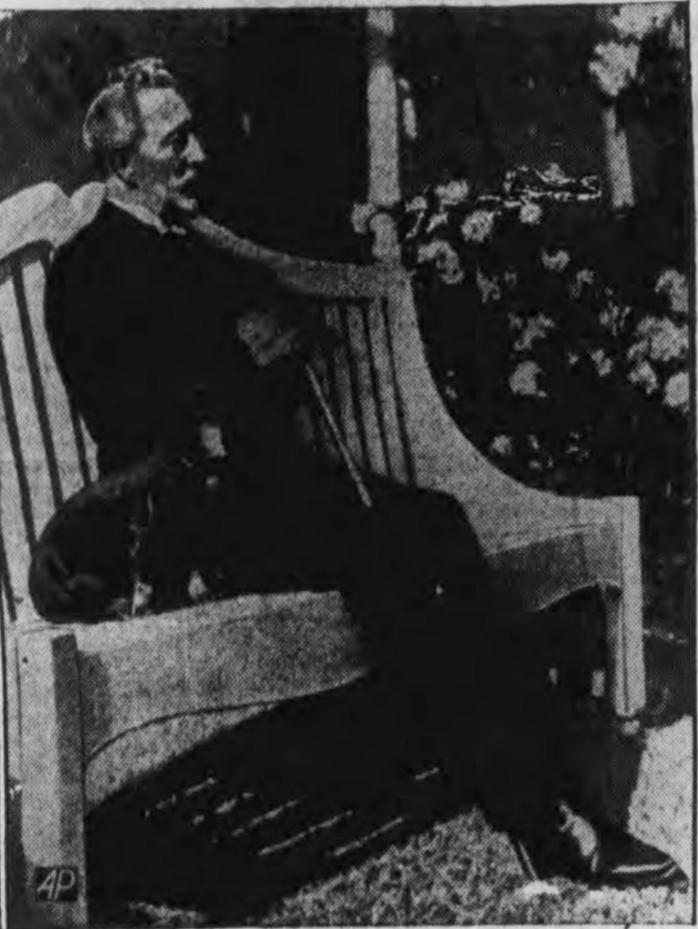
HIS PLACE IN THE SUN Here's the former Kaiser of Germany at Doorn, sitting with his daschund on a knoll that overlooks his rose garden.

By J. A. BOUMAN DOORN, Holland (AP)—Twenty-three years ago August 1 Germany declared war on Russia and Wilhelm II signed the general mobilization order.