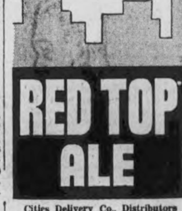
Cities Delivery Co., Distributors

RIDIN' HIGH IN PUBLIC FAVOR Yes everybody likes RED TOP. Its quality and flavor wins 'em all.