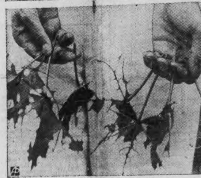
Officials of Georgia, Florida, Louisiana, Tennessee and Mississippi are preparing to wage a mighty battle against the newest enemy of King Cotton—the Argentine weevil. The repulsive little pest, (top) already has invaded some sections of the south. Below, is a stalk of cotton which he and his kin ravaged near Lockhart, Ala.